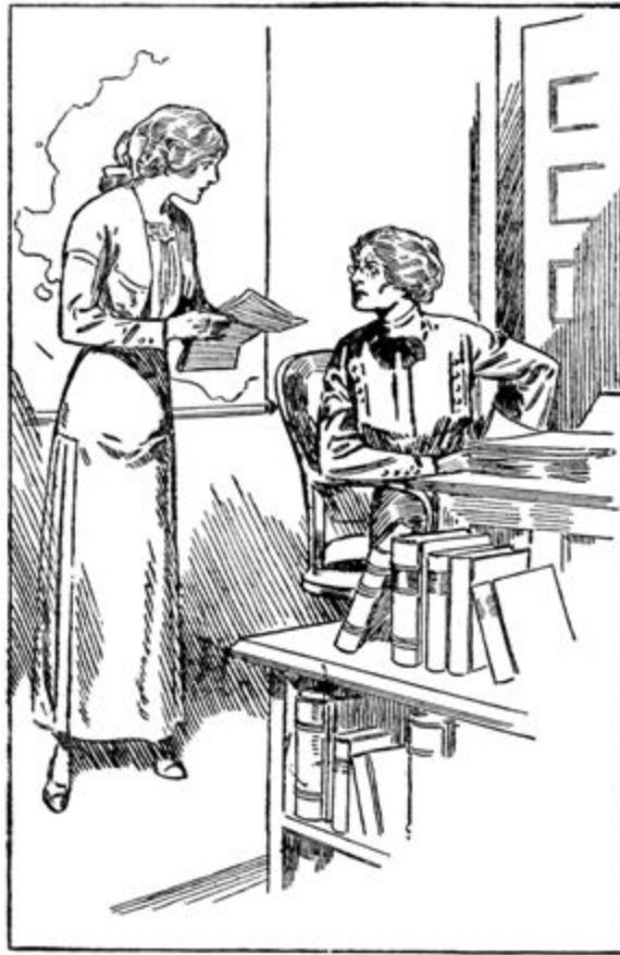
"It is My Theme."