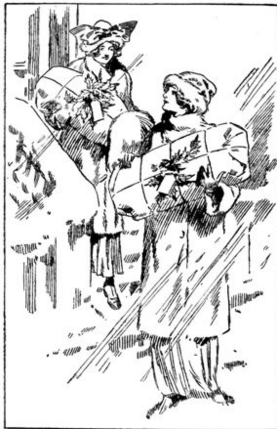
Each Girl Carried an Unwieldy Bundle.