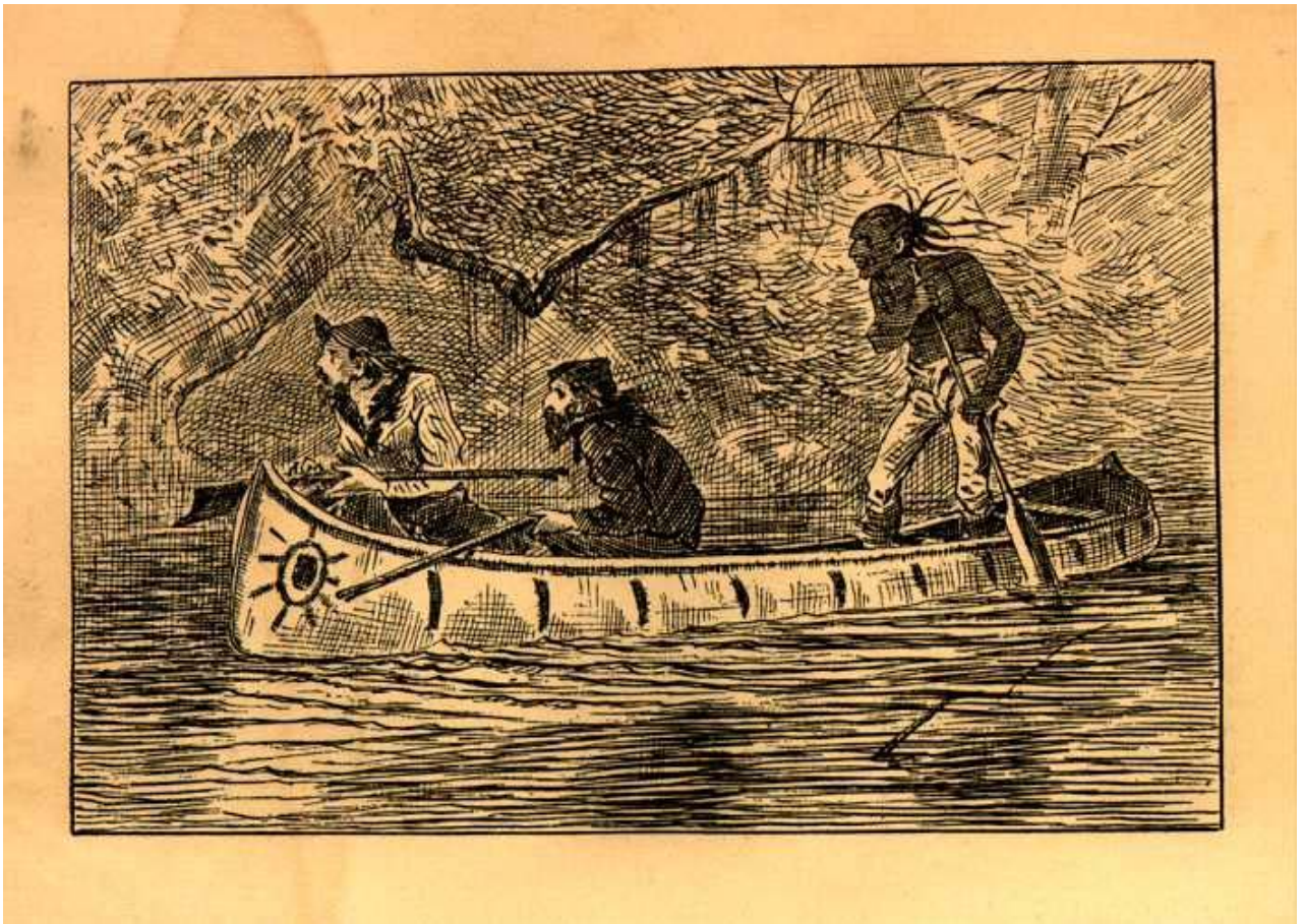
Three men and a canoe

There was a table in the centre of the room, with choice liquors upon it. The carpet beneath the table covered only a small portion of the floor, leaving on each side a vacant space around the room. The men cautiously walked around this space, without daring to put their feet upon the carpet. After many solicitations from Dr. Butler, and seeing him upon the carpet, they ventured up to the table and drank. They, however, were under great restraint, and soon left, manifestly not pleased with their reception.