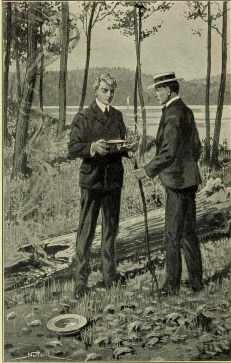
"IT'S THE BLUE BOX, SURE ENOUGH," SAID JOE.— Page 209.

IT'S THE BLUE BOX, SURE ENOUGH, SAID JOE. -- Page 209.