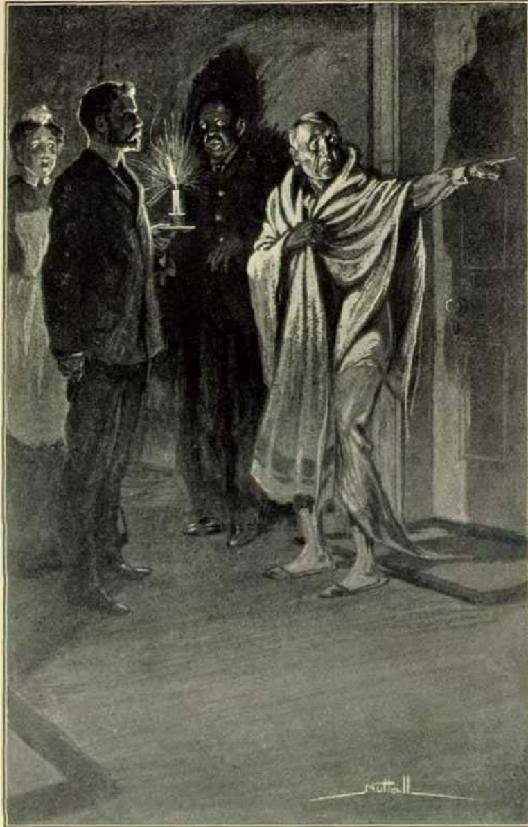
"YOUR HOTEL IS HAUNTED." WAS THE ANSWER.—Page 100

"YOUR HOTEL IS HAUNTED," WAS THE ANSWER. -- Page 100