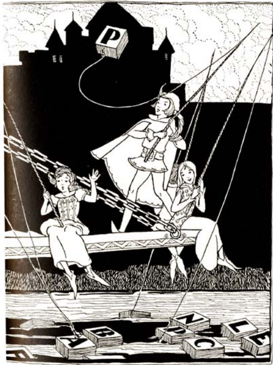
Promotes People Young in School