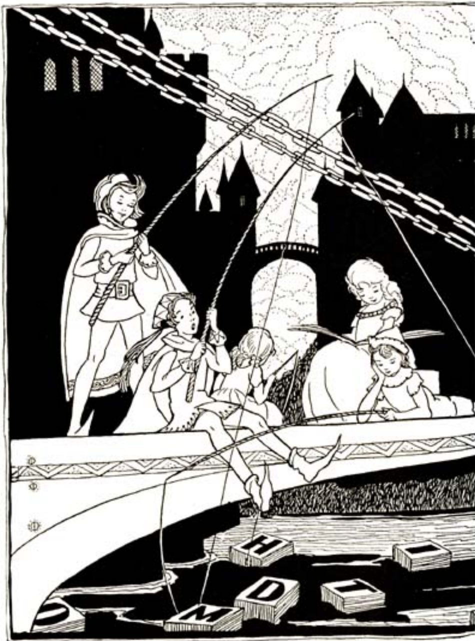
Peter Piper's Fishing Pool