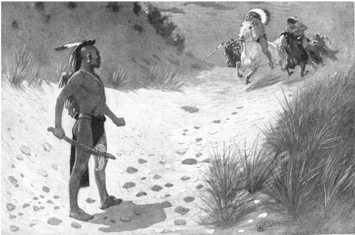
THEY COULD NOT HURT HIM