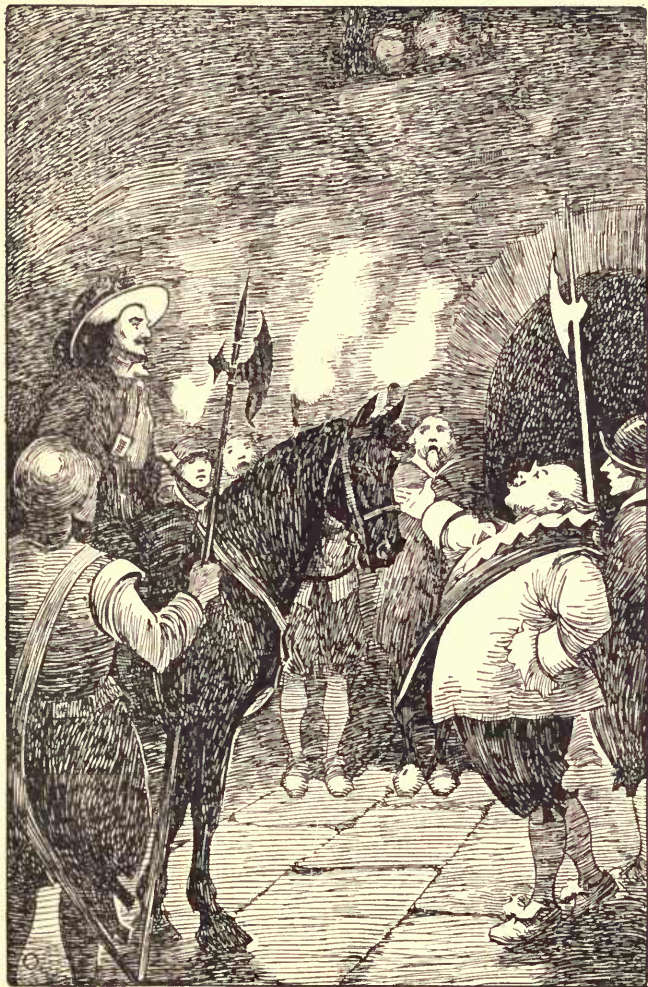
HE WAS A TALL, GALLANT CAVALIER, MOUNTED ON A BLACK STEED