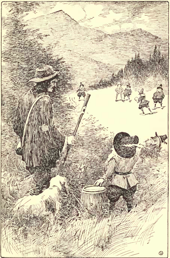
ON THE LEVEL SPOT IN THE CENTRE WAS A COMPANY OF ODD-LOOKING PERSONAGES PLAYING AT NINE-PINS