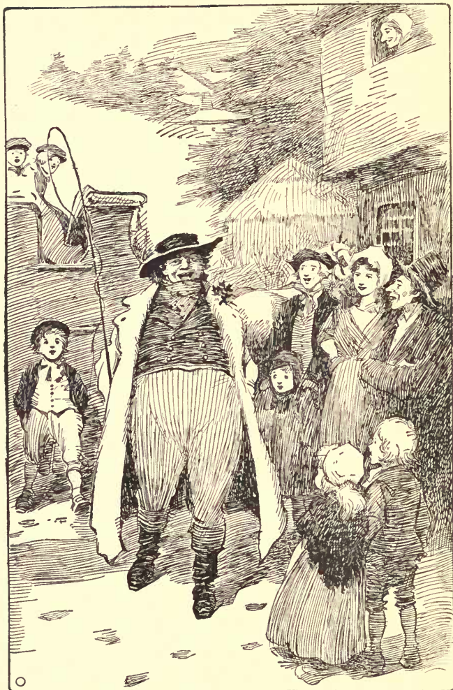
HE ROLLS ABOUT THE INN YARD WITH AN AIR OF THE MOST ABSOLUTE LORDLINESS (PAGE 222)