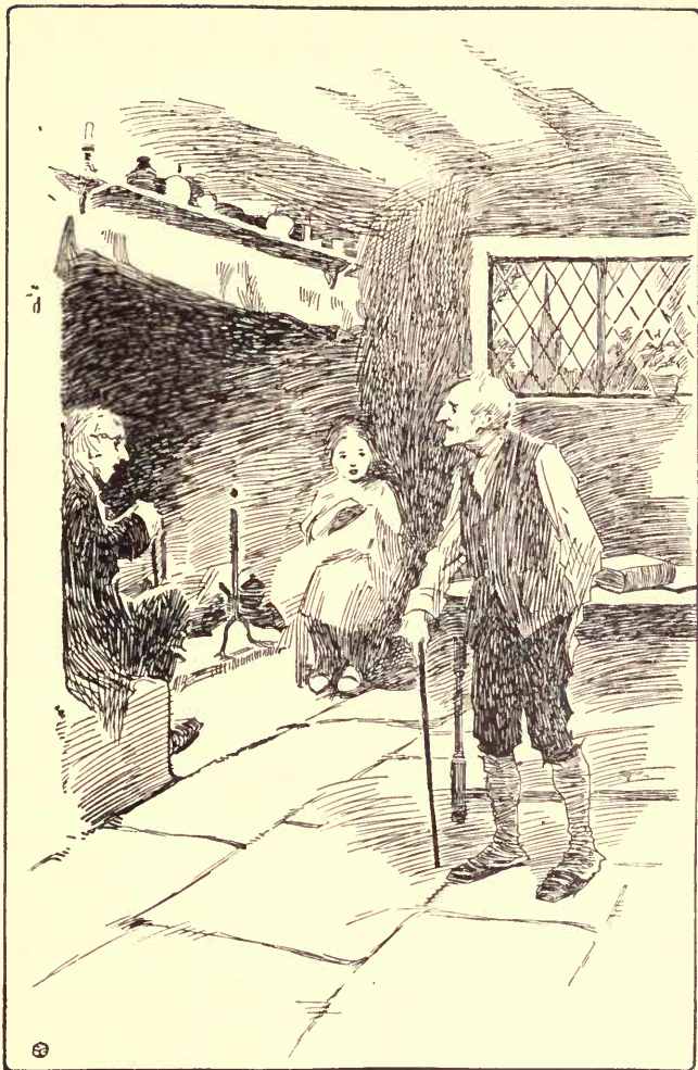
A LOW WHITE-WASHED ROOM, WITH A STONE FLOOR CAREFULLY SCRUBBED, SERVED FOR PARLOR, KITCHEN, AND HALL