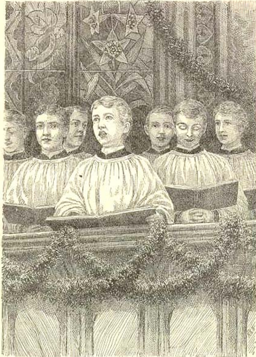
"MY AIN COUNTRIE." Page 64