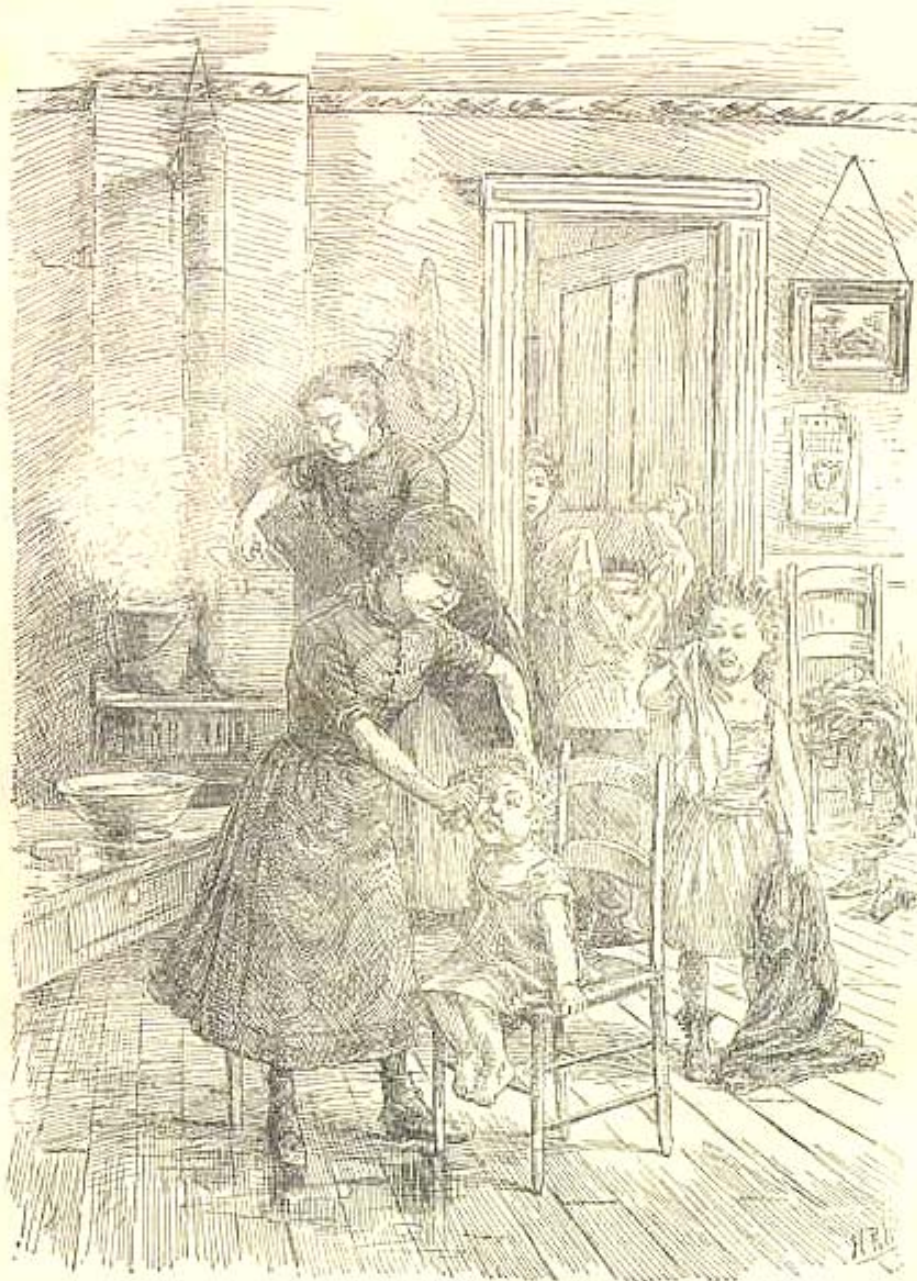
"THE LITTLE RUGGLESES BORE IT BRAVELY." Page 42.