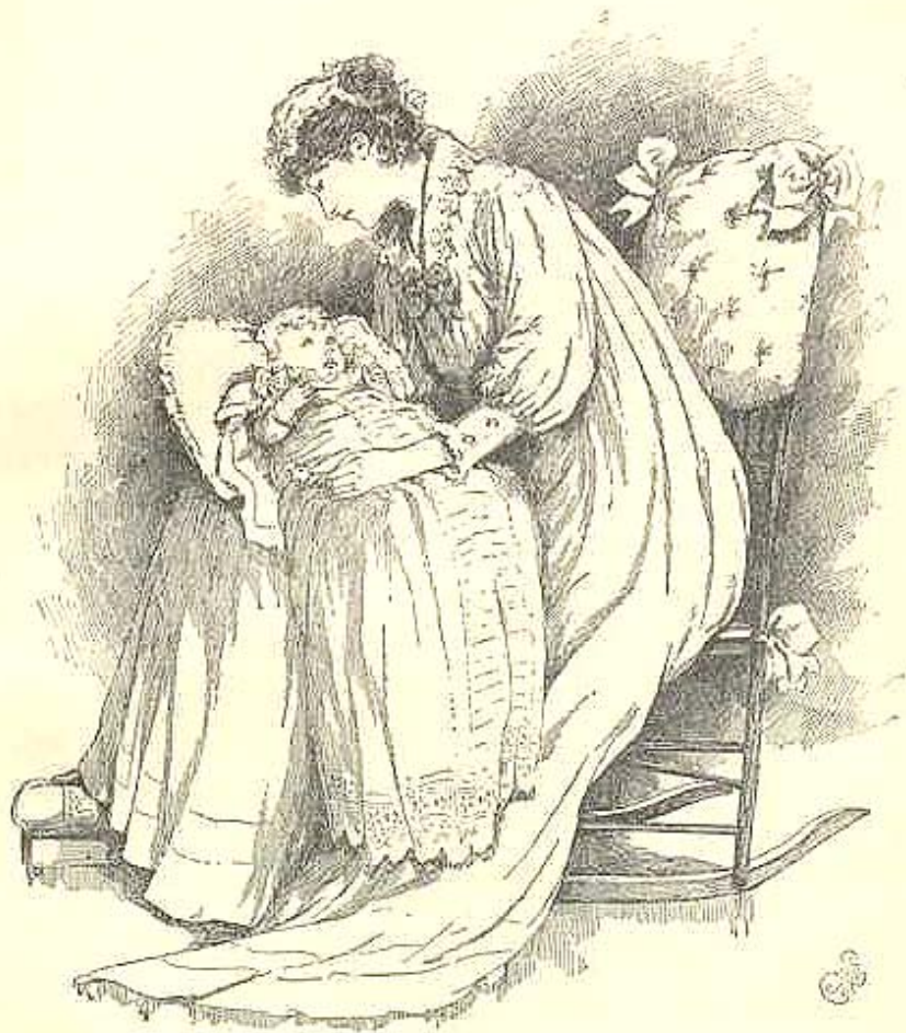
"SHE IS A LITTLE CHRISTMAS CHILD" Page 15.