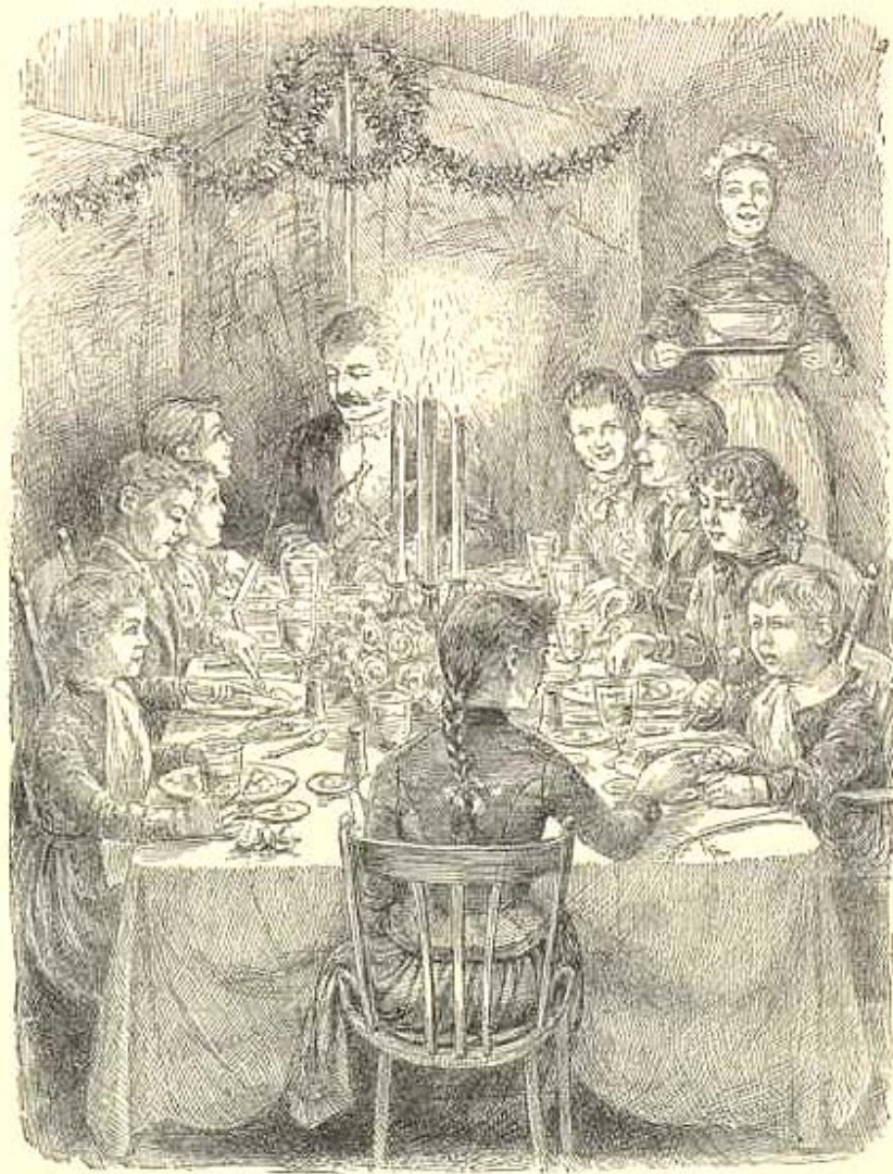
"THE RUGGLESSES NEVER FORGOT IT." Page 55.