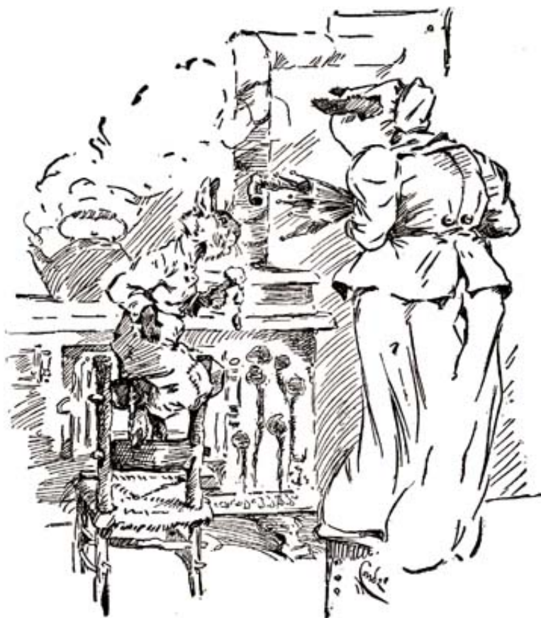
LITTLE JACK KNEW PERFECTLY WELL THAT SHE WASN'T AT ALL PLEASSED

And just at that moment Mrs. Rabbit herself stepped in the door! And when she looked at her red-spotted and striped stove and then at little Jack Rabbit, little Jack knew perfectly well without her saying a single word that she wasn't at all pleased . So he began to cry very loud, and started to run, and tripped over his blocks and fell against a little stand-table that had Mrs. Rabbit's work-basket on it (for Mrs. Rabbit always knit or sewed while she was cooking anything), and all the spools and buttons and knitting-