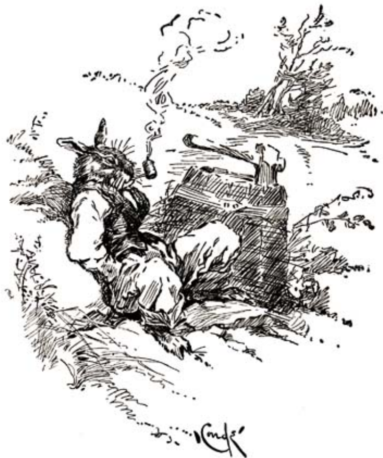
GRANDFATHER WOULD LIGHT HIS PIPE AND THINK IT OVER

"And one morning, as he sat there thinking, he made up his mind what he would do. Mr. Lion lived in the Big Deep Woods in those days, and he was King. Whenever anything happened among the Deep Woods People that they couldn't decide for themselves, they went to where King Lion lived, in a house all by himself over by the Big