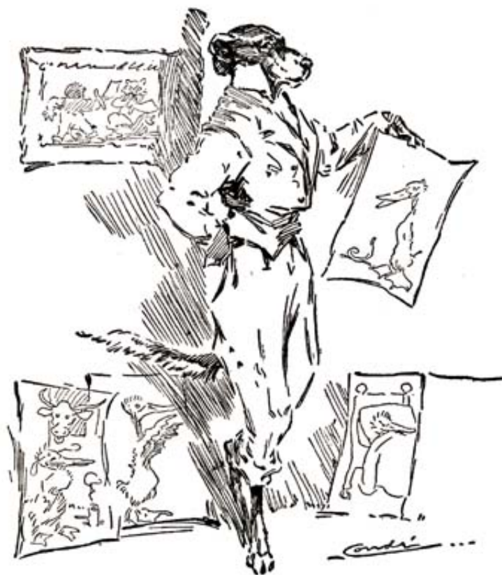
MR. DOG SAID HE HAD MADE A FEW SKETCHES

His mother said the great worm was a water-snake, and she told Erastus snake-stories which gave him bad dreams.