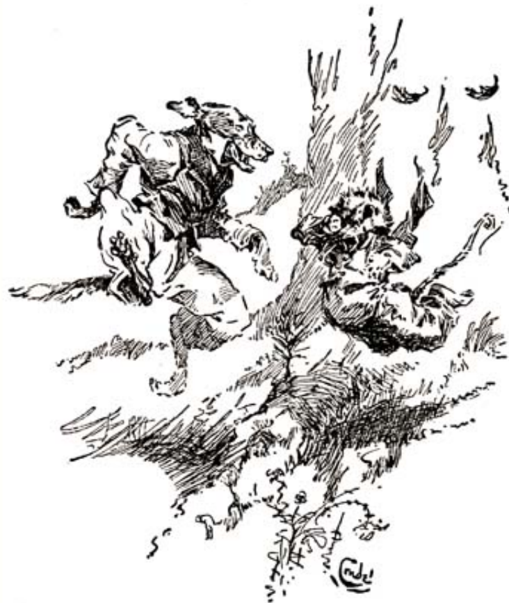
CAME CLATTERING DOWN RIGHT IN FRONT OF MR. DOG

And then Mr. Dog would remember that he was a good ways from home, and that if he wasn't there in time to help