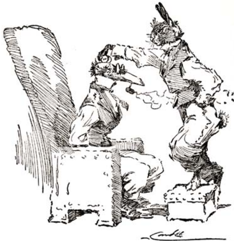
WOULD FIND IT ON THE MANTEL-SHELF OR PERHAPS ON MR. CROW'S BALD HEAD

though often nobody can find out just what it is, and the less they seem to mean the better they are, as adages. There are a great many old adages in our family, and they have often got my ancestors out of trouble. When we didn't have an old one to fit the trouble we made a new one, and by-and-by it got old too, and useful in different ways, because by that time it didn't seem to mean anything special, and could be used almost anywhere."