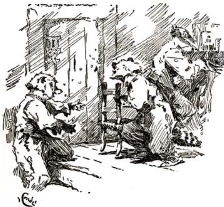
LISTENED NOW AND THEN AT WIDOW CROW'S DOOR TO BE SURE SHE WAS ASLEEP

That woke up Widow Crow with a jump, and she sat up in bed and called "Thieves!" and "Help!" and Mr. Crow ran to her door and said that it wasn't anything, only those scamps Mr. 'Possum and Mr. 'Coon had been out late again.