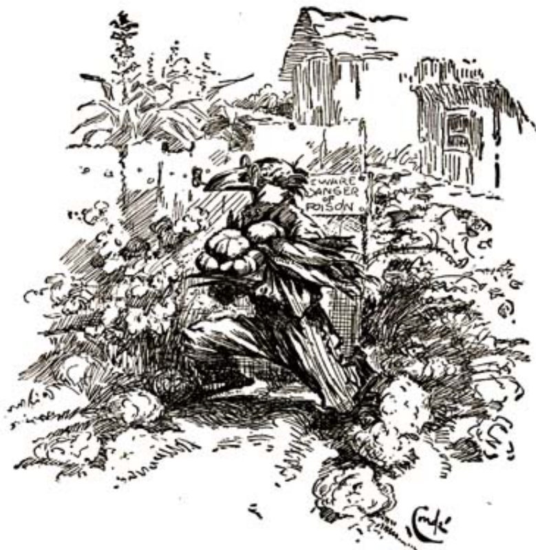
MR. CROW DECIDED TO THIN OUT A FEW OF JACK RABBIT'S THINGS

So Mr. Crow picked some large ears of corn and some of Mr. Rabbit's best pease and beans and salads, and filled his apron with all he could carry, and climbed through the back fence again, and took out for home without wasting any more time. And when he got there Mr. 'Coon and Mr. 'Possum were just getting up, and he didn't bother to tell them about borrowing from Mr. Rabbit's garden, but set out some breakfast, and as soon as it was over pitched in to get ready for company. Mr. 'Coon and Mr. 'Possum flew around, too, to make the room look nice, and by-and-by everything was ready, and the table was set, and the Hollow Tree People were all dressed up and looking out the window.