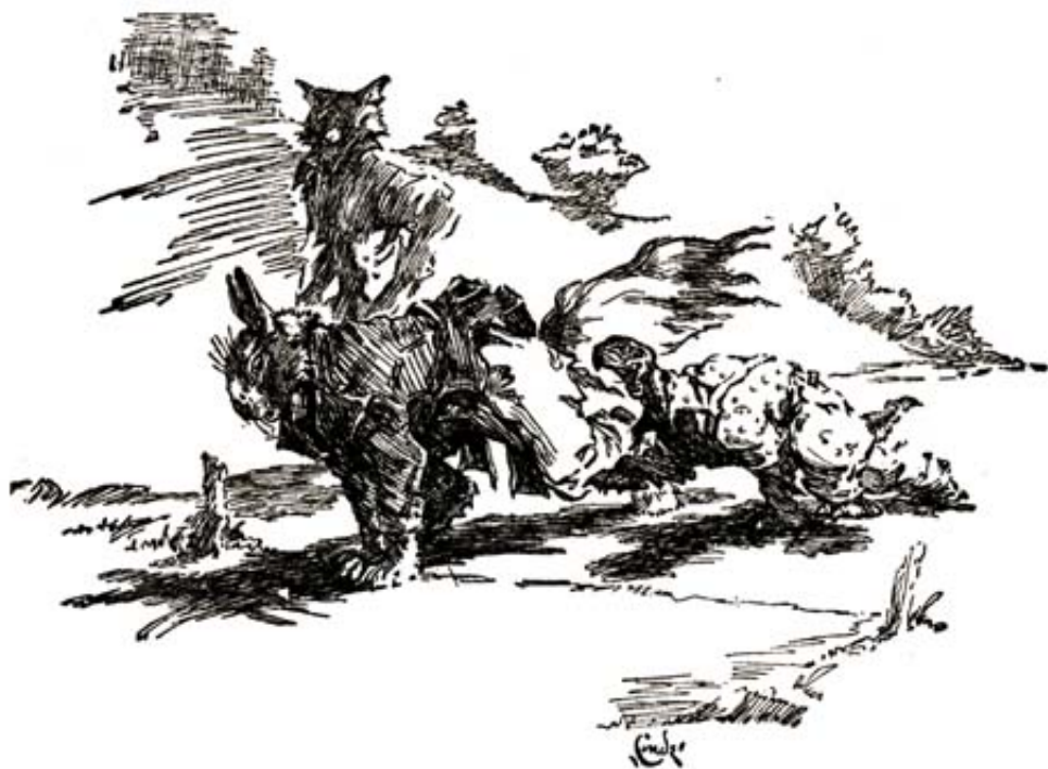
MR. FOX SAID HE DIDN'T HAVE MUCH TO DO FOR A FEW MINUTES AND HE'D ACT AS JUDGE

"Well, he put Mr. Tortoise and my twenty-seventh great-grandfather side by side, and then he stood off and said, 'Go!' and thought it would all be over in a minute.