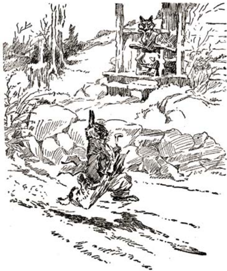
SET UP HIS EARS AND WENT BY, LICKETY-SPLIT

"My Grandfather Hare didn't stop a minute after he thought of that, but just set out for King Lion's house over at the foot of the Big West Hills. He had to pass by Mr. Fox's house, and Mr. Fox called to him, but Grandpaw