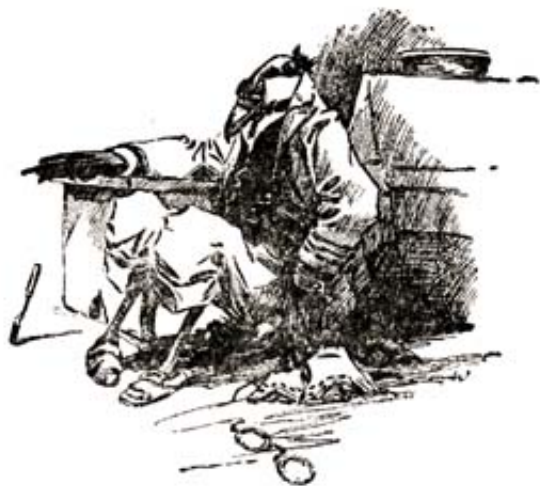
THE GREEDY OLD RAVEN, BUT GREEDY NO MORE

But he firmly refused and at last they departed, While the greedy old crow for the dining-room started, And the pie so delicious he piled on his plate, And he ate, and he ate, and he ate, and he ate!