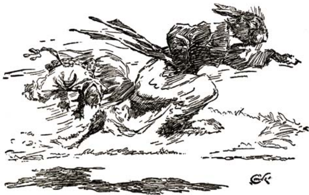
SAILING ALONG, JUST TOUCHING THE HIGHEST POINTS

“But Mr. Fox made a mistake about that. Grandpaw Hare was really ahead, of course, when he came down the homestretch, but when he got pretty close to the fence he