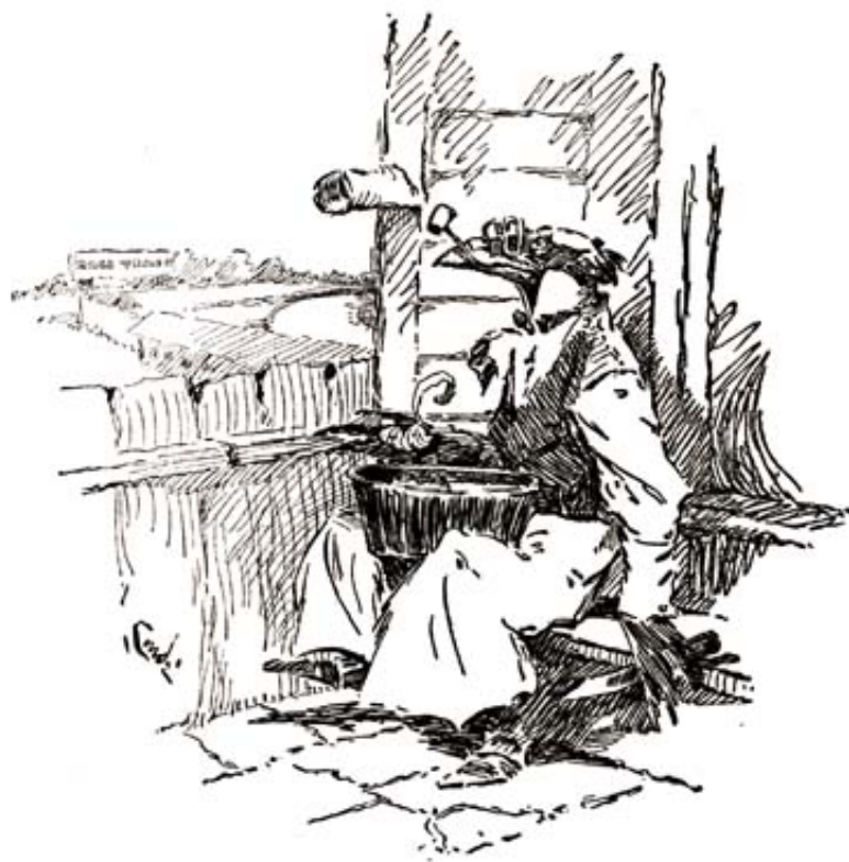
HAD TO STAY AT HOME AND PEEL POTATOES

So then Mr. Crow and Mr. 'Coon and Mr. 'Possum all got together and talked it over. And Mr. Crow said they might be pretty tired of it, but that they couldn't in a hundred years, thinking night and day, think how tired of it he was. He said if they would just say the word he would take the things that belonged to him out of that house, and the three of them would find some good place and all live together, and never have anything more to do with mothers-in-law or their families. He said he knew how to cook as