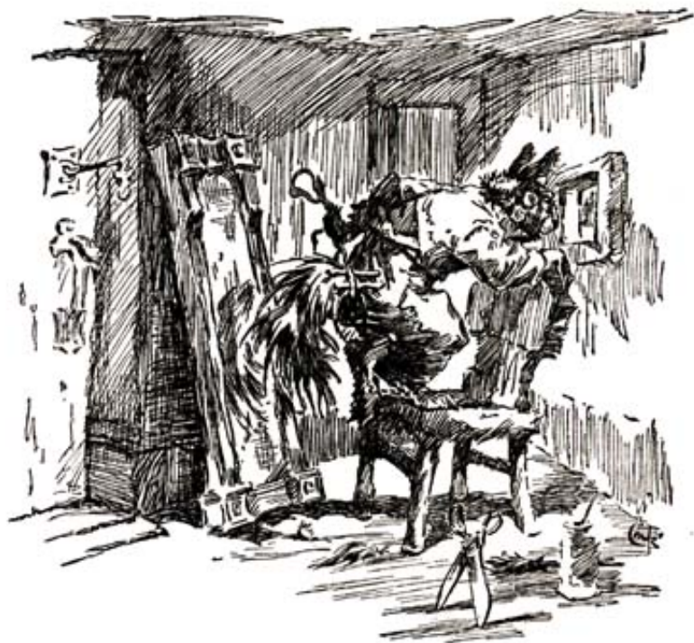
TRIED TO SPLICE HIS PROPERTY BACK IN PLACE

"Well," he said, "my twenty-seventh great-grandfather Hare didn't go out again for several days. He put up a sign that said 'Not at Home,' on his door, and then tried a few experiments, to see what could be done.