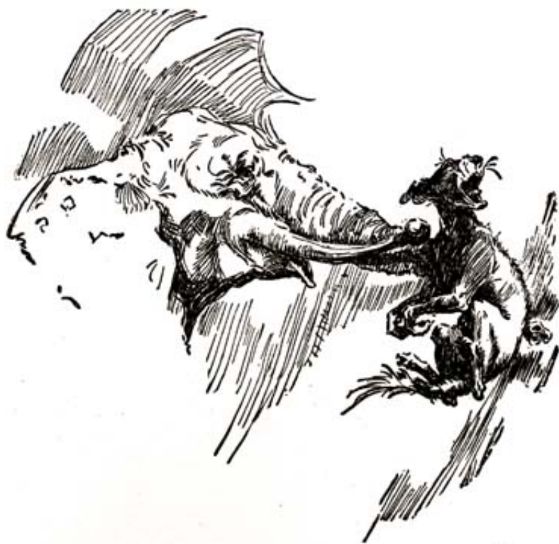
“GAVE ME AN EXTRA BIG SWING AND CRACK”

“That's what a menagerie is—it's a place where they have all the kinds of animals and things in the world, for show, and a good many birds, and maybe turtles, too, but they don't have any fine clear pond. They have just a big tent, like the one Mr. Crow saw, and a lot of cages inside. They keep most of the animals in cages, and they ought to keep them all there, and I don't think they feed them