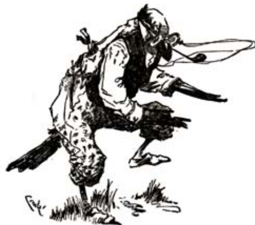
THE TASTIEST PASTRY THAT EVER WAS KNOWN

Then away to the market he hurried full soon, Dropping in for a chat with the 'possum and 'coon Just to tell them his plans, which they heard with delight, And to ask them to call for a moment that night