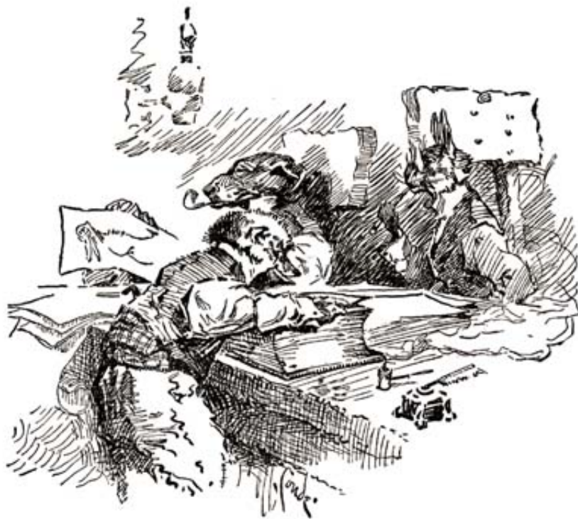
GOT AROUND THE TABLE AND BEGAN TO WORK

Mr. Rabbit wasn't very long at his piece, and pretty soon he jumped up and said he was through, and Mr. 'Possum said that if that was so, he might go down and bring up some wood and warm up the brains of the rest of them. So Mr.