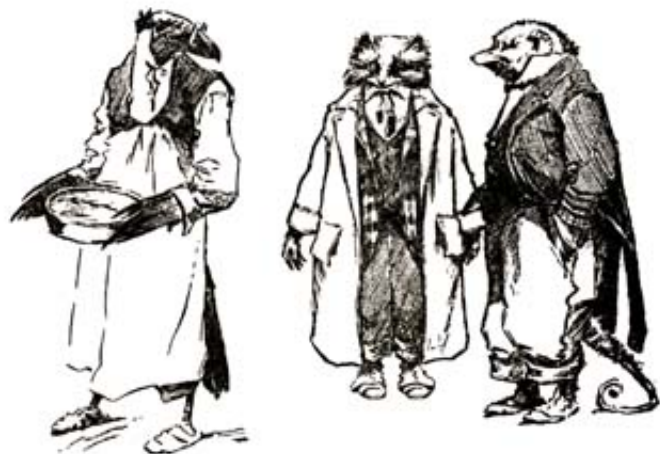
WITH A LOOK AND A SIGH THEY WOULD STAND AND BEHOLD

With a look and a sigh they could stand and behold All the puddings so brown and the sauces of gold; With a taste and a growl they'd reluctantly go Praying vengeance to fall on that greedy old crow.