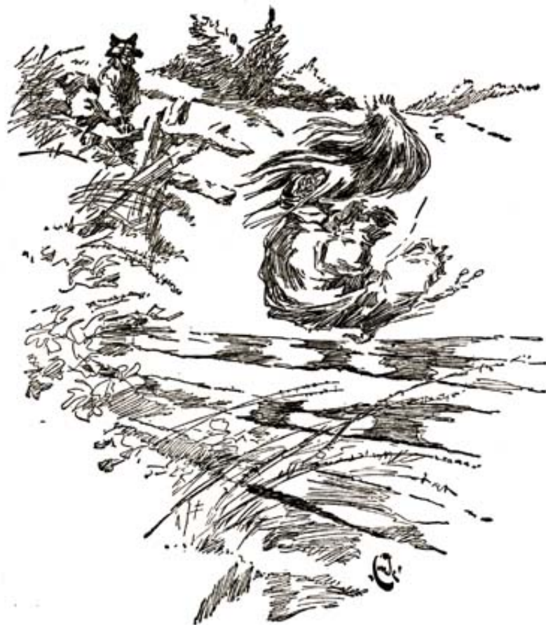
AWAY WENT MR. TORTOISE, CLEAR OVER THE TOP RAIL

"Then my ancestor remembered about the race and forgot his other loss for a minute, and declared that Mr. Tortoise didn't win the race at all—that he couldn't have covered that much ground in a half a day alone, and he asked Mr. Fox if he was going to let that great straddle-bug ruin his reputation for speed and make him the laughing-stock of