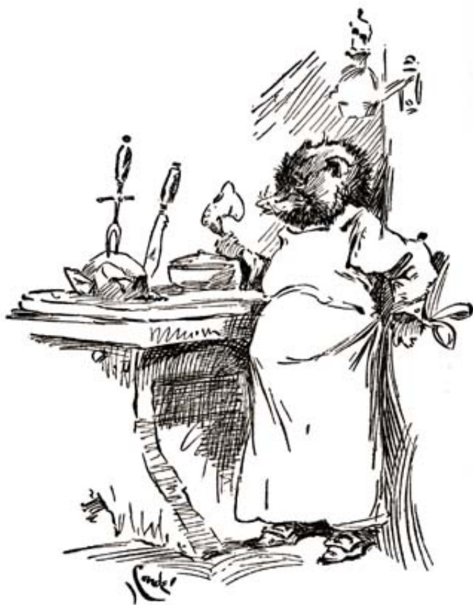
AND HE TASTED OF THAT A LITTLE, TOO

hot weather lasted. Then they were all so hungry that they began on the chicken right away, and Mr. 'Possum said that maybe he might have picked out a tenderer one, but that he didn't think he could have found a bigger one, or one that would have lasted longer, and that, after all, size and lasting were what one needed for a picnic.