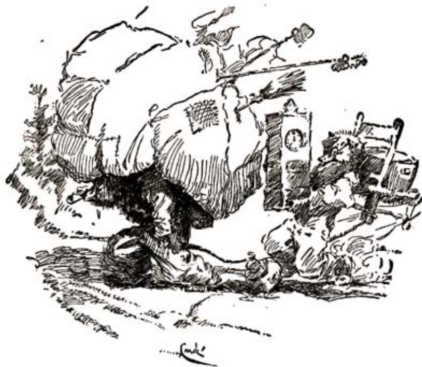
AUNT MELISSY HAD ARRANGED A BUNDLE FOR UNCLE SILAS, AND SHE HAD FIXED UP THE HIRED MAN TOO

It was pretty early when we started, for it was getting