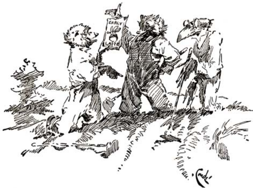
ONE SAID IT WAS ONE WAY AND THE OTHER THE OTHER WAY

Well, after that they got up every morning and went out to look at their garden, to see if any of the things were coming up; and pretty soon they found a good many things coming up, but they were not in hills and rows, and Mr. 'Possum said they were weeds, because he remembered that Uncle Silas's weeds had always looked like those, and how he and his little cousins had had to hoe them. So then they got their hoes and hoed every morning, and by-and-by they had to hoe some during the day too, to keep up with the weeds, and the sun was pretty hot, and Mr. 'Possum did most of his hoeing over by the trees where it wasn't so sunny, and said that hereafter he thought it