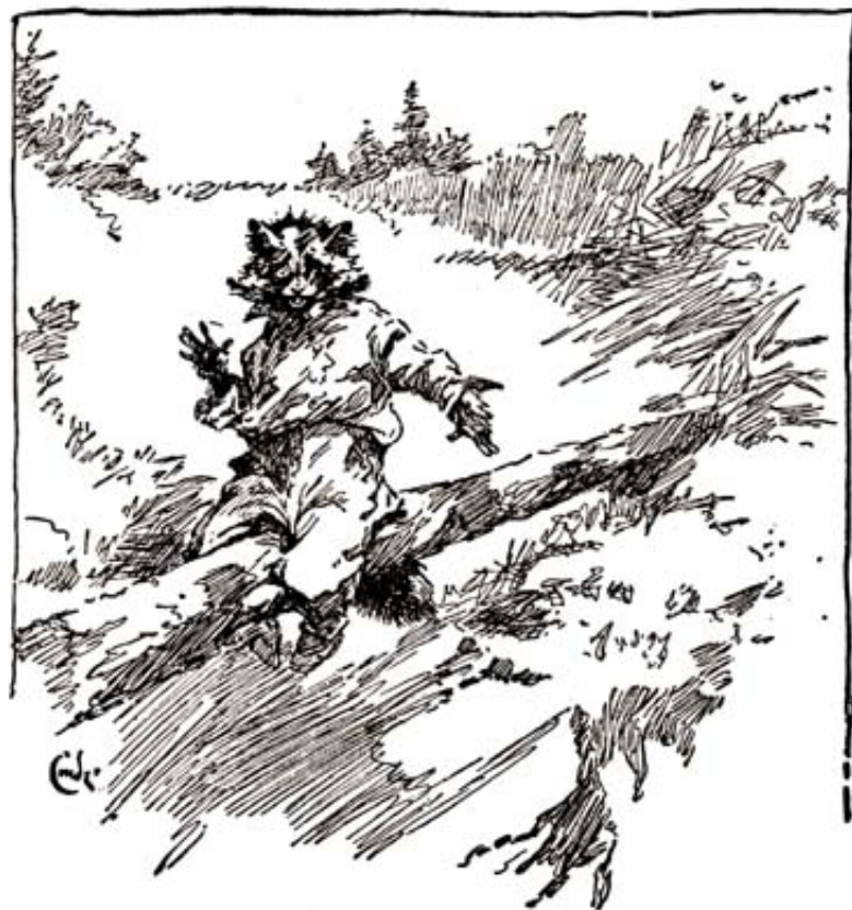
ALL AT ONCE HE HEARD A FIERCE BARK CLOSE BEHIND HIM

“Of course I laid pretty low when I heard that,” Mr. ’Coon said, “for I knew that Mr. Man would most likely have a gun, so I got into a bunch of leaves and brush that must have been some kind of an old nest and scroched down so that none of me would show.