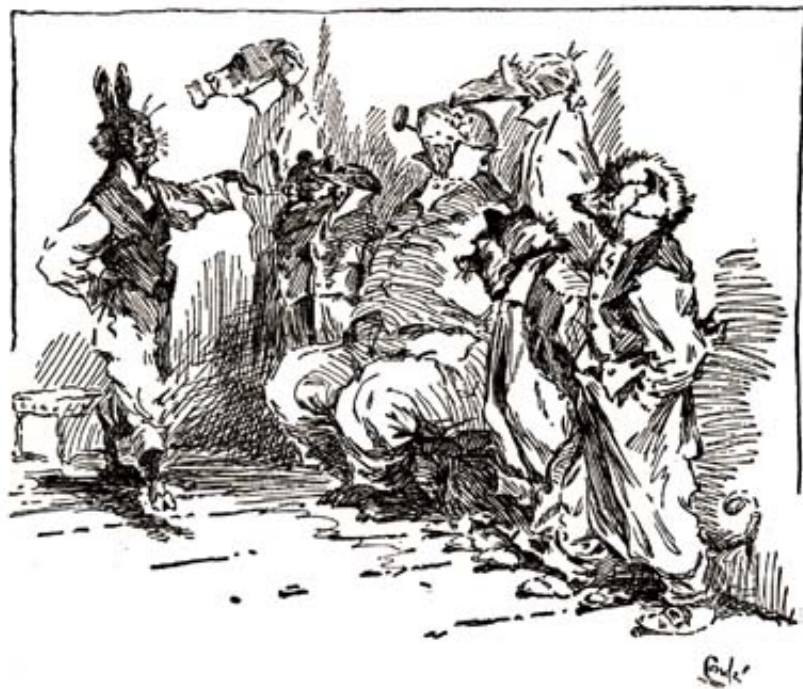
SO THEN MR. RABBIT SAID THEY MUST CHOOSE WHO WOULD BE "IT"

which was a rigmarole Mr. Rabbit had made up himself to use in games where somebody had to be "It," and Mr. Rabbit said it around and around the circle on the different ones—one word for each one—until he came to the word "blind" and that was Mr. 'Possum, who had to put on the handkerchief and do more exercising than any of them, until he caught Mr. Turtle, who had to be "It" quite often,