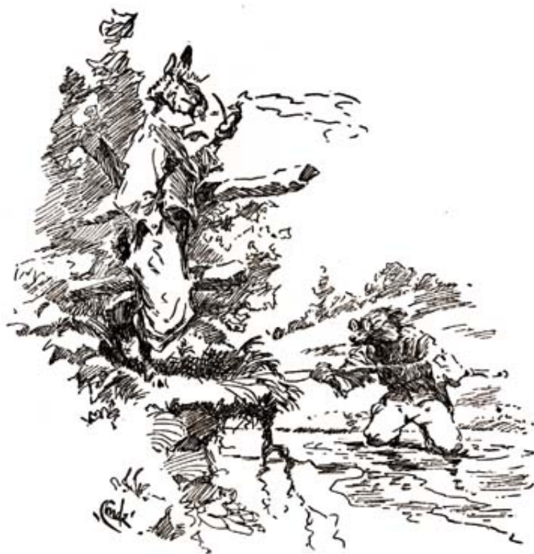
MR. RABBIT THANKED HIM FROM ACROSS THE RIVER

No, he woke up again pretty soon, for he had finished