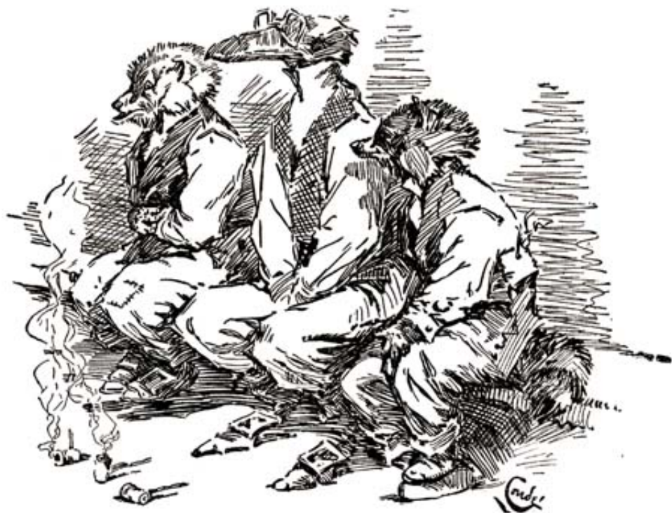
MR. 'POSSUM SAID IT MIGHT BE A GOOD ENOUGH STORY, BUT IT COULDN'T BE TRUE

Then before any of the others could say a word, Mr. 'Possum said that it might be a good enough story, but that it couldn't be true. He said that he wasn't a judge of stories, but that he was a judge of ducks—young ducks, or old either—and that no young duck could pass the night in the Big Deep Woods and get home at sunrise or any other time, unless all the other animals were snowed in or locked up in a menagerie, and that the animal that had met