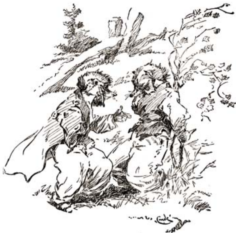
MR. 'COON SCRATCHED HIS BACK AGAINST A LITTLE BUSH

And Mr. Bear said he didn't understand how he could have such a good appetite when he had such a big supper only two hours ago, and he said that there must have been two earthquakes, because a noise of some kind had roused