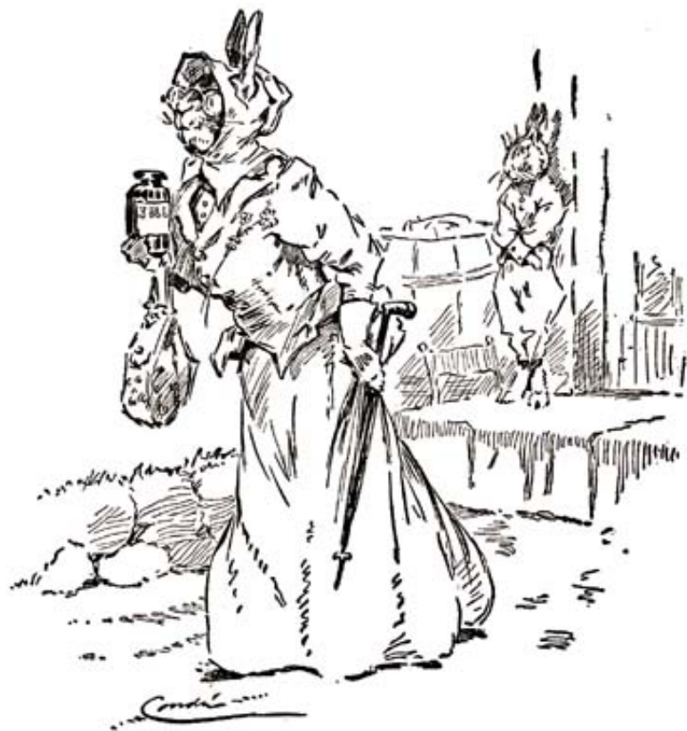
TOOK HER PARASOL AND HER RETICULE AND A CAN OF BERRIES, AND STARTED

Then little Jack Rabbit looked at the nice polished stove and wondered how it would be to use that, and to build a little fire in it—just a little fire—which would make every-