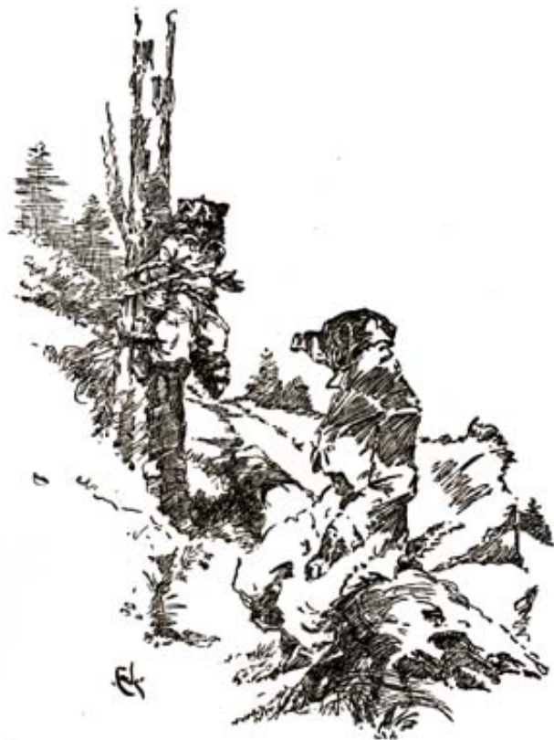
"THEN MR. DOG SAID, 'TELL ME ANOTHER'"

"I felt a good deal better when I heard Mr. Dog say that, and I told him a story I knew about how Mr. Rabbit lost his tail, and Mr. Dog laughed and seemed to like it, and said, 'Tell me another.'"