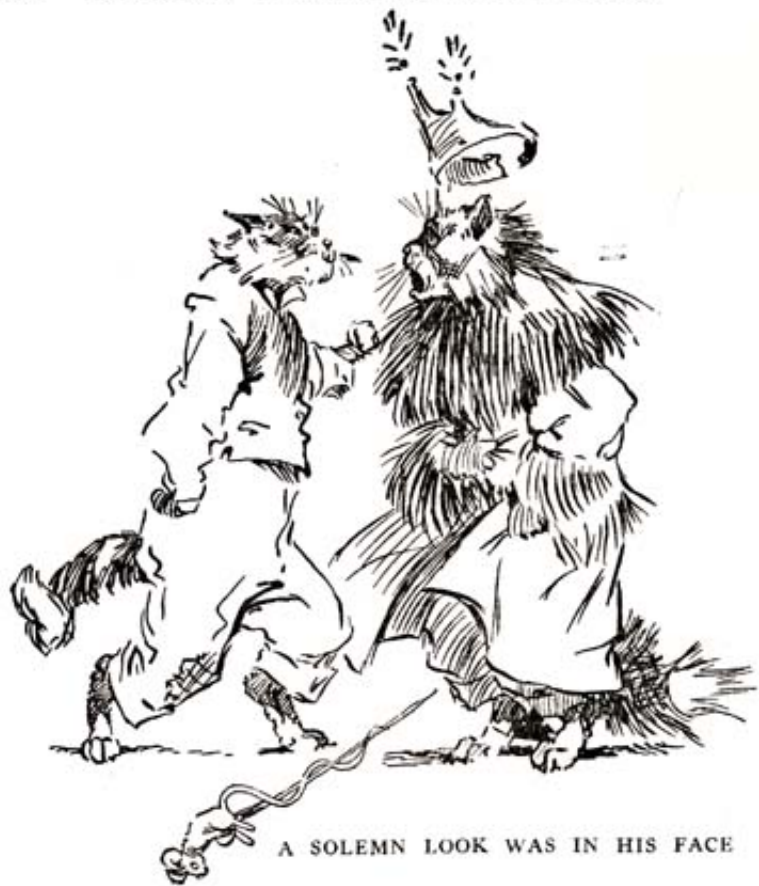
A SOLEMN LOOK WAS IN HIS FACE

While happy in his tin-shop crown Each day the king went marching out, Elate because He thought he was The kind of king you read about.