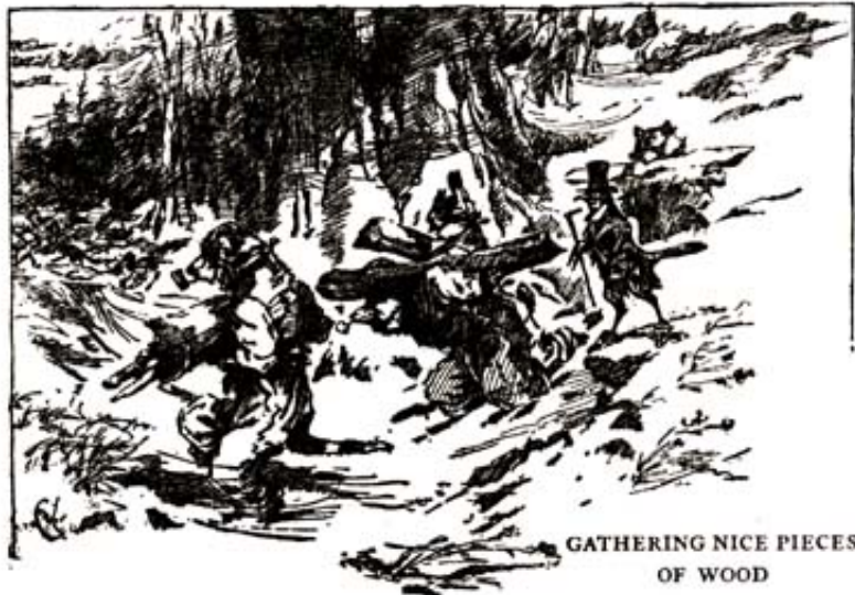
GATHERING NICE PIECES OF WOOD