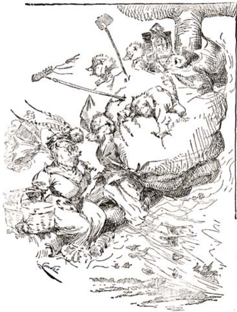
THE BALLOON WENT OVER THE WIDE BLUE WATER JUST AFTER IT GOT OUR FAMILY

thought at first they were throwing at us, but it must have been something to make the balloon go up; for we did go up until Aunt Melissy said if we'd just get a little nearer one of those clouds she'd step out on it and live there, as she'd always wanted to do since she was a child.