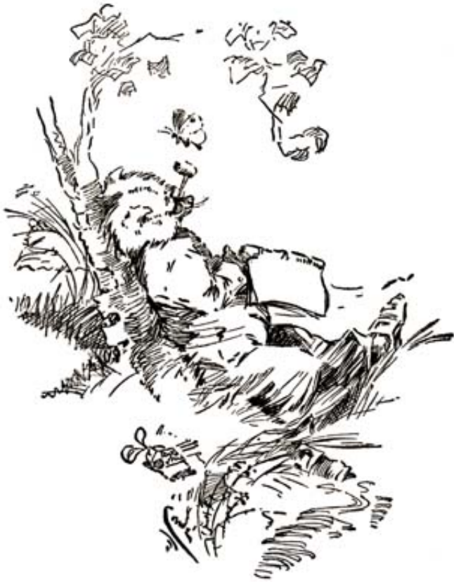
MR. 'POSSUM LEANED HIS BACK AGAINST A TREE AND READ HIMSELF TO SLEEP

And Mr. 'Possum did wake up, and jumped and jerked at that band, and holloed out as loud as he could: