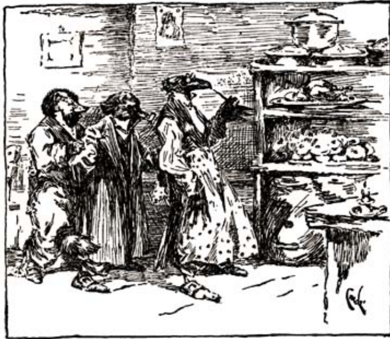
THE PANTRY IN THE HOLLOW TREE

new neckties and other Christmas things, Mr. Crow said that he and Mr. Squirrel would clear off the table if the others would get in some wood and stir up the fire and set the room to rights, so they could gather round and be comfortable by-and-by; and then, he said, it might snow as much as it liked as long as they had plenty of wood and things to eat inside.