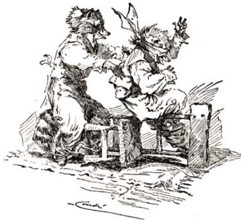
MR. 'POSSUM HAD TO PUT ON THE HANDKERCHIEF AND DO MORE EXERCISING THAN ANY OF THEM

Then in the afternoon they had games again, but nice