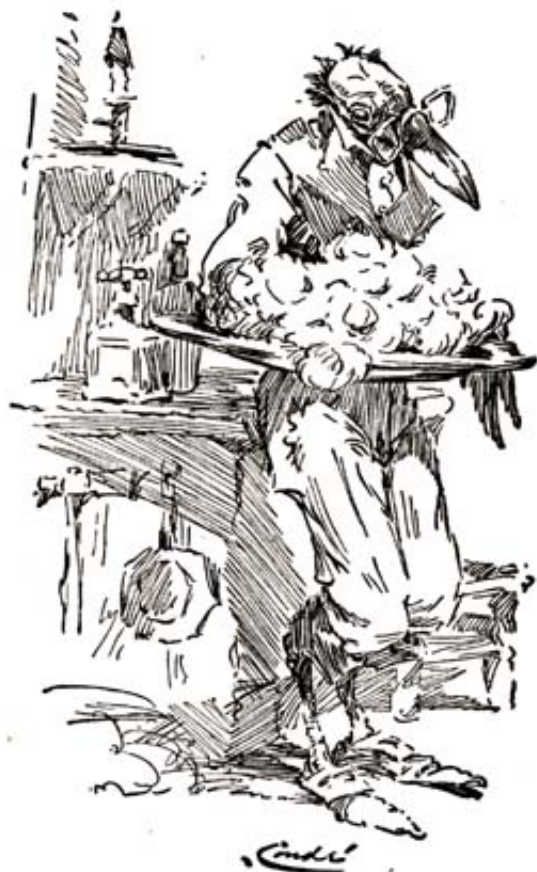
MR. CROW WAS ALMOST AFRAID TO BRING ON THE SALAD

Poor Mr. Crow was almost afraid to bring on the salad, but he was just as afraid not to. Only he did wish he had picked out Mr. Rabbit's smallest bunches instead of his biggest ones, for he knew there were no such other salads anywhere as those very ones he had borrowed from Mr. Rabbit's garden. But he put it off as long as he could, and