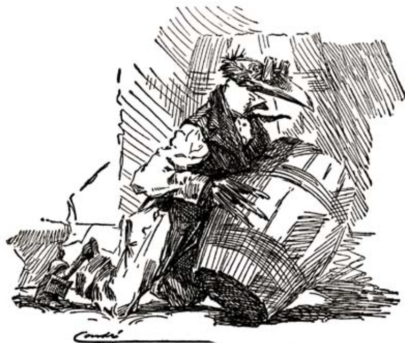
ONE DAY MR. CROW FOUND HE WAS AT THE BOTTOM OF THE BARREL OF EVERYTHING

Mr. Crow smiled, too, but he didn't feel like it much, for he knew that even johnny-cake and gravy wouldn't last