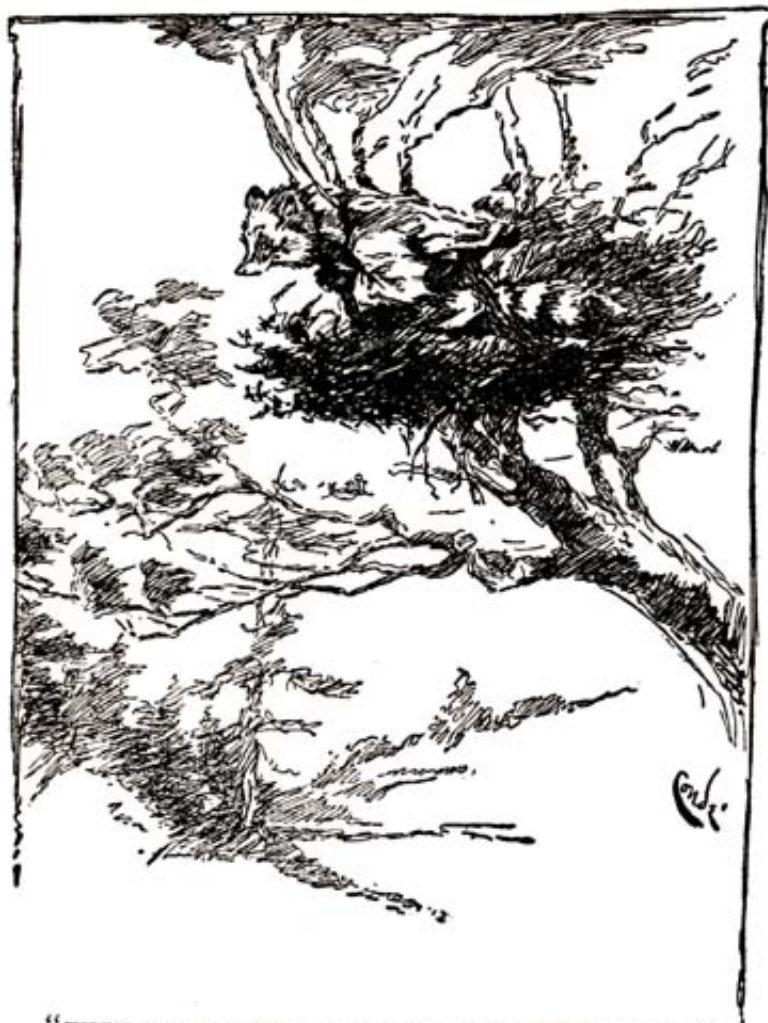
"THEN I SUDDENLY FELT LIKE A SHOOTING-STAR"

"Mr. Man wasn't scolding Mr. Dog any more. He was