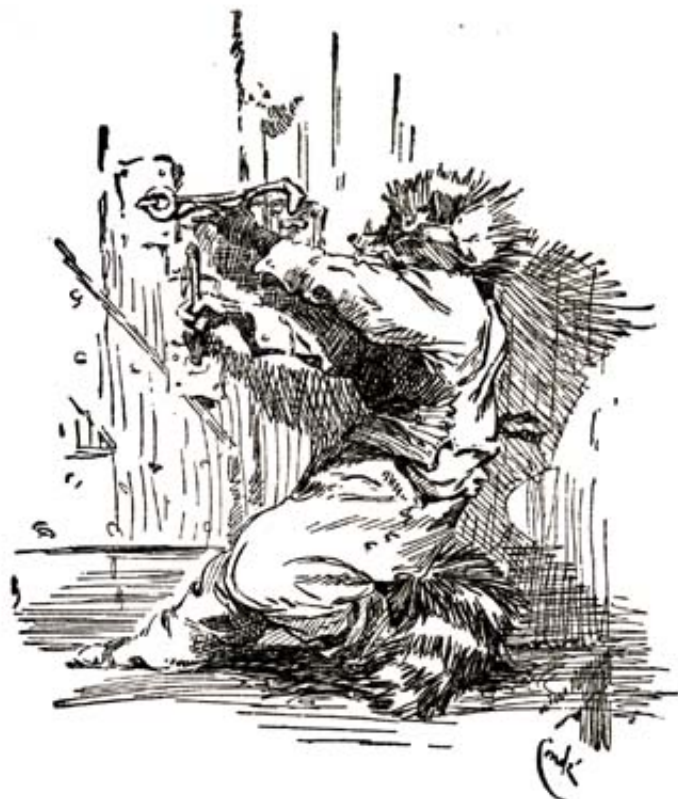
THEN MR. 'COON SLAMMED HIS DOOR

Then they all went very quietly up Mr. 'Coon's stair (all except Mr. 'Possum, who stayed with Mr. Crow), and