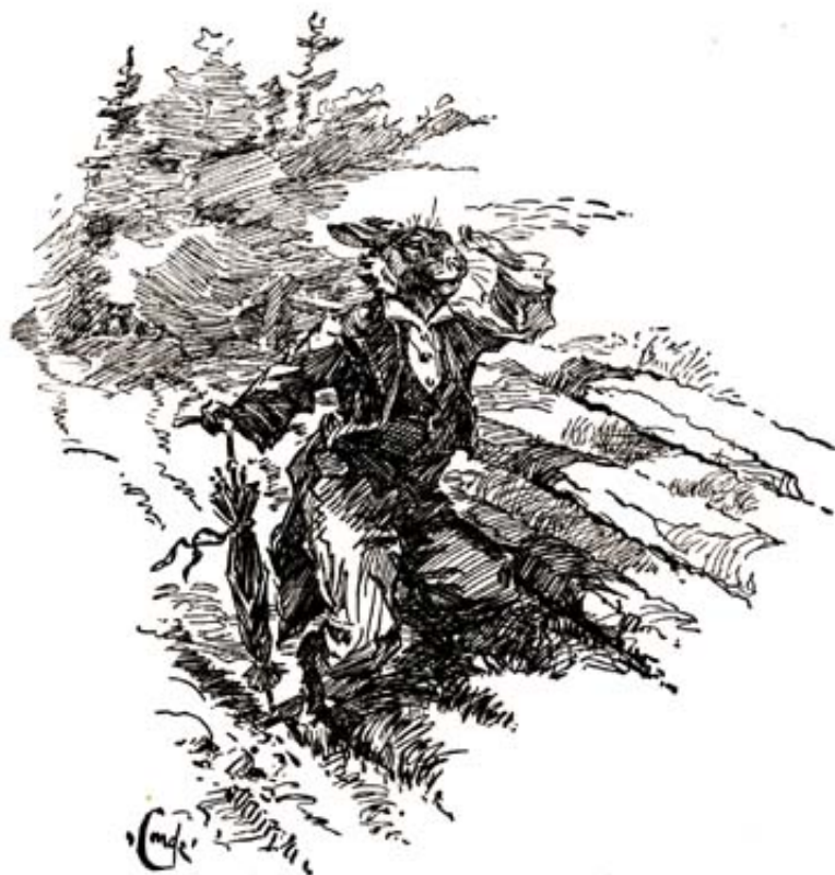
JACK RABBIT CAPERED AND LAUGHED ALL THE WAY HOME

So then they all sat around and smoked and told stories, and whenever they stopped Mr. Crow thought of something else to do and seemed to get better toward night, and got a great deal better when it got dark, and Mr. Jack Rabbit said all at once that now it was too late to see the Hollow Tree garden, and that he was so sorry, for he knew he could have learned something if he could just have one look at it, for nobody could see those vegetables and that garden without learning a great deal.