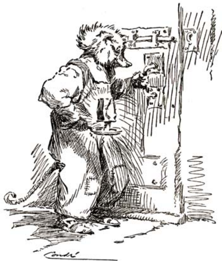
MR 'POSSUM SAID NOT TO MOVE, THAT HE WOULD GO AFTER A PIECE OF WOOD

And when the fire got very low and it was getting cold, Mr. 'Possum said for them not to move; that he would go down after a piece of wood, and he would attend to the fire