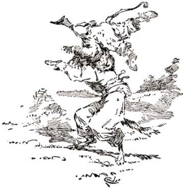
SO THEN MR. DOG TRIED TO GET MR. 'POSSUM ON HIS SHOULDER

bit to see how far Mr. Dog had gone, and when he had gone far enough Mr. 'Possum jumped up quick as a wink and scampered up a tree, and ran out on a limb and swung with his head down, and called out: