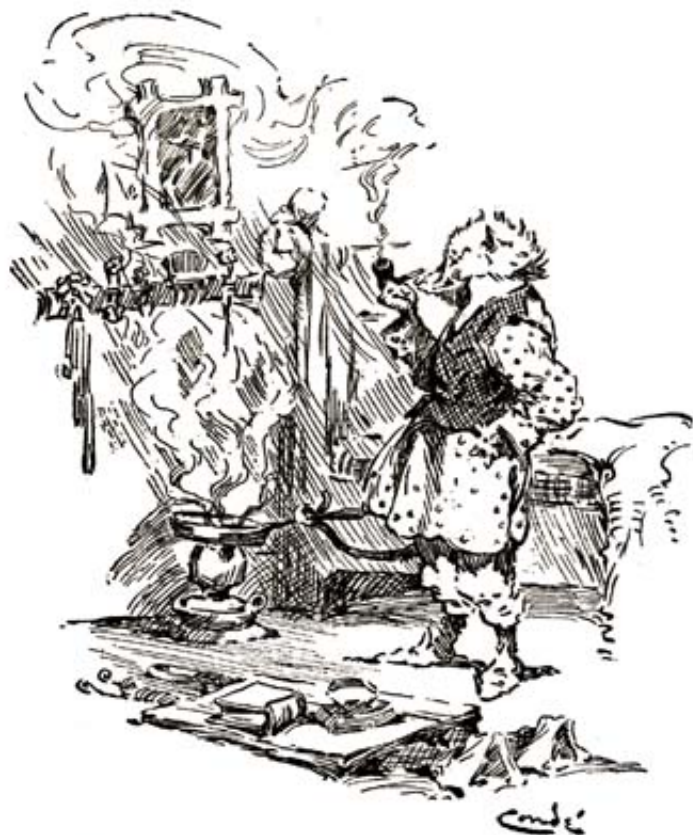
HE WAS AN OLD BACHELOR AND LIKED TO HAVE HIS OWN WAY

But Mr. 'Coon was tired of that kind of thing too and