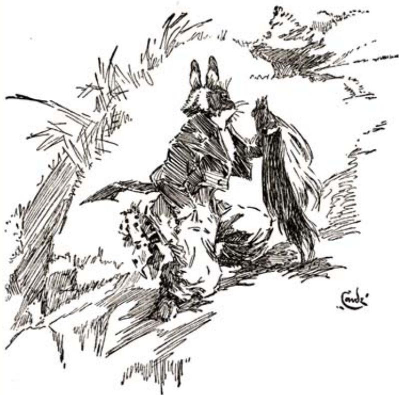
SET OUT FOR HOME BY A BACK WAY

Then Mr. Rabbit lit his pipe and leaned back and smoked. Mr. Dog said it was a fine story, and he wished he could