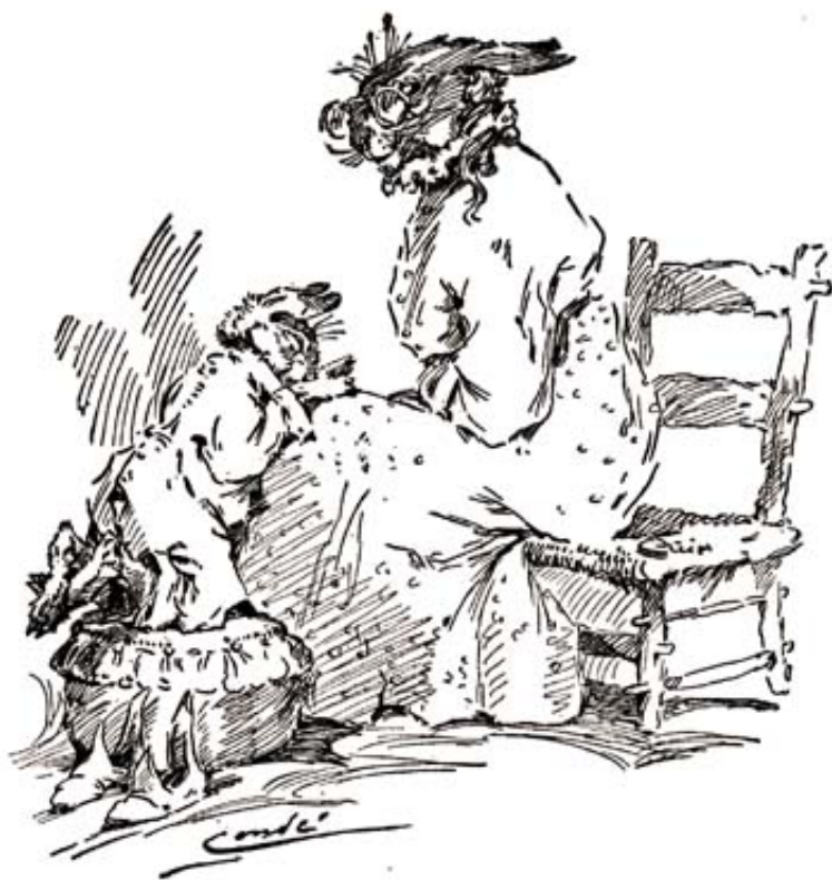
PROMISED NEVER TO DISOBEY HIS MOTHER AGAIN

And after supper, when he said his prayers and went to bed, he promised never to disobey his mother again.