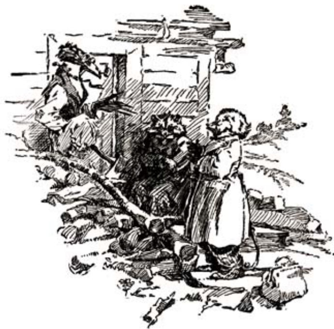
THEY SAW MR. CROW OUT IN THE YARD CUTTING WOOD FOR HIS MOTHER-IN-LAW

"Oh yes, I know about that. That's Mr. Crow's mother-in-law. He had a wife until last year, and his mother-in-law used to live with them. I believe she was pretty cross, but I've heard Mr. Crow say she was a good cook, and that he had learned to cook a great many things himself. I