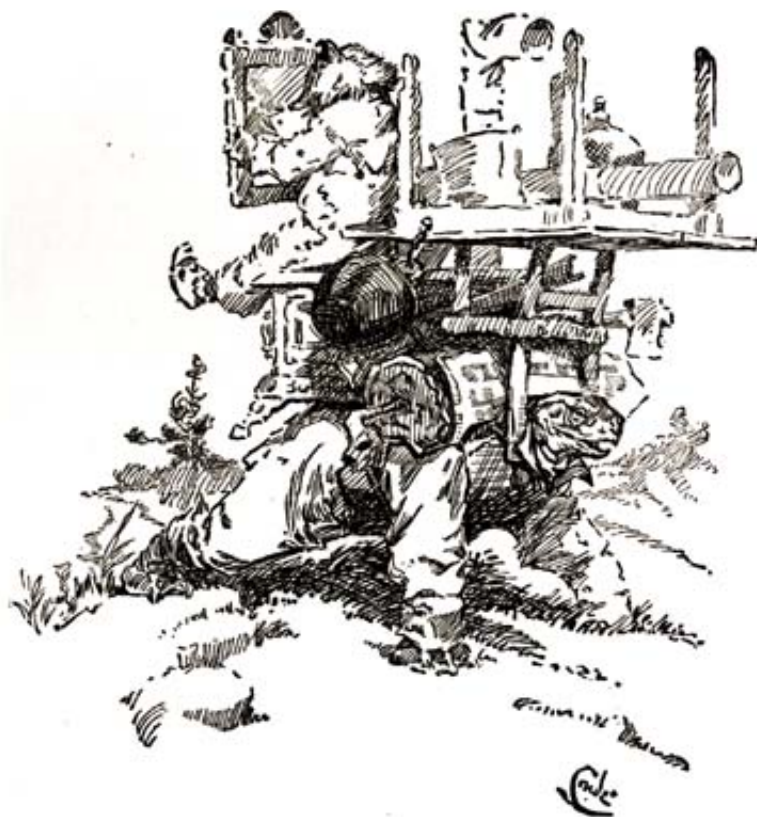
MR. 'POSSUM SAID HE'D JUST GET ON AND HOLD THE THINGS

Then here's to the 'Possum and the Old Black Crow And the 'Coon with a one, two, three! And here's to the hollow, hollow, hollow, hollow— Then here's to the Hollow Tree,