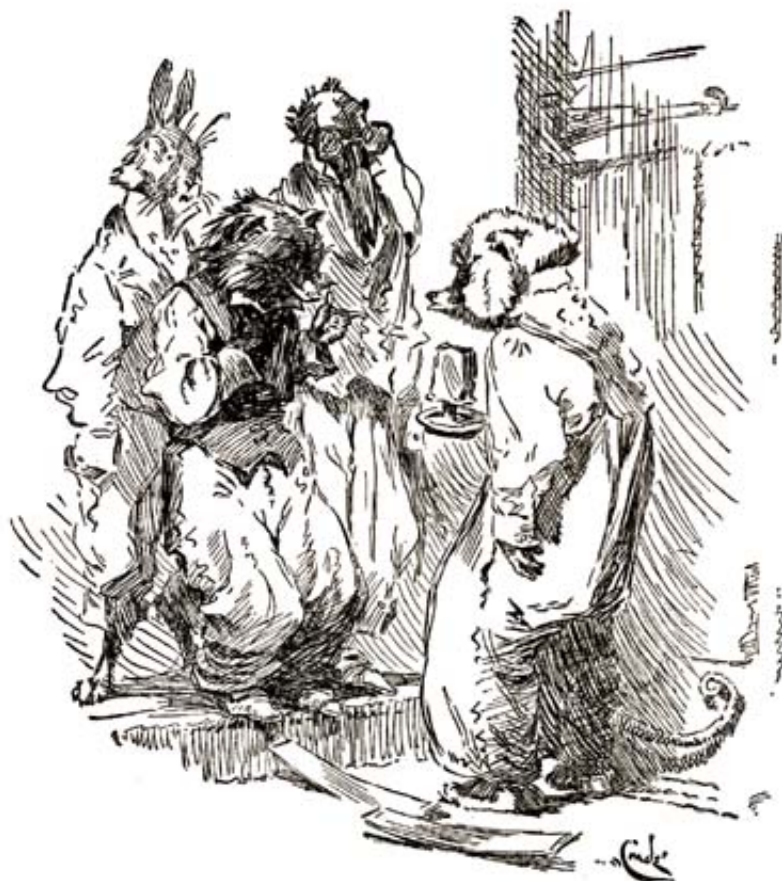
LOOKED STRAIGHT AT MR. 'POSSUM AND SAID, "WHAT WAS THAT YOU WERE CHEWING JUST NOW?"