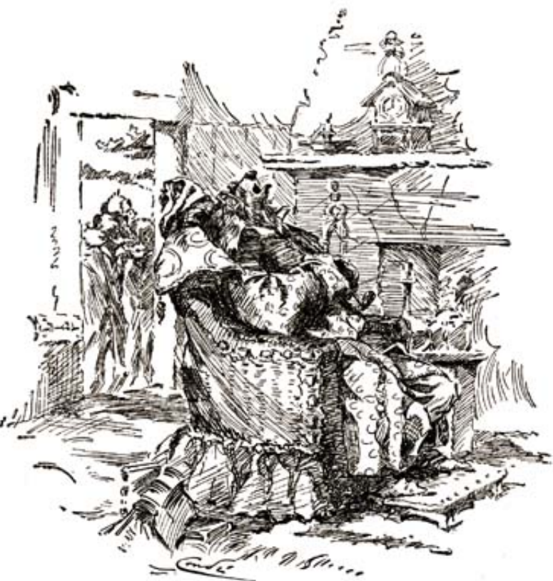
MR. BEAR MUST HAVE BEEN VERY TIRED AND GONE TO SLEEP RIGHT WHERE HE WAS

Then Mr. Crow said he'd always wanted to see Mr. Bear's pantry, for he'd heard it was such a good place to