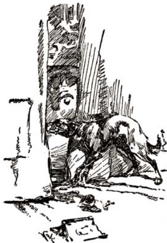
"SLIPPED IN BEHIND HIM WHEN HE WENT INTO THE TENT"

"I know all about menageries, on the outside and the inside too, for I have been to one. I went once with Mr. Man, though I wasn't really invited to go. In fact, Mr. Man invited me to stay at home, and tried to slip off from me; but I watched which way he went, and took long roundin's