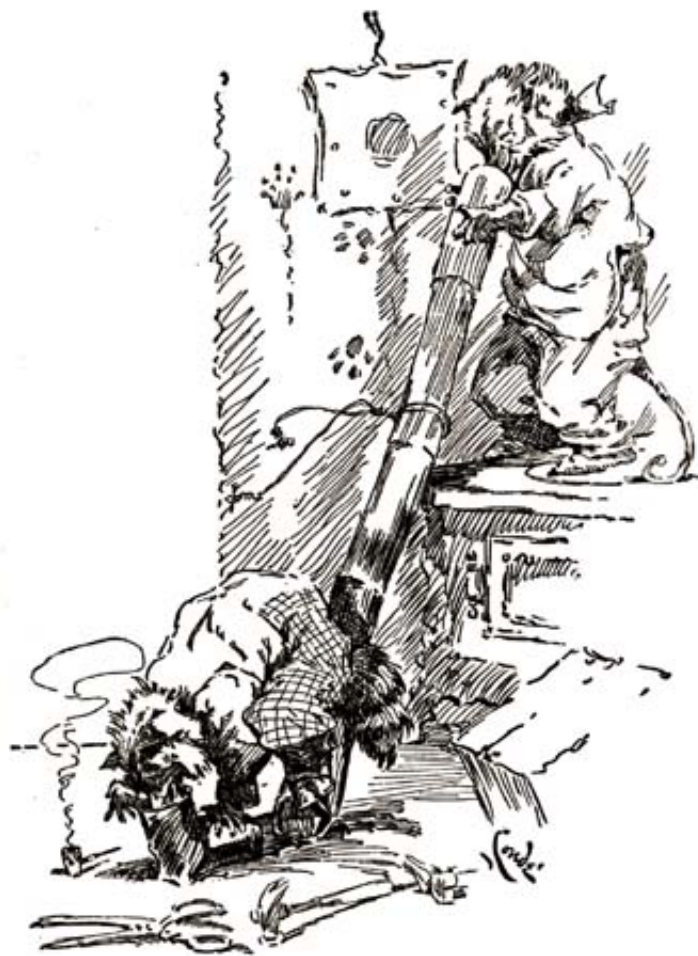
MR. 'POSSUM AND MR. 'COON TRIED TO PUT UP THE STOVE

Well, it wasn't so hard to move after that. They just set the cook-stove on Mr. Turtle's back and piled on as much as would stay on, and he kept telling them to put on more, until pretty soon Mr. 'Possum said that he would just get on and hold the things from slipping off, which he did, and sat on the stove and rode and swung his feet and held the other things, while Mr. Crow and the rest walked and carried what was left.