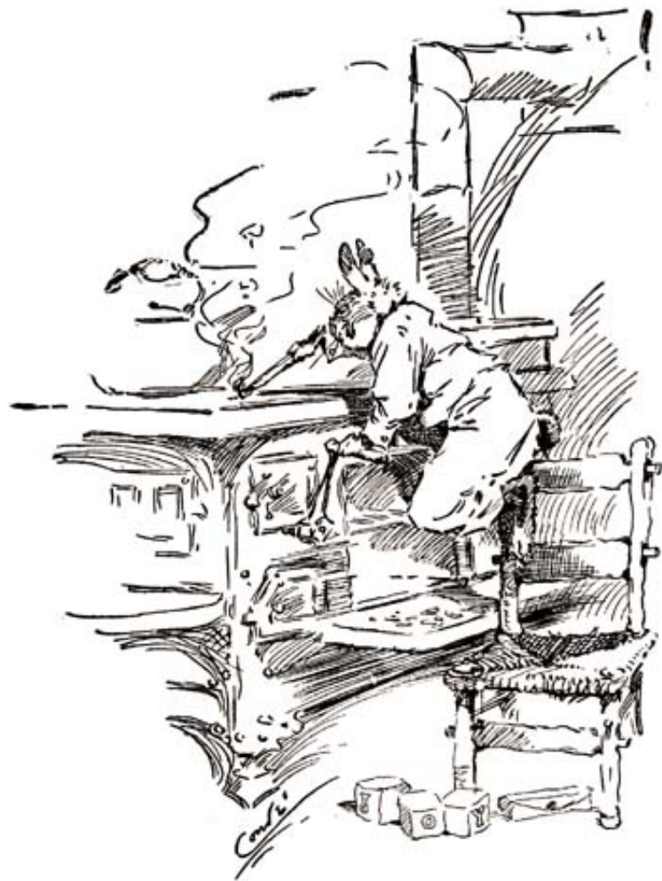
AND HE MADE SOME STRIPES, TOO—MOSTLY ON TOP OF THE STOVE

Then little Jack forgot all about putting up blackberries, admiring that beautiful red spot on the shiny black stove, and thinking how nice it would be to make some more like