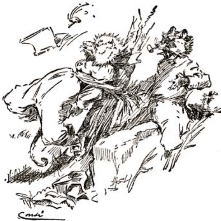
SO MR. 'POSSUM PROMISED, AND MR. 'COON UNTIED HIM

So then they crept softly in among the green leaves and branches and looked through, and what do you think they saw?