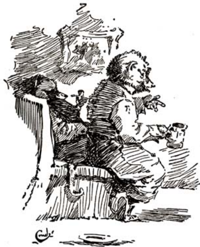
MR. 'POSSUM WANTED TO KNOW WHAT MR. RABBIT MEANT BY SPINNING THEIR TAILS

Then he said he wanted to ask some questions. He said he wanted to know what "wold" meant, and also what Mr. Rabbit meant by spinning their tails. He said he hadn't noticed that any of them were spinning their tails, and that he couldn't do it if he tried. He said that he could curl his tail and hang from a limb or a peg by it, and he had found it a good way to go to sleep when things were on his mind, and that he generally had better dreams when he slept that way.