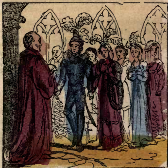
Jack marries the Duke's Daughter.