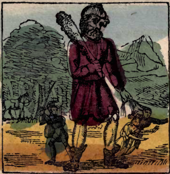
Jack kills the Giant and releases the Knight and Lady.