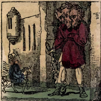
Jack arrives at the Castle of the Giant with Three Heads.