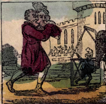
The Giant pursues Jack over the Drawbridge.