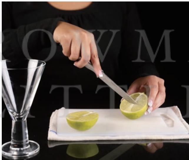
Wedges: Step 1

For hygiene and courtesy to the guest, it's best for bartenders to set a wedge of lemon or lime on the rim of the glass and allow the guest to taste the drink first, then decide if he or she wants an extra burst of flavor. Even though bartenders often wash their hands, they are constantly touching things.