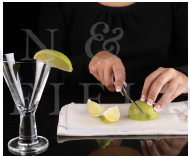
Wedges: Step 2