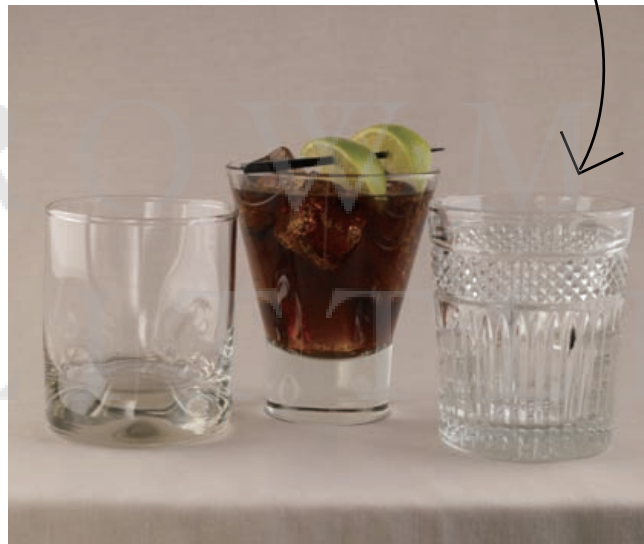
Double Old-fashioned Glasses

These glasses hold more than the old-fashioned glasses