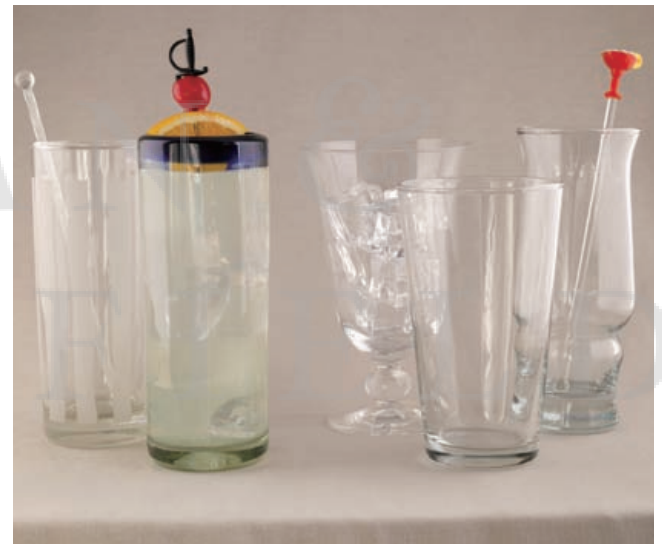
Tall and Collins Glasses

The 1938 film Jezebel starring Bette Davis is set in New Orleans in 1852. The first scene shows a man pulling his carriage next to the Louis-House to have a ball , as he says. It's assumed that he means a Highball because the next scene shows him and other gentlemen standing and drinking at an elegant lobby bar.