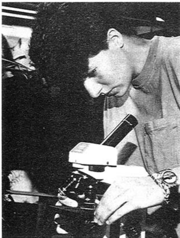
PHOTOGRAPHIC PROJECT CLEAR WINDOW, INC.

Three others are in high schools that provide vocational agriculture programs.