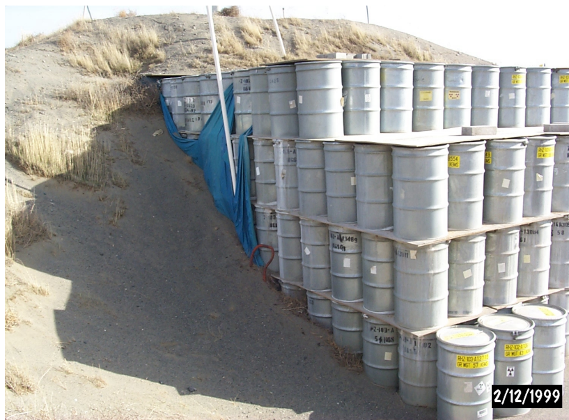
FIGURE 2.2 Since 1970, DOE has required that sites store TRU waste so that it can be retrieved easily. TRU wastes at Hanford, which is in a very dry region, are stored in earthen mounds.

from leaks. DOE recognizes that some of these soils and sediments are sufficiently contaminated to warrant retrieval and describes these as “ex situ contaminated media” in its summary report. If they are retrieved, both the pre-1970 buried waste and the ex situ media will be considered newly generated waste (DOE, 2001a).