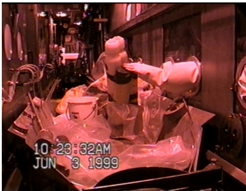
FIGURE 2.3 Manual sorting of waste inside a containment (glovebox) facility is required to remove items that are prohibited by shipping or disposal restrictions. Sorting and repacking the waste are time-consuming, expensive, and present risks to workers.