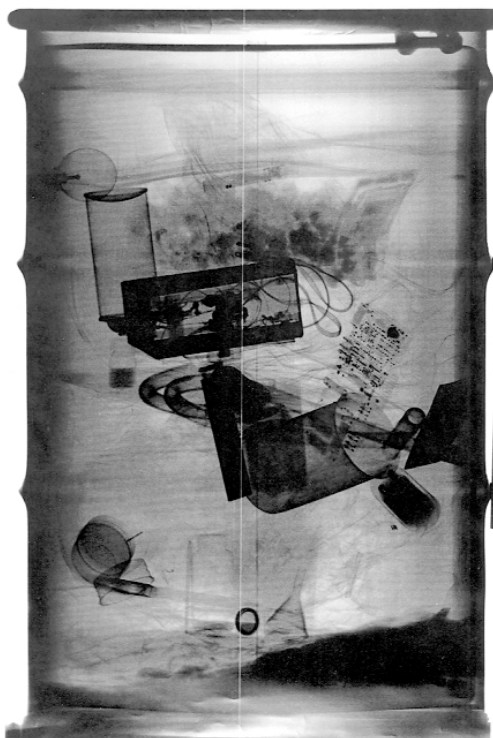
FIGURE 3.1 X-ray examination of a waste drum allows operators to determine if it contains prohibited items that must be removed before shipping the waste to a disposal site. Such visual inspection of a drum, at various positions and angles, may take several hours.

some additional characterization will be required to validate the process knowledge (St. Michel and Lott, 2002).