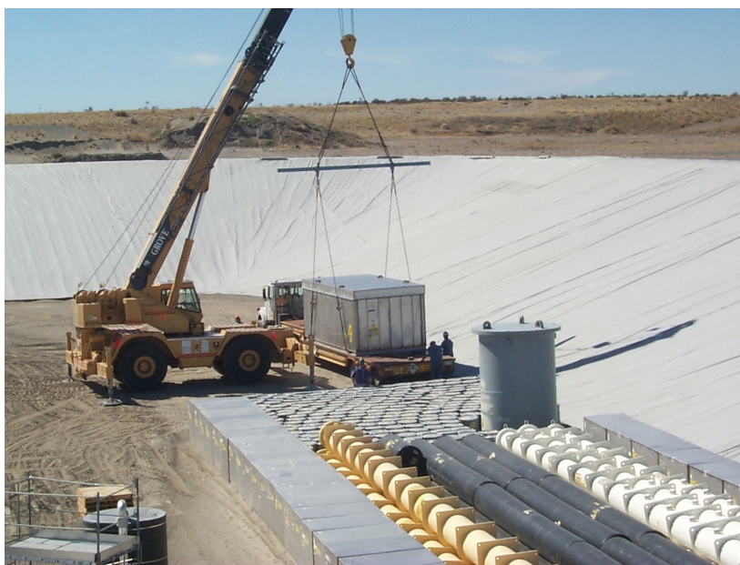
FIGURE 2.4 RCRA requirements for disposal of MLLW include use of an impermeable liner and leachate collection system to provide total containment of hazardous chemicals for at least 30 years. Here, a large box of macroencapsulated waste is being placed in a RCRA-compliant disposal facility at Hanford.

SOURCE: Code of Federal Regulations, Title 10, Part 61.55.