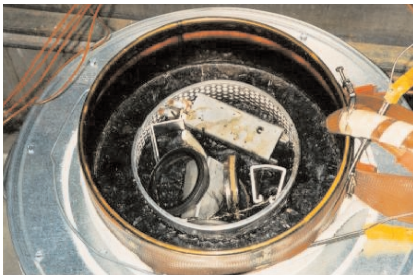
FIGURE 3.3 Macro-encapsulation is used to stabilize heterogenous waste or large objects for disposal. Typically, grout or a polymer is poured over the waste so that it is encased physically. There are few data on the long-term durability of macroencapsulated wastes.

the waste form if necessary to meet size criteria for the test. This can alter the barrier provided by the encapsulation. There are few data on the long-term durability of macroencapsulated wastes.