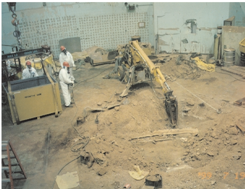
FIGURE 3.2 The BROKK demolition machine, equipped with a robotic arm, is an example of state-of-the-art technology that might be used to retrieve buried waste from Pit 9 at INEEL.

radioactive waste, are inexpensive and versatile for repackaging excavated objects or wastes that have somewhat irregular sizes and shapes. They can also be used to containerize both clean and contaminated soil associated with the retrieval activities.