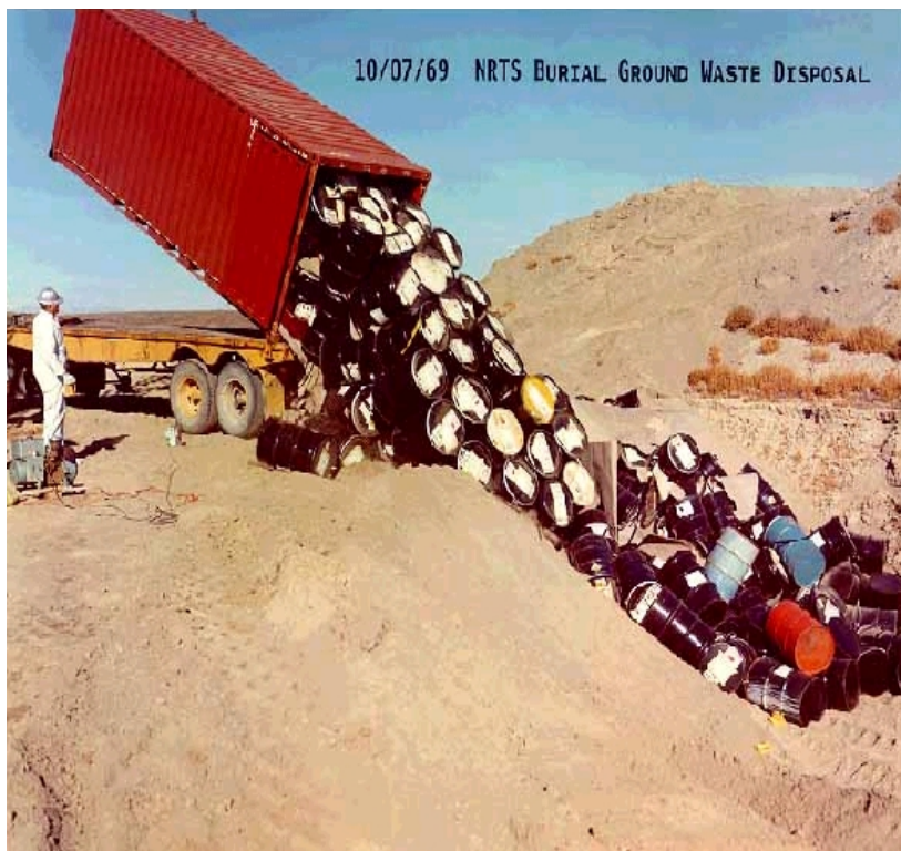
FIGURE 2.1 Before 1970, transuranic and mixed wastes were buried in near-surface trenches. The waste was considered to be permanently disposed, and inventory data are lacking.

TM wastes are described in two categories, transuranic and MLLW. The summary report does not distinguish between TRU and mixed transuranic waste (MTRU) (see Sidebar 2.1). All inventory data refer to the waste volume unless noted otherwise.