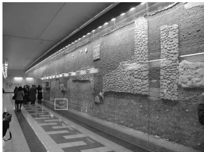
Figure 14 Display at Syntagma station highlighting the different historical eras of Greek civilization. See Figure 15 for an enlargement of the outlined section.

In addition to exhibiting the findings from the excavations, modern artwork by famous Greek artists is on display at 12 stations. Eventually, the art program will be expanded to include all stations. Sculptures, ceramic tiles, silk-screened works, and paintings are located on the platforms, transfer areas, and concourses and outside the stations. A stunning piece of art, Aethrio (Atrium) by George Zongolopoulos, viewed by the team at the Syntagma station, consisted of umbrellas and metal stairs inside a large circular area covered in mirrors (see Figure 16).