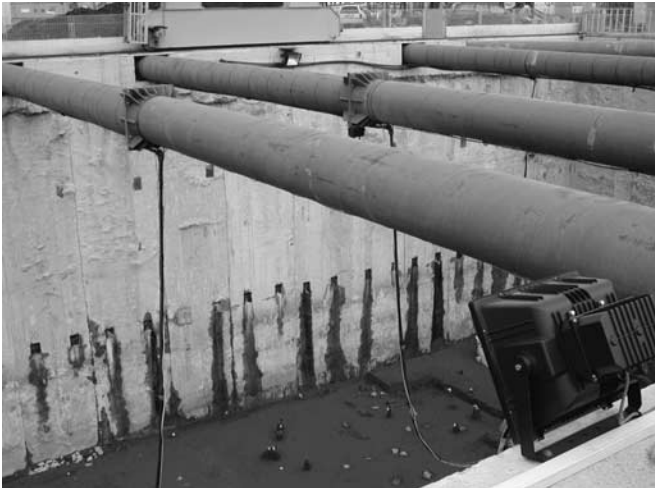
Figure 4 Station open cut in Naples.