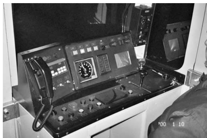
Figure 9 Milan's train operator console.

Information technology supporting surface modes was also described to the team by ATM. Milan's high degree of functionality in this area and its transit organizational structure has enabled effective service coordination and enhanced customer information between rail and surface modes. The surface control center has the ability to track vehicle locations through a landmark-based system and collect data on vehicle status. In addition, vehicle condition/status data have numerous uses. For exam-