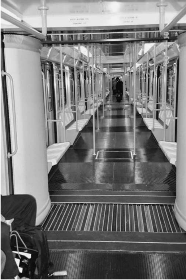
Figure 3 An example of a new articulated car interior in Milan.

structural modifications, including the installation of gangways for full articulation and rooftop air conditioning. One of the goals of refurbishment is to standardize all of the trains so that the cars can effectively be used on any line. These upgrades are expected to add another 20 to 30 years of life to trains that are currently 15 to 20 years old. ATM expects to refurbish approximately 100 trains in the next 5 years.