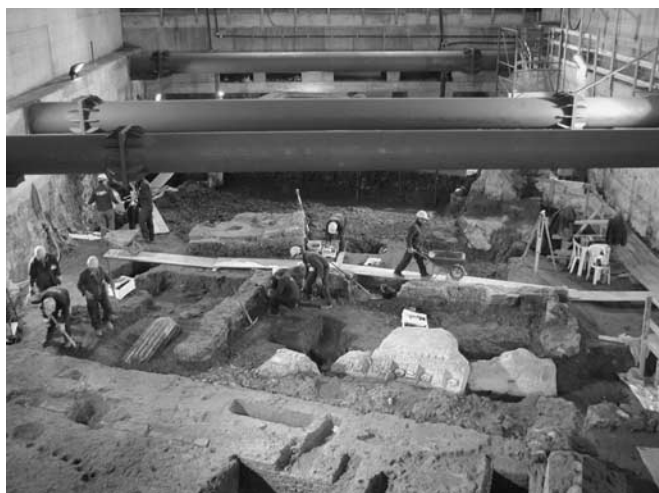
Figure 7 Duomo excavation site.

In Milan, archaeological remains are usually found within 6 to 7 m of the surface. They do not have an impact on construction.