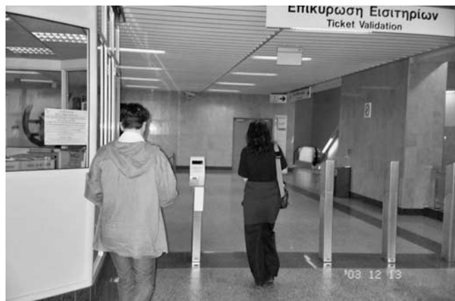
Figure 10 Athens open fare control line for ticket validation.

The fare control system in Rome is a closed design with gated turnstiles. The ticket validation system is time based, and the system is integrated with surface modes.