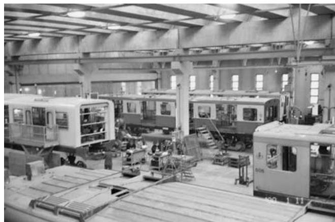
Figure 2 Car remanufacturing with new articulation in Milan.

ATM is also focusing on refurbishing train vehicles (see Figures 2 and 3). New equipment is fully articulated, and older cars are undergoing major