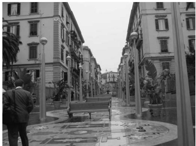
Figure 18 Designs along the pedestrian square at the Materdei station.

The design of the Cilea-Quattro Giornate Station was done by Domenico Orlacchio. Again, traffic was diverted to create a pedestrian area, and much of the art displayed at this station represents the history of Naples' fight for freedom.