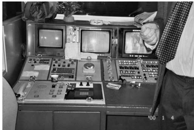
Figure 11 Station manager control booth console.

Station equipment controls for Line 1 in Naples are centralized at the station manager's location. Generally, these booth-type facilities are placed next to the entry control line. The station manager has a direct line of sight of customers entering and exiting the system. The booth has an open appearance, and the manager is readily available for interaction with the customer. Local signal and ROW power indications are provided at the station manager's location, as are comprehensive status indication and control of station equipment systems (see Figure 11). The control function is aided by extensive CCTV, public address, and point-to-point telephone/intercom access located throughout the station complex. Access to most of these systems, including CCTV, is available at the central control center; however, the station manager is expected to act as the first line of supervision and response.