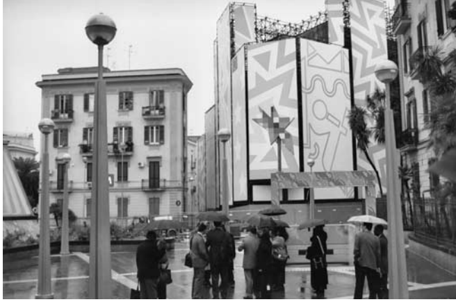
Figure 19 Example of painted buildings surrounding the Materdei station.