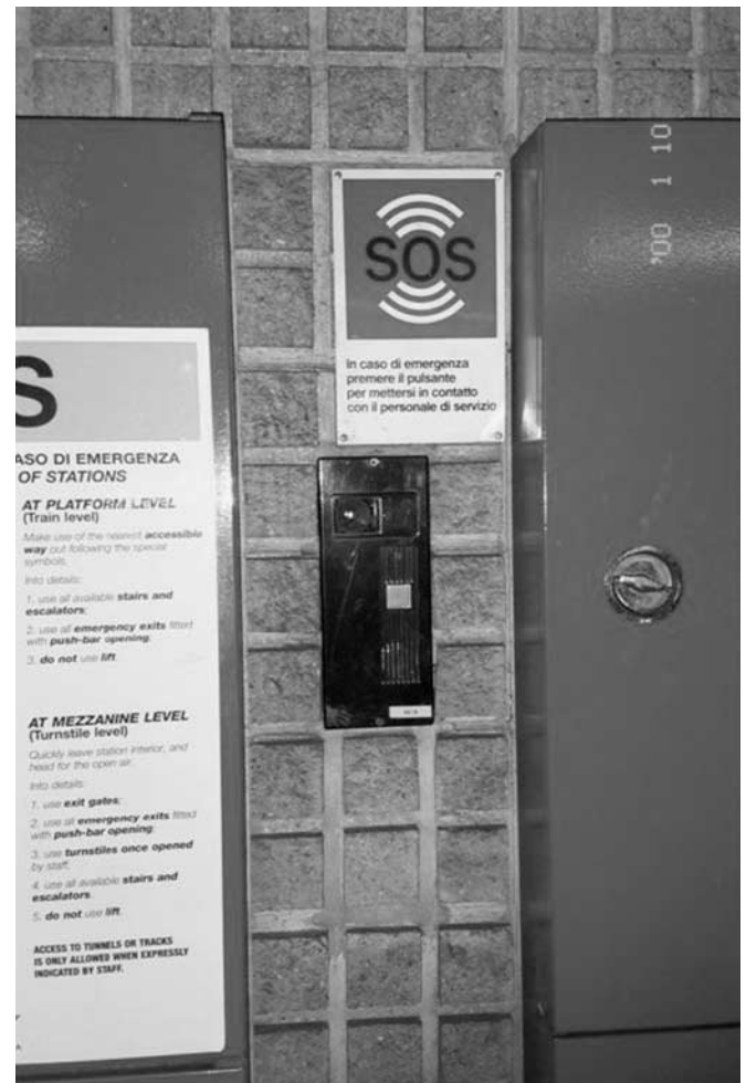
Figure 21 Milan's station SOS intercom.

As a key component to ensuring safety, the agency requires safety training for all operators. The training