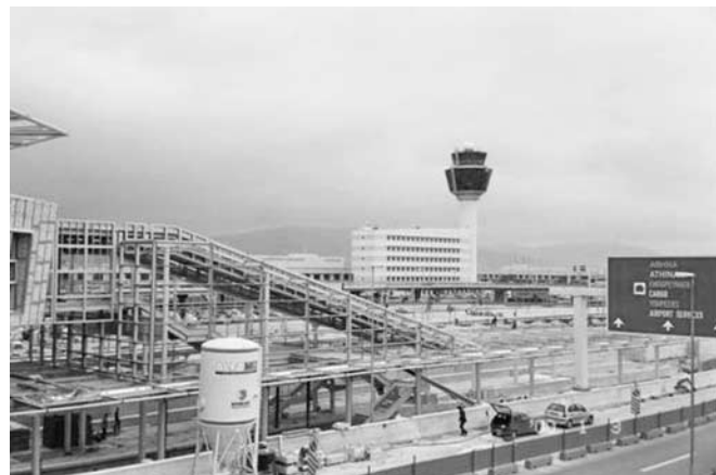
Figure 13 The intermodal airport station under construction.

Intermodal transfers are a key element of AM's immediate and long-range plans for the public transport system. In 2004, intermodal connections will include bus transfers at almost all metro stations, major park-and-ride facilities at five metro stations, interline transfers, intercity rail transfers at Larissa, suburban rail transfer at Plakentras, and tram connections at Sygrou-Fix. By 2007, additional park-and-ride facilities will be constructed, along with a tram connection to a metro transfer point at the site of the old airport. Finally, a metro transfer station at Ag. Savas will connect to the intercity bus terminal.