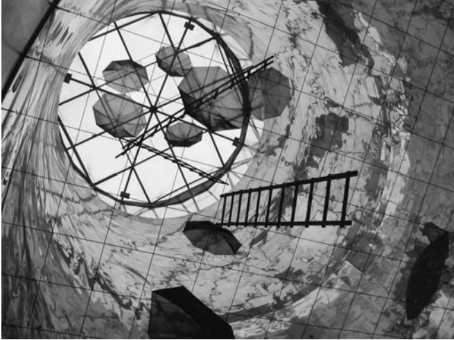
Figure 16 Aethrio (Atrium) by George Zongolopoulos.

bility for designing the stations. The architects chose the colors, art work, and materials. In addition, the architects took into account the neighborhoods surrounding the stations so that the designs would be both functional and aesthetically pleasing. To illustrate the importance of incorporating art into the stations and neighborhoods, the team received a tour of several new stations.