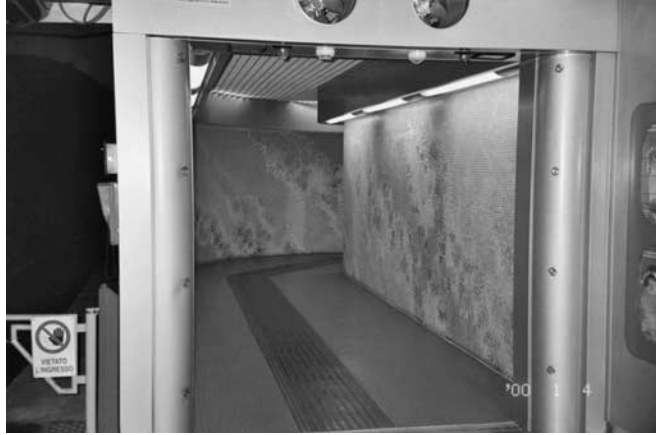
Figure 20 Station smoke/fire barrier in a station in Naples.

Nothing in the Naples metro stations is made out of flammable material, and all stations are constructed to resist earthquakes. Even luggage rooms are built to withstand dynamite. To illustrate the priority of safety at MN, even an art display of three old Fiat automobiles is totally nonflammable; all flammable materials, including the tires, have been retrofitted with appropriate look-a-likes.