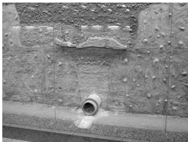
Figure 15 Terracotta pipes from the Pisistratid aqueduct.

International architects were hired for each new station and the architects were given total responsi-