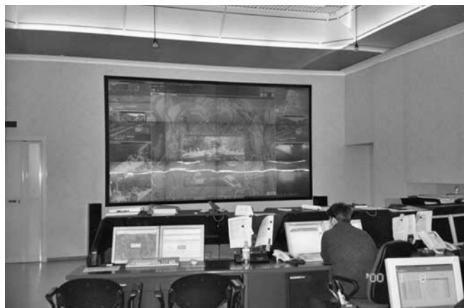
Figure 8 ITS Traffic Control Center managed by STA in Rome, Italy.

Information at the center is collected from a distributed system of 2,500 fixed roadway sensors and 60 strategically placed cameras. The cameras have the ability for remote field of vision manipulation to