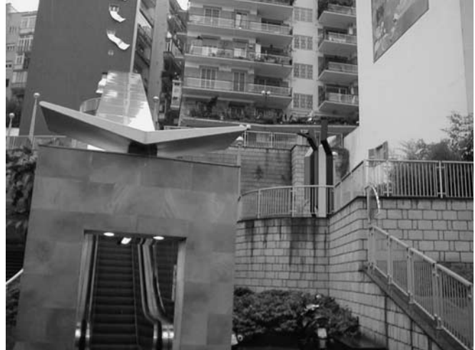
Figure 17 The escalator that links the Salvatore Rosa station to the neighborhood.

The Materdei station has two entrances from the same square. Traffic was redirected to create a