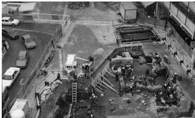
Figure 6 An excavation site in Athens.

Approximately 70,000 sq m have been excavated (see Figure 6), unearthing more than 50,000 archaeological findings dating from the Neolithic period to the modern era. Discoveries include public baths, cisterns, ancient roads, city walls, drains, cemeteries, tombstones, statues, and pots and other household items. For example, an ancient aqueduct was discovered; it has been rebuilt by archaeologists for display at the Monastiraki station.