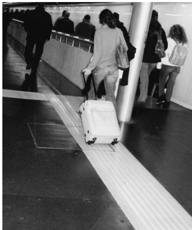
Figure 12 Guideways for the visually impaired at a station in Naples.

Detectable strips/guideways are present throughout the stations in Naples. These rubber strips with grooves guide visually impaired customers to train doors and elevators. The passenger simply slides the cane along the grooves (see Figure 12).