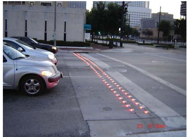
FIGURE 31 Intersection stop-bar IPM system application, Jefferson Street at Main Street Houston, Texas.

In 2006, The Houston Metropolitan Transit Authority of Harris County, Texas (METRO) implemented an IPM system at an intersection stop bar in the Houston central business district, specifically at the intersection of Jefferson Street and Main Street (see Figure 31). Only the Jefferson Street approach was initially equipped with the IPM system. Jefferson Street is a five-lane, one-way, eastbound street that intersects the METRORail line at Main Street. The motivation for this implementation was to increase road user awareness of the traffic