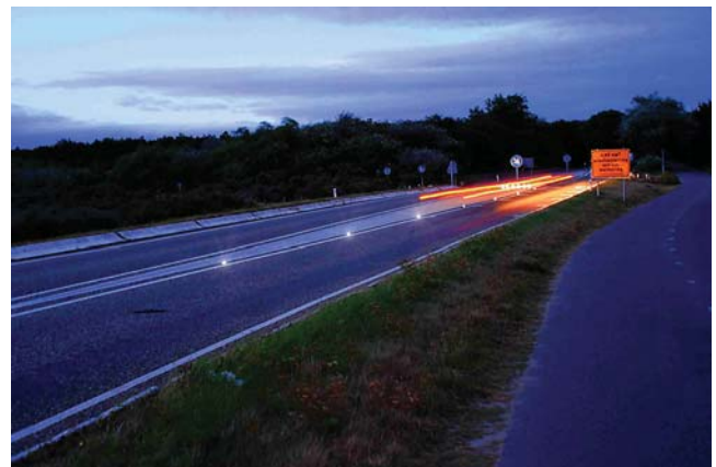
FIGURE 40 Environmentally sensitive area IPM system application, Province of Noord-Holland, the Netherlands.

The Dutch reported a 99.2% savings in energy and minimal impacts on wildlife as a result of the IPM system. In addition, no fatalities or injuries have been reported since the installation of this system. No information was provided, however, regarding safety levels before IPM system implementation to