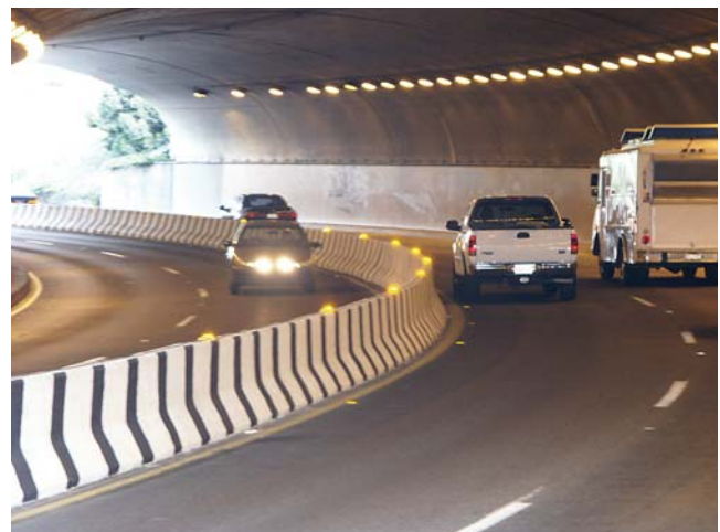
FIGURE 23 Tunnel IPM system application, Santa Monica, California (Courtesy: SmartStud Systems).

In May 2006, the Hawaii DOT (HDOT) implemented an IPM system in the eastbound Wilson Tunnel on Route 63 outside of Honolulu (see Figures 24 and 25). The intention of