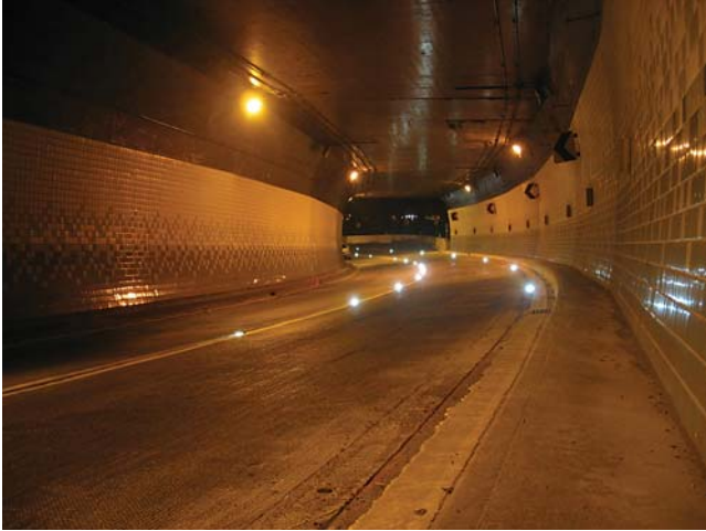
FIGURE 24 Wilson Tunnel (inside the tunnel), Route 63, Honolulu, Hawaii.

the IPM system was to provide lane guidance and reduce crashes; the system provides a guidance and warning function both inside the tunnel and outside at the tunnel exit.