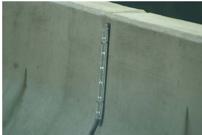
FIGURE 13 Horizontal curve IPM system application (close-up view), Texarkana, Texas (Courtesy: TxDOT Atlanta District).

For this installation, IPM system markers were installed on the right-side concrete barrier of the curve (see Figures 13 and 14). The installation is approximately one-half mile long. The markers were bolted directly to the barrier using antitheft bolts. The IPM system is activated by a photocell and is illuminated when the ambient light begins to dim. Once the system is acti-