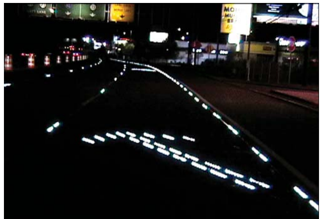
FIGURE 21 Merge location IPM system application (arrow view), Wayne Township, New Jersey.