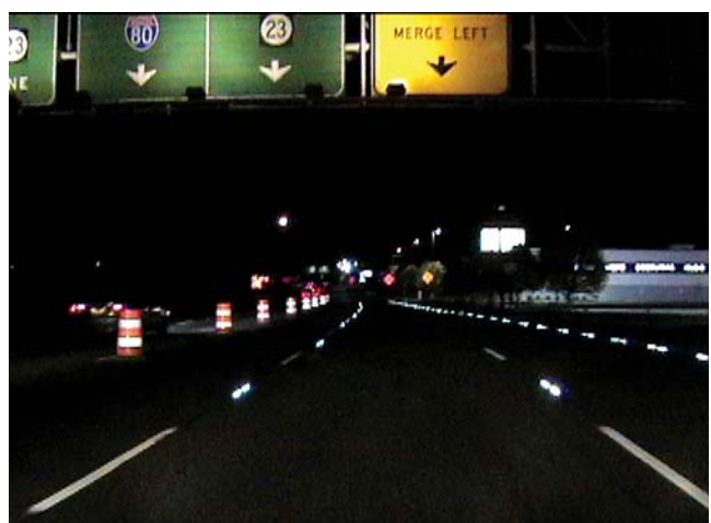
FIGURE 22 Merge location IPM system application (taper view), Wayne Township, New Jersey.