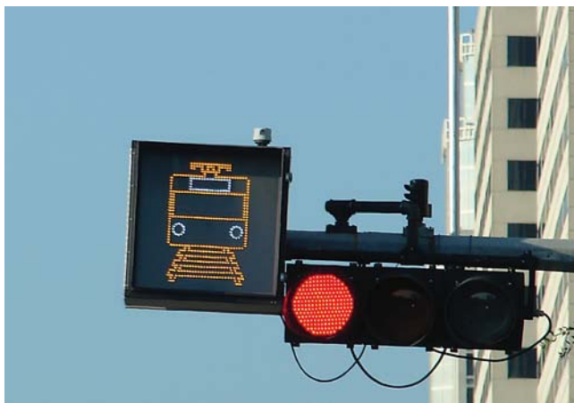
FIGURE 35 Train approaching sign (flashes on train approach).

Not unique to this application, power supply issues were encountered early in IPM system operation but have since been resolved. On more than one occasion, the system was without power owing to a suspected manufacturing defect in the power supply. Also, marker adhesion has been problematic; some markers were dislodged from the pavement and were lost or destroyed by traffic. Once the missing markers were replaced with stronger adhesive, the system has operated with few to no problems (W. Langford, personal communication, 2007).