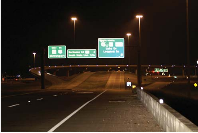
FIGURE 15 Horizontal curve IPM system application (aesthetic view), Texarkana, Texas (Courtesy: TxDOT Atlanta District).

A formal evaluation of the effectiveness of this IPM system has not been done. Anecdotally, TxDOT personnel report fewer tire marks on the barriers at this location than before. Additionally, TxDOT personnel believe that the markers add to the aesthetics of the flyover (see Figure 15) (C. Ibarra, personal communication, Aug. 3, 2007).