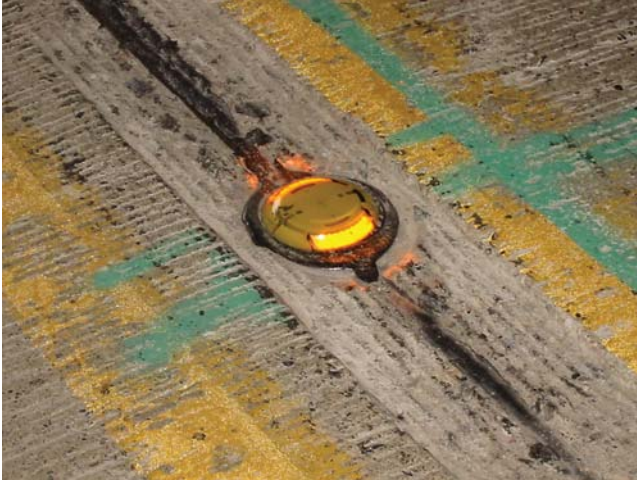
FIGURE 27 Tunnel IPM system application (milled pavement view), between Newhalem and Diablo, Washington (Courtesy: WSDOT).

markers hinder their visibility over time. To date, there have been no reported failures with the markers or system. Failure detection does not occur automatically, but is detected through inspection by the WSDOT maintenance crews or through motorist notifications. The total system cost was estimated as $100,000. Ongoing annual costs associated with system maintenance are approximately $1,000. The operation and safety of the facility have improved with the addition of the IPM, WSDOT believes, although no formal evaluation is available (G. Baghai, personal communication, Aug. 3–7, 2007).