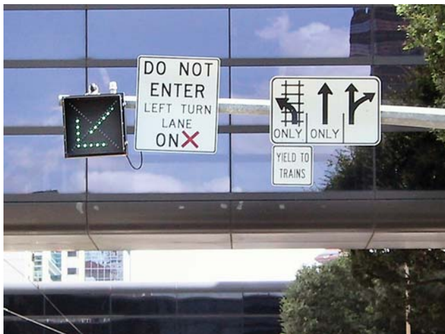
FIGURE 34 Active “Arrow” for permitted access left-turn lane, Houston, Texas (Courtesy: Houston METRO).

lane in both the northbound and southbound directions. The markers are spaced approximately 5 ft apart and extend from the beginning of the left-turn bay through the Dryden intersection. The system is activated in a steady-burn state when the dynamic lane control assignment indicates a “Red X.”