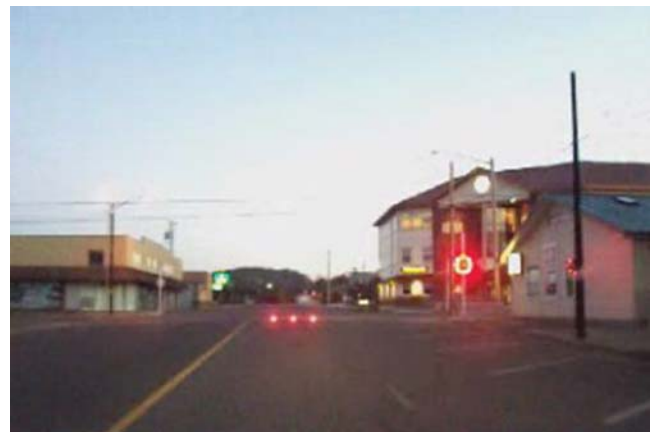
FIGURE 28 Intersection stop-bar IPM system application, Coquille, Oregon.

Under FHWA's experimental designation, an IPM system was implemented at a signalized pedestrian crossing that connects two sections of the Galleria Mall at West Alabama Street. The IPM system is illuminated during the yellow and red phases of the traffic signal and matches the signal's color indications. The markers used in this application have five amber LEDs and five red LEDs. When the traffic signal provides a yellow indication, the amber LEDs illuminate in a steady-burn state (see Figure 29). When the traffic signal provides a red indication, the red LEDs illuminate, also in a steady-burn state (see Figure 30). When the traffic signal shows a green indication, the IPM system is deactivated.