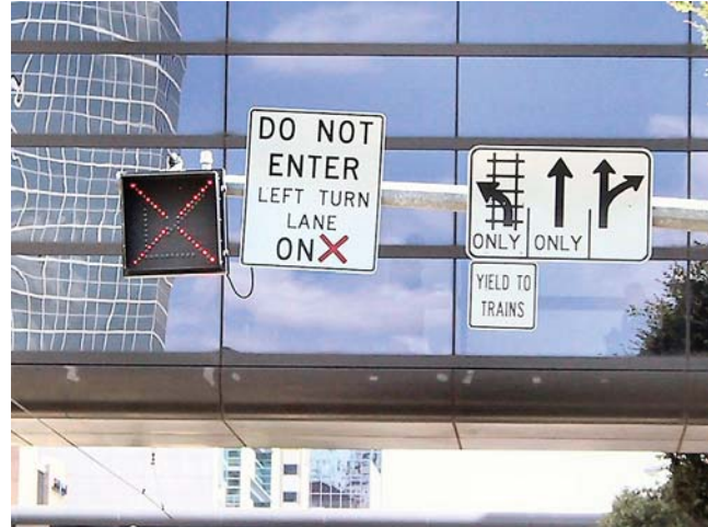
FIGURE 33 Active “X” for do not enter left turn lane on X, Houston, Texas (Courtesy: Houston METRO).

A segment of Houston’s METRORail light rail is centered on Fannin Street running in the former median portion of the roadway. Along this corridor, left-turn movements are prohibited in both northbound and southbound directions along Fannin Street (within the Texas Medical Center) when a train is approaching. Despite this left-turn restriction, a number of crashes have occurred involving left-turn movements by road users. To reinforce the turn restriction, Houston METRO first installed a dynamic lane control assignment system (see Figures 33–35). A “Red X” indicates that left-turn movements are prohibited; a “Green Arrow” indicates that left-turn movements are allowed and a “Train Approaching” sign provides additional warning to road users (“METRORail . . .” 2007). These overhead-