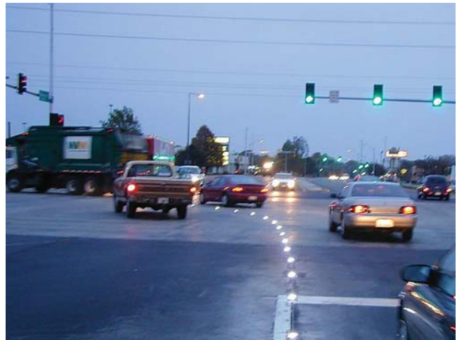
FIGURE 19 Multiple-turn lane IPM system application, Springfield, Illinois (Courtesy: SmartStud Systems).

In 2004, the Illinois DOT (IDOT) installed an IPM system at the intersection of Wabash Avenue at Veterans Parkway in Springfield, Illinois (see Figure 19). The IPM system was intended to provide a more permanent means to delineate the