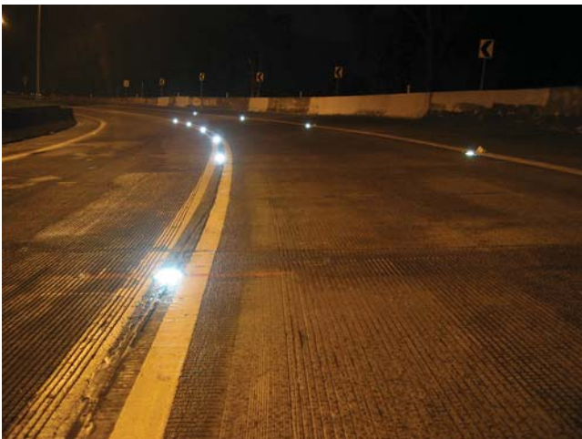
FIGURE 25 Wilson Tunnel (exit from the tunnel), Route 63, Honolulu, Hawaii.

To date, there have been no reported failures with the markers or system. Failure detection does not occur automatically, but is detected through inspection by the HDOT maintenance