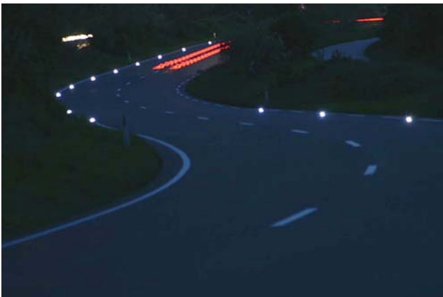
FIGURE 16 Horizontal curve IPM system application, Province of Noord-Holland, the Netherlands (Courtesy: Astucia Traffic Safety Systems).

Limited information was available regarding an IPM system implemented in the Province of Noord-Holland along N200 in the Netherlands. N200 is a four-lane, divided roadway characterized by a high degree of curvature. IPM system markers are installed on the outside edge of each curve (see Figure 16). The benefits of this system are purported to be increased safety and an energy reduction of more than 90% when compared with conventional overhead illumination (Astucia Traffic Safety Systems 2007b).