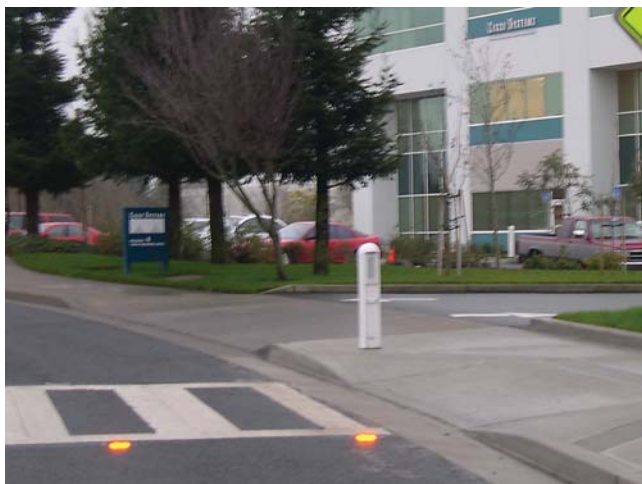
FIGURE 4 “Smart crosswalk system” (Courtesy: LightGuard Systems, Inc.).

components of: (1) IPMs, (2) an AC or solar power source, and (3) a manual push-button or passive activation system (see Figure 4). Over time, and with expanded IPM system implementation, various installation, operation, and maintenance challenges have been identified.