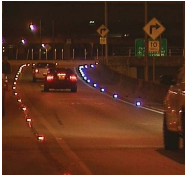
FIGURE 9 Horizontal curve IPM system application, Fort Lauderdale, Florida.

speed. As the driver slows, the chase sequence slows. The IPM system markers extend through the entrance to SR 84 to provide added warning of the curvature at this location (G. Soles, personal communication, July 26, 2007).