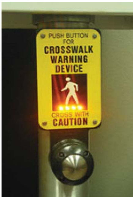
FIGURE 1 Push-button activation system for smart crosswalks.

Manual activation is most commonly achieved, particularly for pedestrian crosswalk applications, through a push-button system. An example of a manual push-button system is provided in Figure 1. Signage is placed in proximity to the push button to alert the pedestrian that action is required to activate the system. Although push-button systems are often favored by public agencies because of their low cost, it was anecdotally reported that pedestrians will only use a push-button system 60% of the time (M. Harrison, personal communication, July 2007). Additionally, the use of a push-button system makes pedestrians more aware of the system, possibly giving the pedestrian a false sense of security when crossing the roadway.