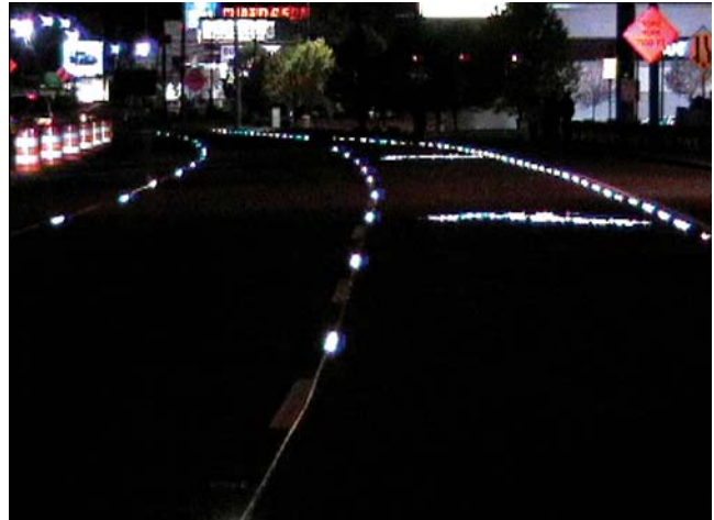
FIGURE 20 Merge location IPM system application, Wayne Township, New Jersey.

Installation issues have challenged the effective operation of this IPM system. The general roadway contractor was not familiar with either the IPM product or installation procedures. Channels to house the cables connecting the markers were not placed deep enough into the pavement, eventually exposing the cables to traffic and the environment. This led to early cable fatigue and failure and subsequent whole system failures. Challenges also existed related to the design of the “merge” arrow as road users had difficulty determining