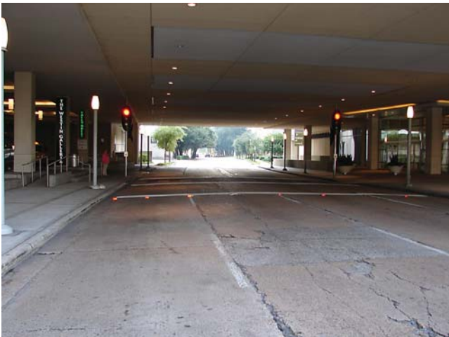
FIGURE 30 Stop-bar application Red Phase, Alabama Street at Galleria, Houston, Texas.

Initially there were problems with electrical “shorts” in the IPM system; however, this was attributed to initial system wiring rather than equipment failure. Once resolved, few additional maintenance issues were reported. As with other applications, it was noted that the IPM system markers do collect dirt and debris and require occasional high-pressure water cleaning (tunnel-like conditions under the pedestrian bridge prevents rain from self-cleaning the markers) (R. Taube, personal communication, July 23, 2007). Decreased luminous intensity was also noted with the IPM system markers. This is likely attributable to the reduced number of LEDs per illumination phase (i.e., 5 yellow or red LEDs per illumination rather than the more typical 10). The total cost for this IPM system was approximately $45,000, comprising material costs of $30,000 and installation costs of $15,000 (P. English, personal communication, July 23, 2007). The effectiveness of the IPM system at this location was measured at two different times following implementation: (1) initially following system implementation, and (2) following extended implementation