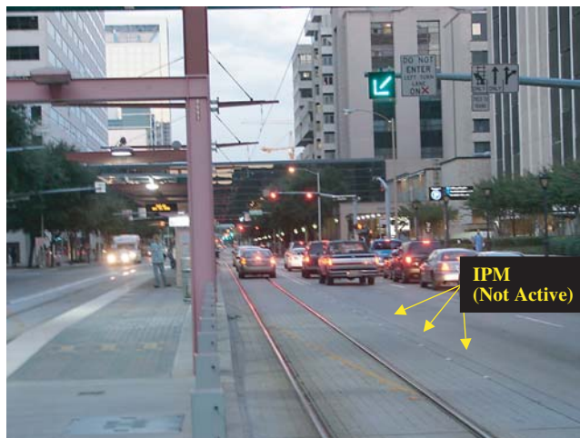
FIGURE 36 Left-turn restriction IPM system application (not active), Houston, Texas.

As with the previous IPM system applications in Houston, Texas, this IPM system was implemented with FHWA’s experimental approval. As part of this process, semi-annual reports are required to document the effectiveness of the application under experiment. The first report provided information on driver comprehension, traffic operations (including violations of the prohibited left-turn maneuver), and vehicle crashes.