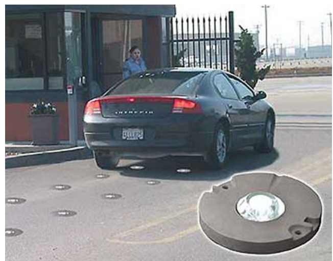
FIGURE 38 Vehicle and truck inspection point IPM system application.

Light pollution, attributable to conventional overhead roadway lighting systems, has prompted the use of IPM systems as an alternative source of illumination at a number of locations deemed to be environmentally sensitive.