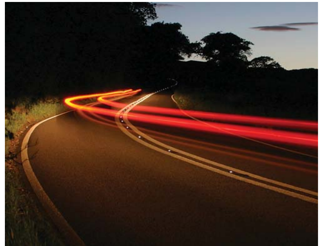
FIGURE 17 Horizontal curve IPM system application, Wales, United Kingdom.

In a laboratory setting in Australia, Styles (2004a) considered the activation performance of environmentally triggered IPM systems. Thirteen light-sensitive, five temperature-sensitive, and seven moisture-sensitive markers were tested according to their response to fading light, fog, and low temperature. Based on these tests, it was noted that the markers will perform their intended illuminating tasks: (1) before ice formation, (2) upon formation of moisture on their surface, and (3) in advance of light intensity levels falling below levels that are present with good street lighting.