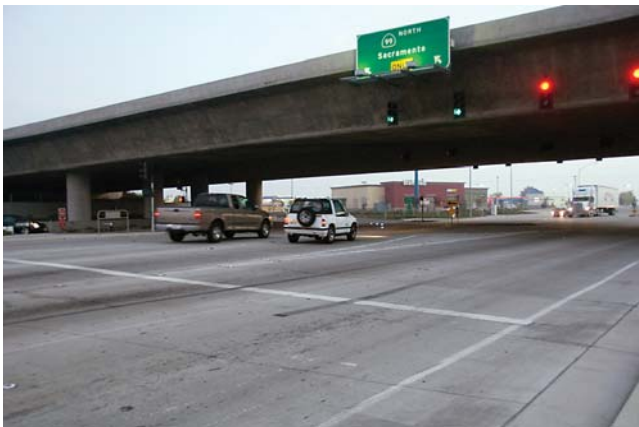
FIGURE 18 Multiple-turn lane IPM system application, Stockton, California (Courtesy: Caltrans).

The IPM system is activated during the left-turn phase of the traffic signal. The markers define the lane line of the two left-turn lanes and illuminate in a forward chase sequence, giving road users a sense of motion and providing positive directional guidance. The markers remain illuminated until the entire curve is lit; the chase sequence then repeats. The