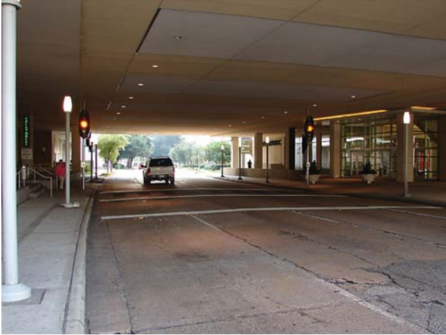
FIGURE 29 Stop-bar application Amber Phase, Alabama Street at Galleria, Houston, Texas.

Initially there were problems with electrical “shorts” in the IPM system; however, this was attributed to initial system wiring rather than equipment failure. Once resolved, few additional maintenance issues were reported. As with other applications, it was noted that the IPM system markers do collect dirt and debris and require occasional high-pressure water cleaning (tunnel-like conditions under the pedestrian bridge prevents rain from self-cleaning the markers) (R. Taube, personal communication, July 23, 2007). Decreased luminous intensity was also noted with the IPM system markers. This is likely attributable to the reduced number of LEDs per illumination phase (i.e., 5 yellow or red LEDs per illumination rather than the more typical 10). The total cost for this IPM system was approximately $45,000, comprising material costs of $30,000 and installation costs of $15,000 (P. English, personal communication, July 23, 2007). The effectiveness of the IPM system at this location was measured at two different times following implementation: (1) initially following system implementation, and (2) following extended implementation