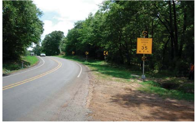
FIGURE 11 Horizontal curve IPM system application (daylight), Mount Pleasant, Texas.

Each marker cost approximately $55, with a total of 13 units installed ($715) and installation was performed by South Carolina DOT (SCDOT) personnel. The IPM system is likely too new (installed one month ago at the time of this report) to report any operational or maintenance related issues or to provide substantive perceptions of effectiveness. Personnel from SCDOT did indicate that 2 of the 13 chevron signs on the curve have been hit by vehicles since the recent installation of the IPM system. No information was provided regarding the frequency of crashes prior to IPM system installation for comparison (A. Leaphart, personal communication, July 2007).