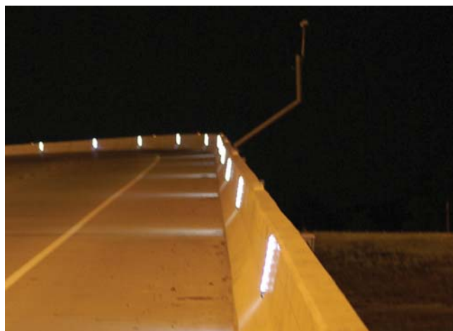
FIGURE 14 Horizontal curve IPM system application, Texarkana, Texas.

The IPM system at this location has experienced some challenges since implementation, but TxDOT is working with the manufacturer to remedy issues with the system. One challenge with this installation was the physical length (one-half mile) and the power requirements of each marker. Each marker requires 21 volts to operate, and ensuring enough voltage is available to illuminate the last sets of markers along the line was difficult because of power consumption along the cable. In response, the manufacturer developed special power reduction modules that adjust the initial 33-volt input to the required 21 volts per marker. At the end of the half-mile installation, no additional power reduction is necessary to achieve the required 21-volt power. Personnel from TxDOT suggested that this installation would have been easier if a power supply had been provided at each end of the line. The IPM system cost $56,000 for an approximate half-mile length of roadway, which included equipment and installation.