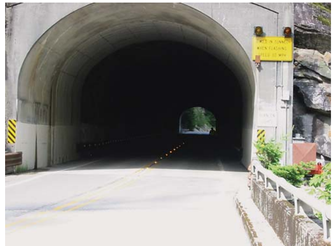
FIGURE 26 Tunnel IPM system application, between Newhalem and Diablo, Washington.

Some maintenance is required to clean the individual markers every three to six months as debris and dirt on the