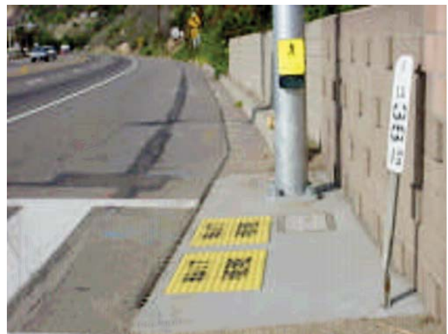
FIGURE 2 Pressure mat activation system.

VIVDS, capable of sensing a change in the background image of a particular view, provide a more sophisticated passive activation system. In pedestrian crossing applications, a sensor detects a change in pixel configuration when a pedestrian enters the viewfinder of a video detection unit. This subsequently alerts the IPM system that a pedestrian is waiting