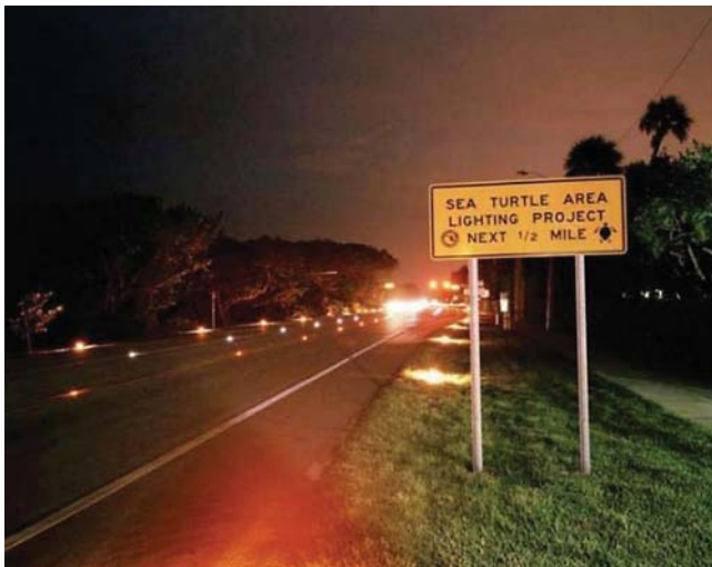
FIGURE 39 Environmentally sensitive area IPM system application SH A1A Boca Raton, Florida (Courtesy: SmartStud Systems).

Although no IPM system costs were directly reported, a resurfacing project is planned for SR A1A that will provide continued use of the existing half-mile IPM system and extend the system for an additional half-mile. The cost of the combined resurfacing/IPM system project is $500,000 (A. Broadwell, personal communication, July 26, 2007).