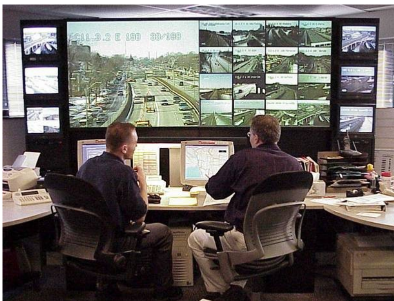
The NITTEC traffic management center.

NITTEC measures the performance of incident management on the region's roads, collects data on freeway and tollway volume and speeds, and tracks the performance of the ITS equipment used by NITTEC. Coalition staff prepare report cards for the member agencies on a monthly basis that contain performance information on the performance of the operations center and the performance of the ITS field systems. It uses standards and performance goals to guide the organization. Additionally, NITTEC collects and uses real-time information on the