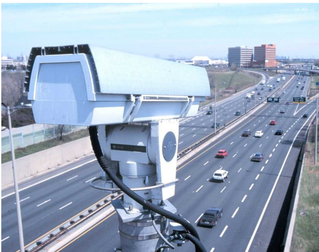
Local agencies in the Phoenix metropolitan area advance regional operations by sharing control of traffic cameras.

AZTech found that smaller agencies lacked the resources, staff, and systems for some of the regional operations initiatives that the group pursued. The larger agencies, such as Maricopa County DOT, were able to operate signal systems for the smaller agencies and to provide them with expertise and information. Another significant benefit of the AZTech partnership was the use of regional procurement contracts. There are an estimated 17 regional procurement contracts established that expedite procurement of goods and services for agencies in the region. The region collectively saved about $900,000 through joint procurement for a camera control system.