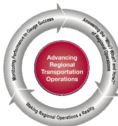
The three related aspects of regional transportation operations that were the focus of the workshop.

The National Workshop to Advance Regional Transportation Operations was organized around three fundamental and interrelated aspects of regional transportation operations. These three aspects (see figure, below) move transportation systems management and operations from concept to reality by focusing on the essential elements for improving transportation system performance. These aspects are “Answering the Who, What, and How of Regional Operations,” “Making Regional Operations a Reality,” and “Monitoring Performance to Gauge Success.” The boundaries between the three aspects of regional operations are blurred, and at times may blend together, but they were used to organize participants’ thinking about the topics. These three aspects are explained in greater detail in the sections that follow.