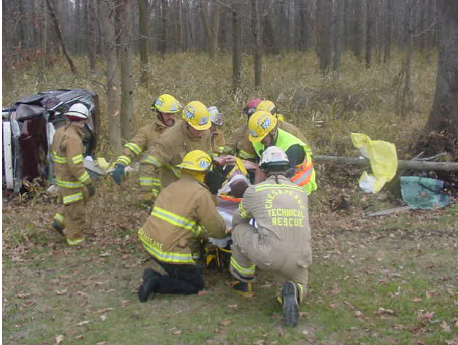
Traffic incident response in Hampton Roads, Virginia.