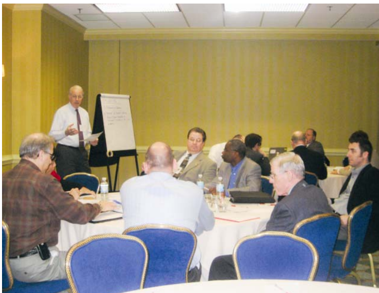
Participants develop approaches for advancing regional traffic incident management.

One of the greatest challenges brought up during the workshop was maintaining the regional operations effort after the loss of a champion, leader, or participant from a core participating agency. A workshop participant suggested that it is crucial to institutionalize the collaborative effort shortly after formation. Because champions and leadership can change quickly, many viewed this effort of institutionalizing as a race against time. Suggestions for institutionalizing regional operations included developing an RCTO or written agreement signed by key organizations that demonstrated commitment to the effort.