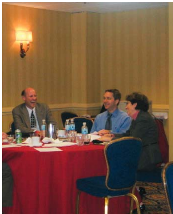
Workshop participants make connections across organizations.

A two-tier structure was also proposed as an effective way to structure a regional operations effort. One tier contains the core agencies that are required to make the regional operations effort happen. The other tier is composed of stakeholders who need to have input on the effort.