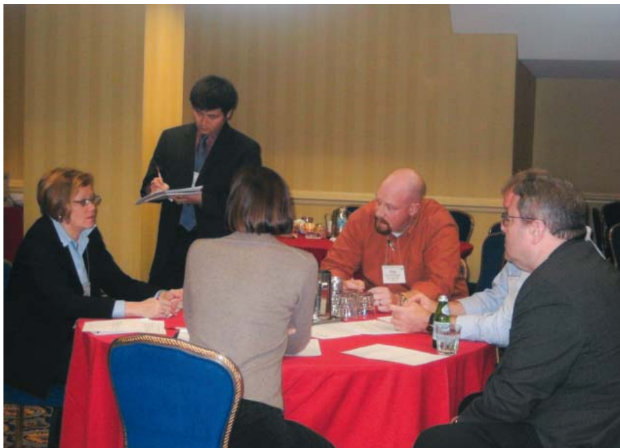
Workshop participants during a small group exercise.

the association wants to make sure that its members can move their freight as quickly as possible after an incident. For example, Washington State suffered a huge catastrophe and had to shut down Interstate 5 for days. An economic study was done afterwards in the region and found that many millions were lost as a result of the highway closure. While the area suffered financially, one benefit of the incident was increased momentum for a regional operations initiative within the state to help notify freight carriers and other travelers early enough that they can avoid the area in the event of a major incident. This momentum resulted in area operators putting together a plan for improving coordination and information dissemination during major events.