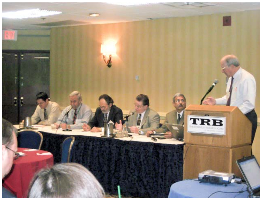
Panelists discuss implementing regional operations initiatives.

Equally important is the ongoing commitment needed to sustain management and operating strategies to improve transportation system performance in the region. Most infrastructure investments require periodic preventative or restorative maintenance—as do some TSM&O projects. However, management and operations strategies require day-to-day attention since they tend to be dynamic in nature and respond to current and anticipated conditions. As a result, management and operations strategies are often 24-hours-per-day, 7-days-per-week services that require constant oversight for them to be effective. For example, traveler information systems depend on collection, analysis, and dissemination of timely, accurate, useful, and accessible information about the current and anticipated condition of transportation facilities and equipment. Similarly, TIM requires surveillance, communications, response, and traveler information whenever and wherever incidents occur.