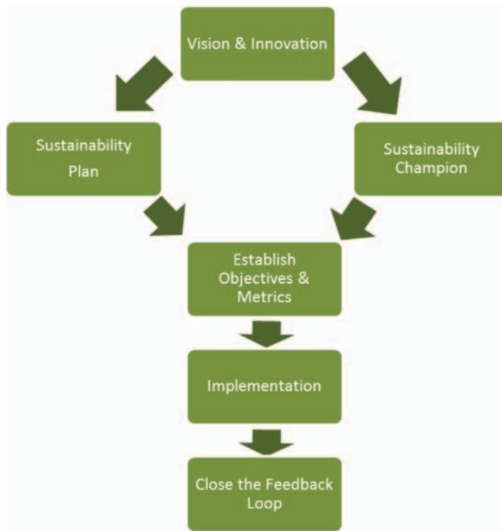
Figure 2. Flowchart to approaching sustainability at airports.

in the long term? The case studies conducted through this research sought to answer these important questions.