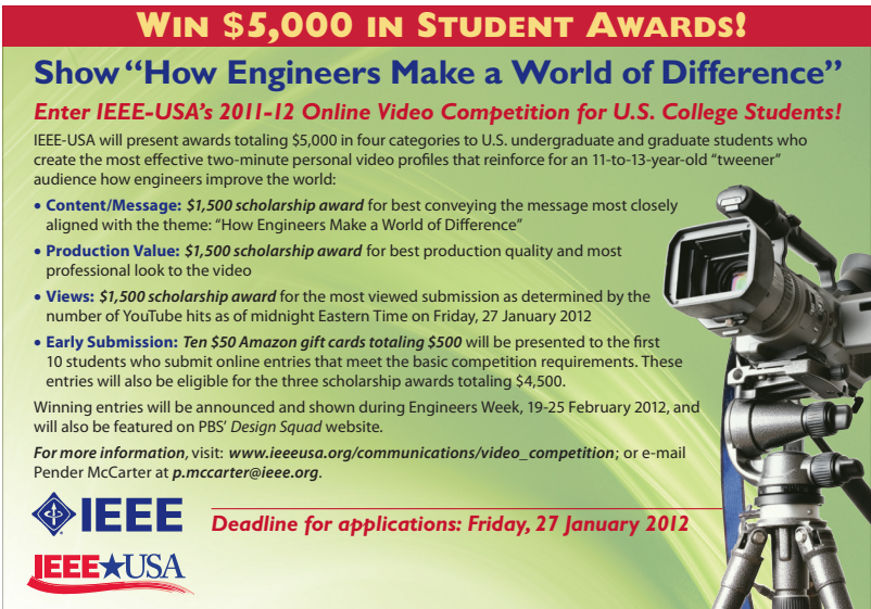
FIGURE 2-3 IEEE-USA Notice Describing Its 2011–2012 “World of Difference” Video Contest