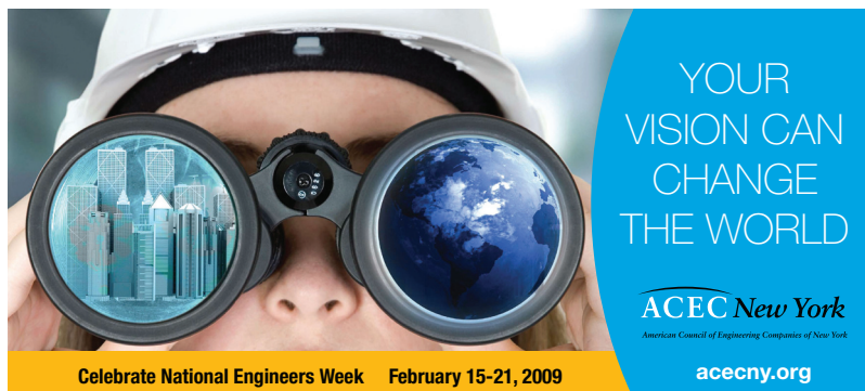
FIGURE 2-8 ACEC New York Ad Promoting Engineering