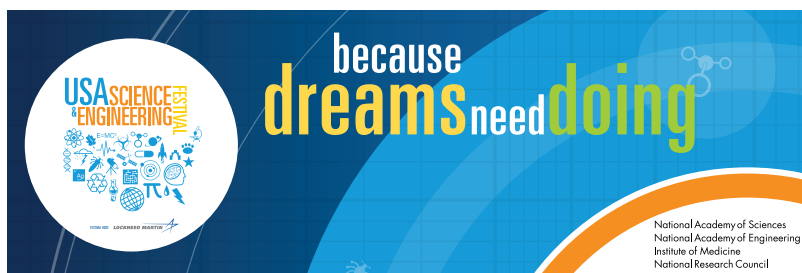
FIGURE 2-7 National Academies Signage for 2010 USA Science and Engineering Festival

large-scale outreach campaigns, and use of the CTC messages at the University of Colorado–Boulder to recruit new students (described above). The Bridge is mailed to about 7,000 subscribers, including all members of Congress, NAE members, and participants in the NAE’s Frontiers of Engineering program ( www.naefrontiers.org ).