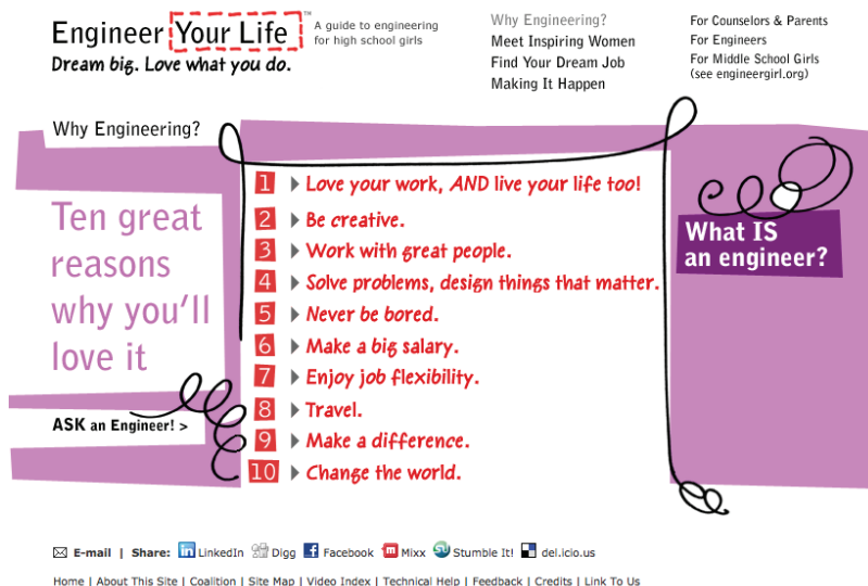
FIGURE 2-2 Screenshot of Engineer Your Life “Why Engineering?” Page Featuring Excerpts from Several CTC Messages

The Engineer’s Pledge (Box 2-1). EYL also provides training sessions to ensure that thousands of engineers and educators know how to talk about engineering positively, and effectively, to girls.