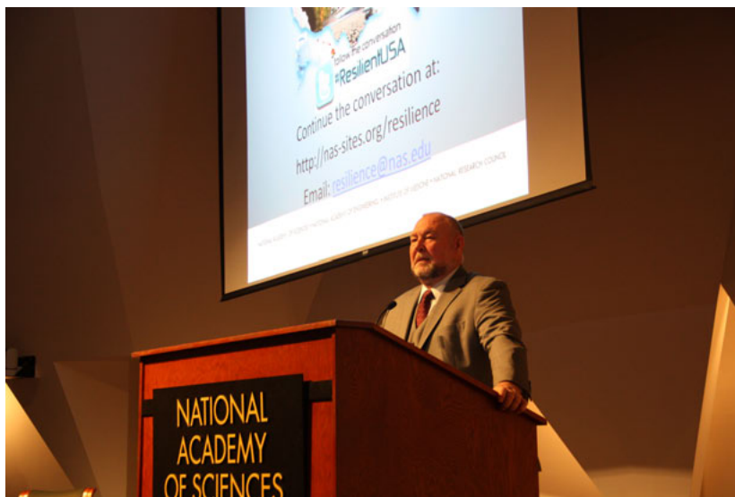
FIGURE 2-2 Admiral Thad Allen highlighted the importance of understanding the various roles and responsibilities of different stakeholders in supporting steps toward greater resilience.