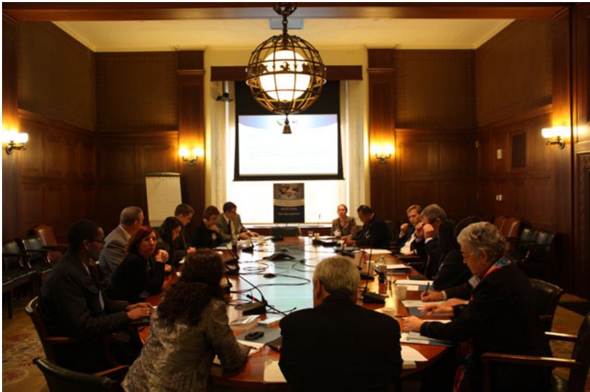
FIGURE 3-1 Discussions held by one of the risk management breakout groups.

because of how it could provide valuable information which could influence behavior and action. The use of the International Organization for Standardization (ISO) 31000 for risk management has been helpful in providing a nationally agreed upon methodology that provides standards and guidance for the risk management process. However, some participants commented that the current practice of using risk management jargon to convey risk has made it difficult for both decision-makers and the public to grasp the concept of risk and to determine what the possible responses should be. If the ability to manage risk is a goal in increasing resilience, the vocabulary of risk would need to change so that both decision makers and the public can better understand risk and its consequences. In particular, one participant mentioned the need to examine the risk discussions in the context of New York, New Jersey, and Connecticut's decisions and responses to Superstorm Sandy in order to more fully understand the rationale behind those decisions and responses. In that way, future decisions could benefit from lessons of those experiences. Individuals from one breakout group suggested that a new smartphone application could be developed to help users understand hazards and risks in terms that are easily grasped by the lay-public.