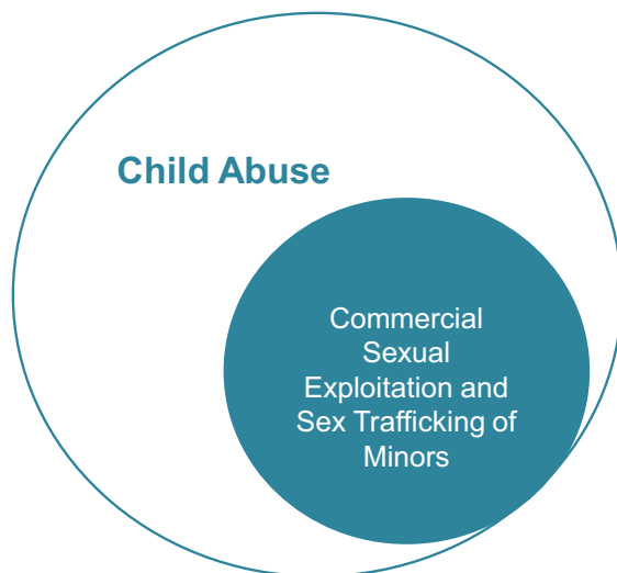
FIGURE 1 Commercial sexual exploitation and sex trafficking of minors are forms of child abuse.

NOTE: This diagram is for illustrative purposes only; it does not indicate or imply percentages.