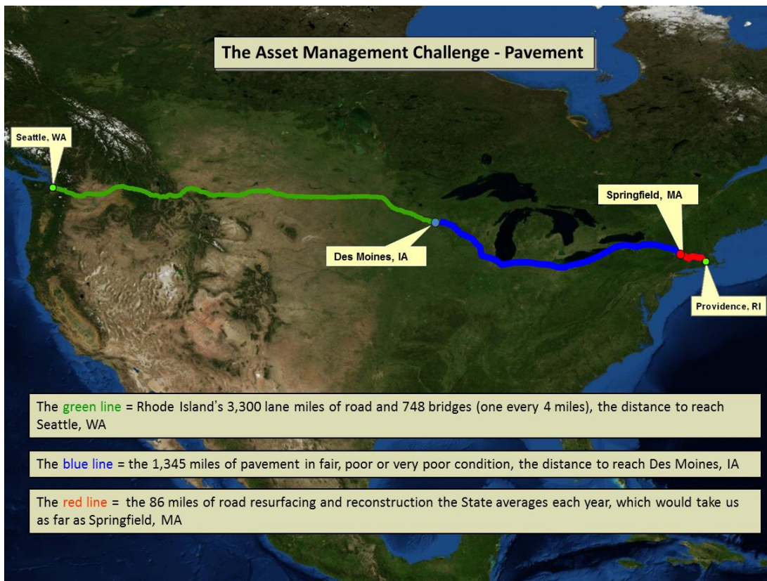
FIGURE 4 Rhode Island DOT: presenting pavement management information.