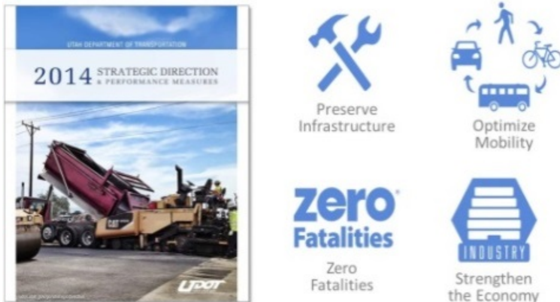
FIGURE 2 Utah DOT's strategic direction report and four strategic goals.