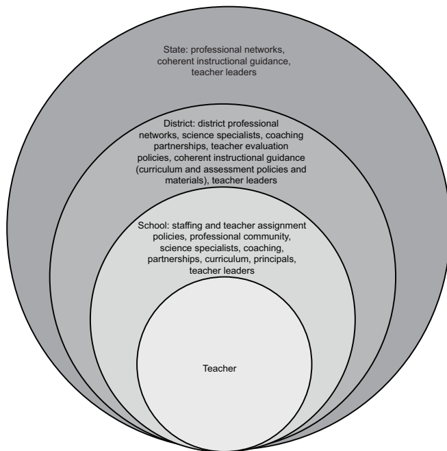
FIGURE 8-1 Contexts for teachers' learning.

(2000, p. 110) observe in their study of mathematics education reforms in California,