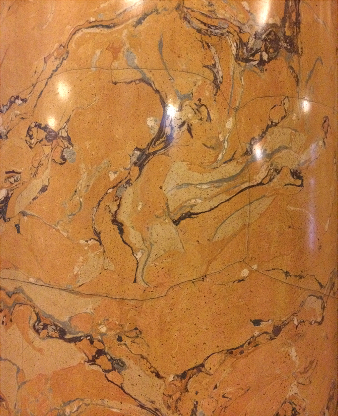
Figure 7: Detail of restored column in Portland City Hall, 2013