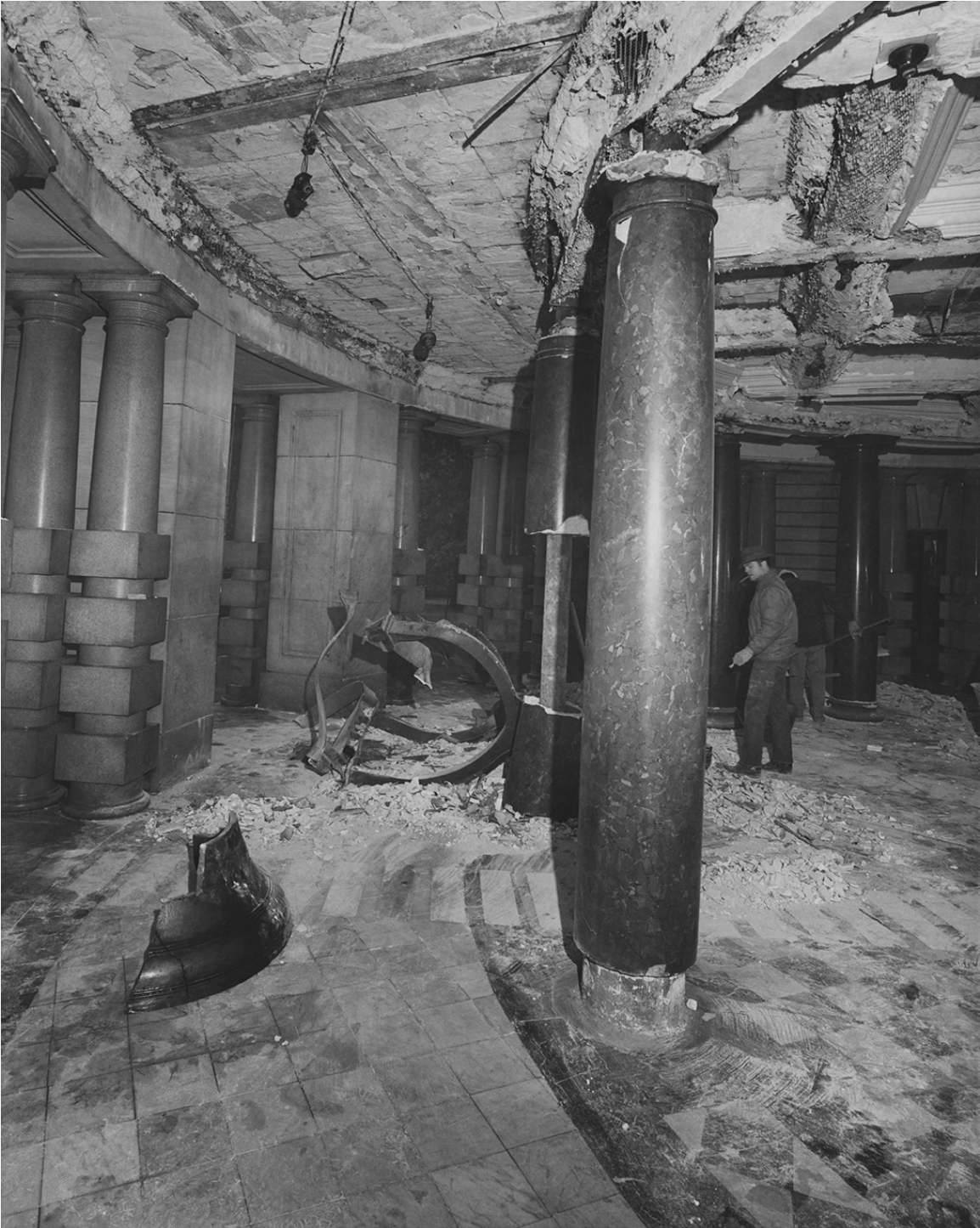
Figure 6: City of Portland Archives, Oregon, 4410: City Hall exterior and Liberty Bell after bomb blast. Record Series 2001-09, 1970.