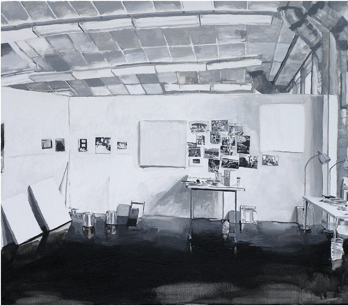
Figure 1: Studio I , oil enamel on canvas, 28" x 32", 2011