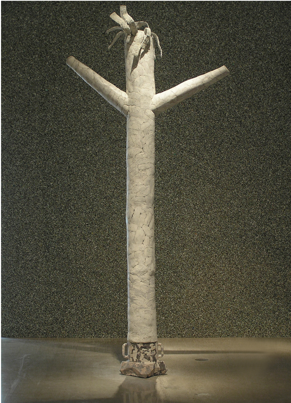
Figure 8: Rock, Steady (foreground), plaster, pigment, and steel, 147.5" x 66" x 20", 2014, Background Noise (background), foam carpet padding, 178.5" x 170", 2014