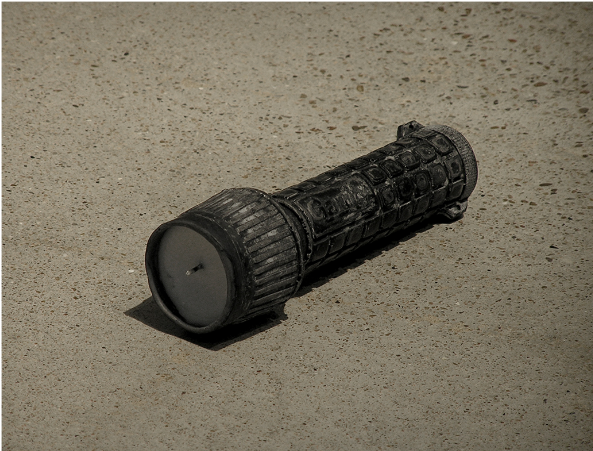
Figure 10: Black Light , wax, pigment, and wick, 3" x 8.75" x 3", 2014

A search may never yield its intended results while great discoveries are stumbled upon by accident. Between these two scenarios is the finding of one thing while in pursuit of another. The bombing of Portland City Hall, for example, was intended to send a political message to local government officials, yet in the rubble an art form edging towards extinction was recovered. Black Light holds the ability to illuminate a darkened space but with the threat of self-destruction, as it would slowly melt away. A candle in the guise of its brighter counterpart, and in many ways its successor, romantic occasions notwithstanding. Though the low, warm light of the flame is only suggested, intimacy is essential to this object