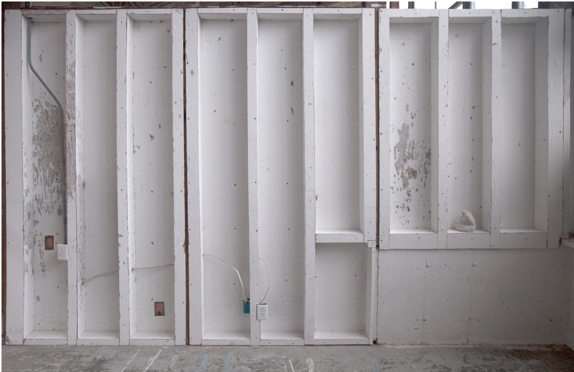
Figure 4: Maine Coastline , found plywood and found screws, 92” x 144” x 6”, 2013