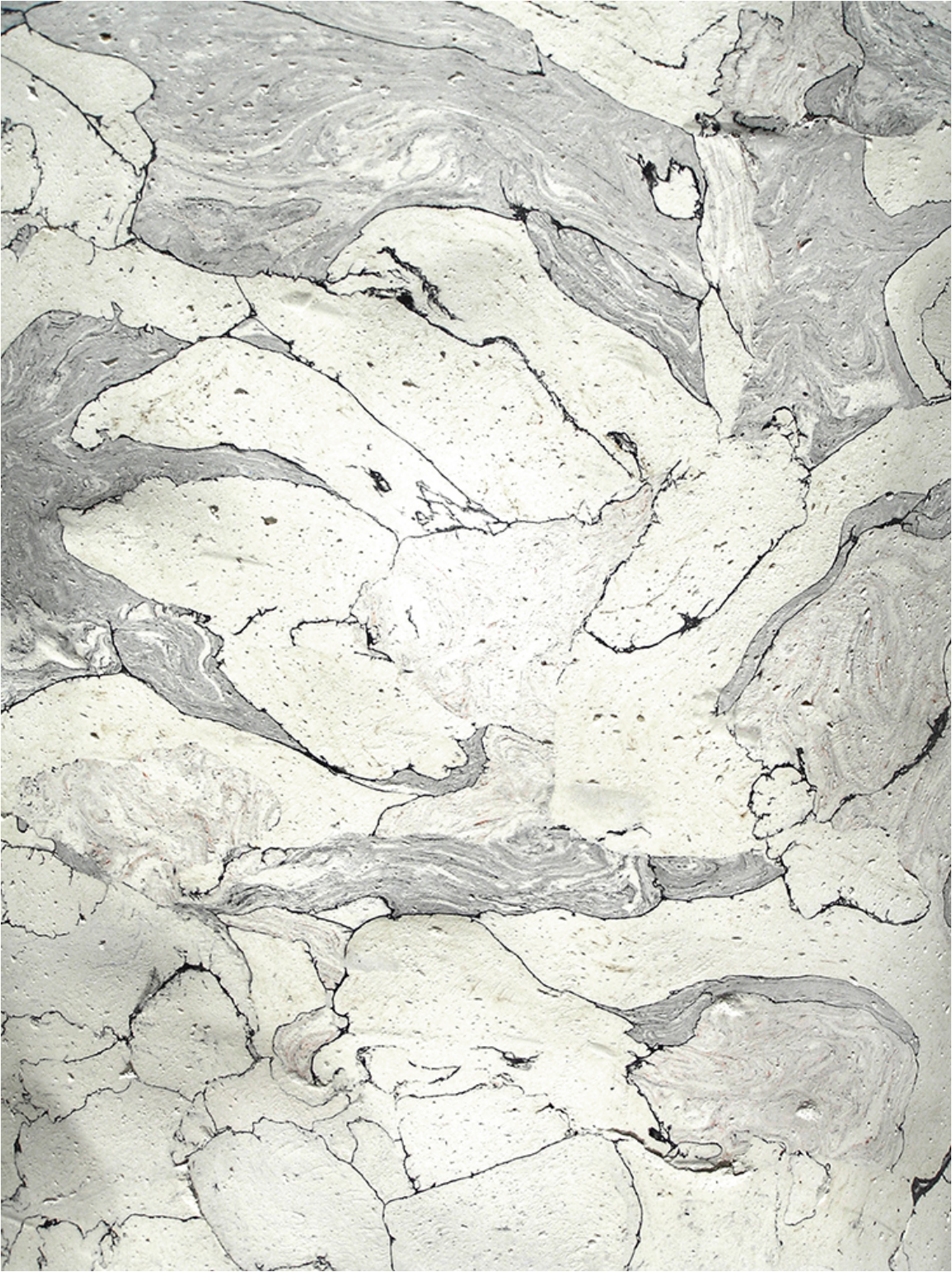
Figure 9: Rock, Steady (detail), plaster, pigment, and steel, 147.5" x 66" x 20", 2014