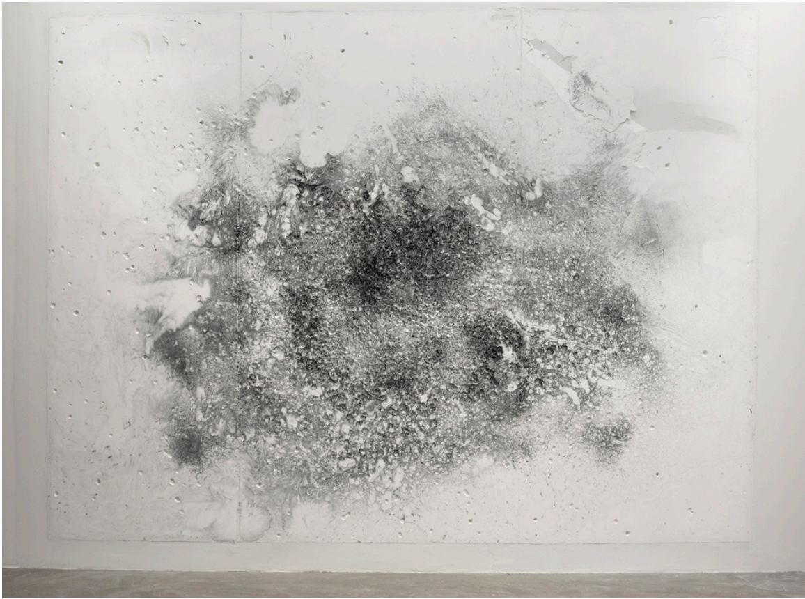
Figure 2: Dispersion Wall , graphite powder and plaster embedded in drywall, 87" x 123", 2012

In Dispersion Wall , I cast plaster over powdered graphite in a large rectangular cavity removed from my studio wall. The drywall was unscrewed from the structural supports, laid face down on the ground, and wet plaster filled the void. The movement of the flicked and poured plaster is recorded in the displacement of the graphite powder, the image infused into the substrate. Working from front to back, the face of the piece becomes obscured by subsequent layers of plaster building up behind it; this makes it a bit like working in the dark, the resulting image a mystery until it is dry, lifted off of the mold and back into its vertical position. In form and function a Rorschach inkblot may most adequately describe