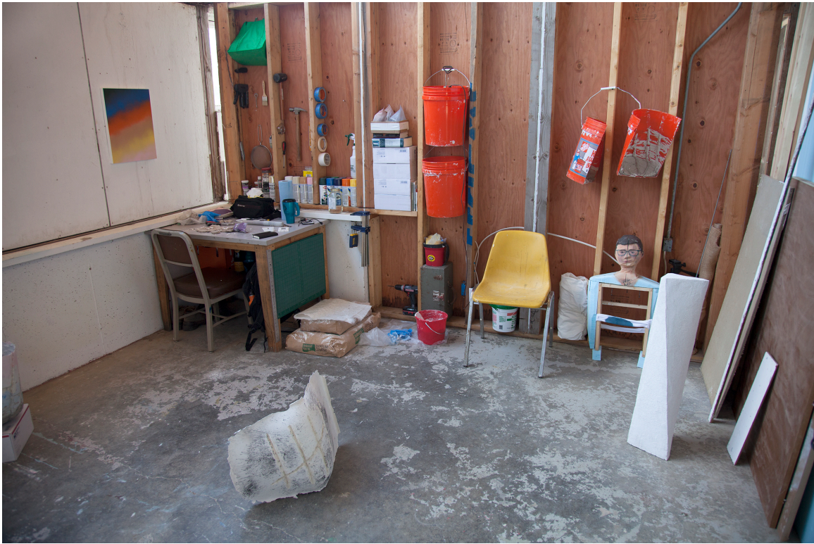
Figure 5: View of studio wall opposite Maine Coastline , 2013