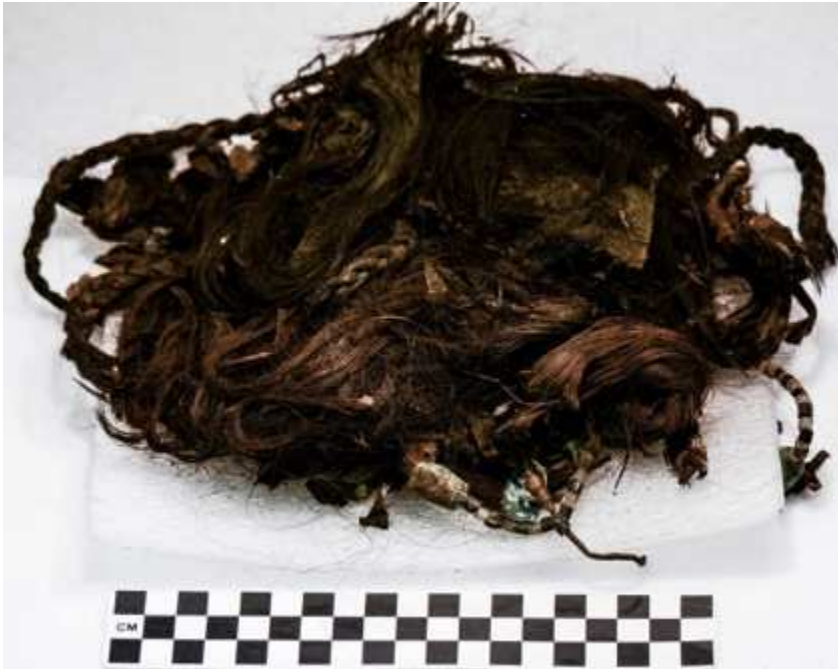
Hair and scalp from Rantoul Woman decorated with thimbles, glass beads, ermine tails, braids, and coins