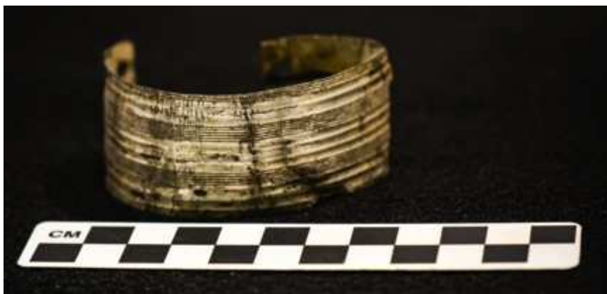
Bracelet #1- German Silver bracelet associated with the Vilas Co. Infant burial