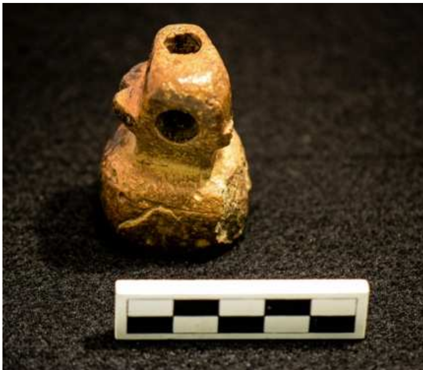
Stone Micmac pipe associated with the Vilas Co. Adult burial