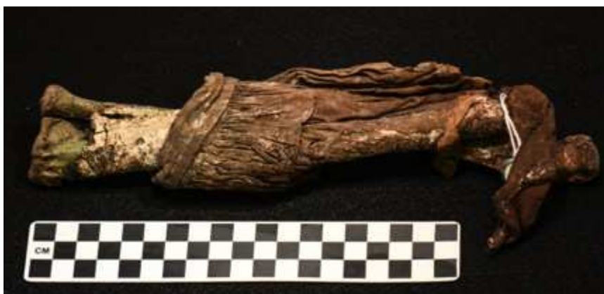
Right ulna and radius with skin and blouse fragments from Rantoul Woman