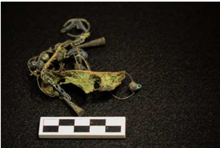
Desiccated ear tissue with cone and ball tinkler decorations, chain, and coins