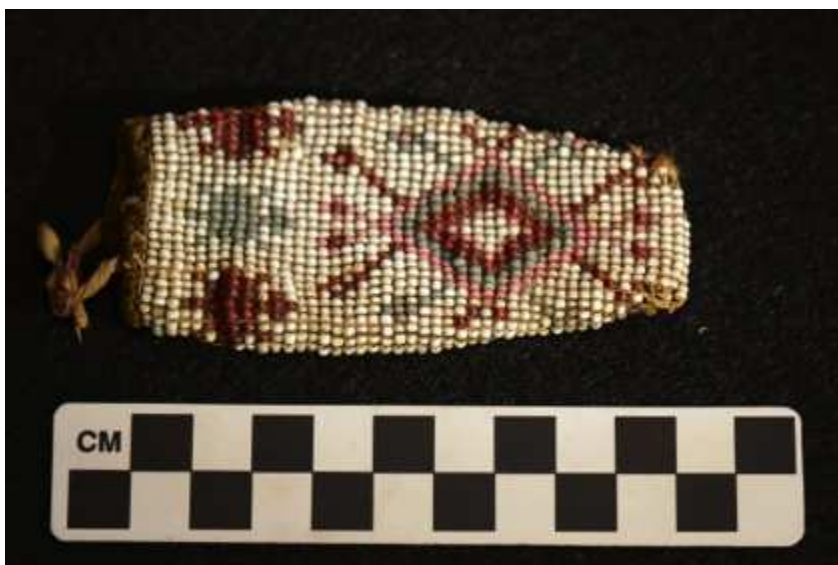
Beaded charm bag (Bag # 2) from Rantoul Woman; made with seed beads, and twine/hemp