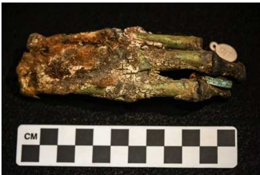
Left hand with fabric, hide, and ring