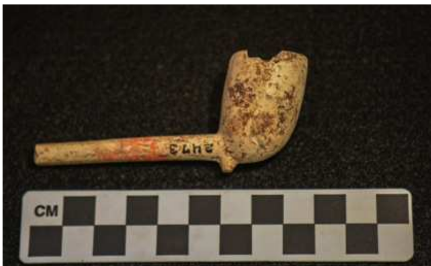
Kaolin pipe associated with Rantoul Woman