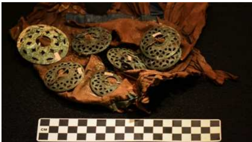
Petticoat fragments with ribbon, German silver brooches, and tinkling cones from Rantoul Woman