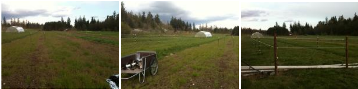
Figure 2.2: Electric fence preparations in Field D3-1.

move from their designated paddock to the shelter area at will. In addition to the main grazing paddocks, I also fenced off three areas around the perimeter of Field D3-1 (called “relief paddocks”) to serve as additional forage resources in case the cover crops within one of the fourteen paddocks required more time for regrowth. Relief paddocks varied in size and were accessible via designated pathways that extended from the shelter area. Gates leading into Field D3-1 and into the main and relief paddocks were installed and are represented by the small red rectangles in Figure 2.1. The chickens required additional fencing to deter predators (mainly coyotes) and to prevent them from wandering outside of their designated paddock. For this, I installed a removable electric net fence along the interior perimeter of their paddock in the rotation.