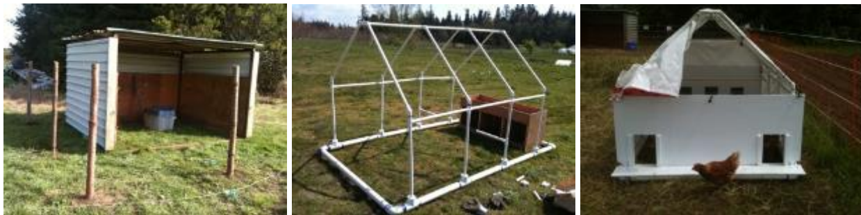
Figure 2.3: The cattle shelter (left) and the PVC mobile chicken shelter (centre and right).

tarp. The dimensions of both shelters, including the roosting areas and nest boxes in the chicken shelter, satisfied the BC SPCA and Canadian organic production standards (Figure 2.3).