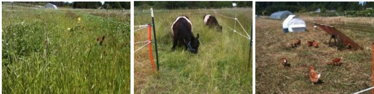
Figure 2.4: Cover crops in the third growth phase (left); the cattle and chickens in their respective paddocks (centre, right).