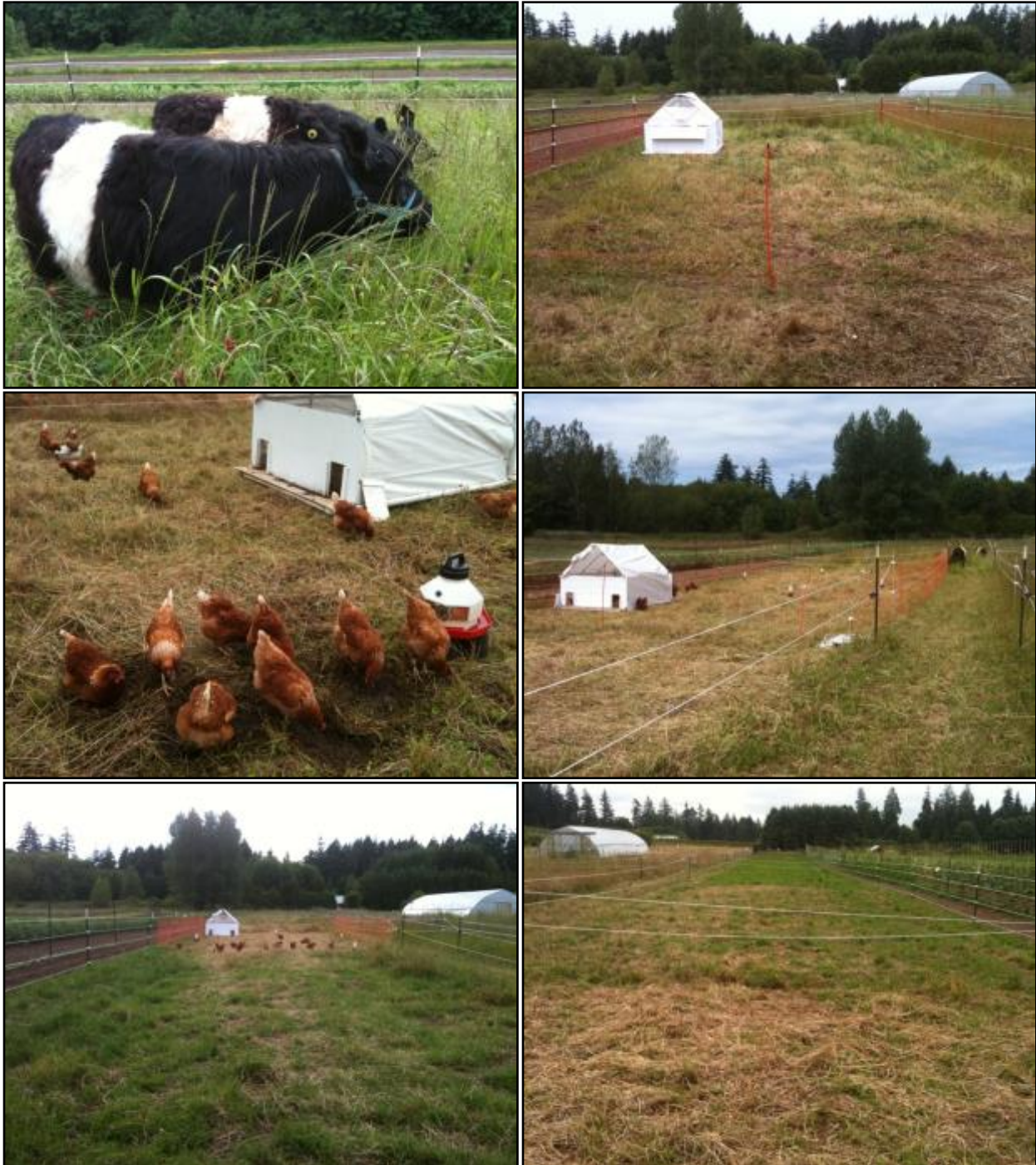
Photos: The cattle's first graze in Paddock 1 (top row, left); chicken paddock set up (top row, right); chickens at work (middle row, left); cattle and chickens in the rotation (middle row, right); forage regrowth in Paddock 1 (bottom row, left); forage regrowth in Paddocks 1 (furthest away) through 5 (bottom row, right).