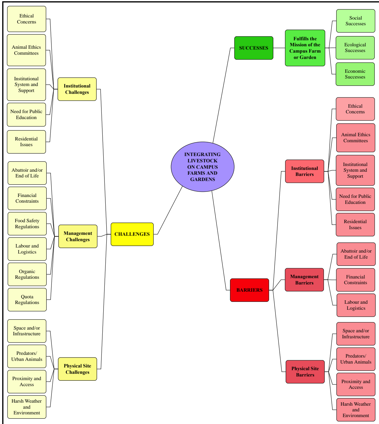
Figure 4.1: Coding map of the findings from an analysis of the interviews.

Figure 4.1 summarizes the findings, showing the participants' responses of the successes, challenges and barriers of integrating livestock on their campus farms and gardens.