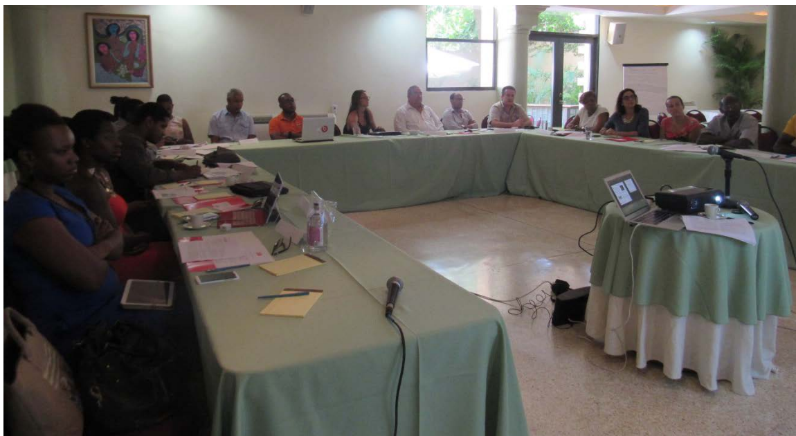
Figure 2.2: Participants at the Finance for Social Change Workshop in Haiti (2016).