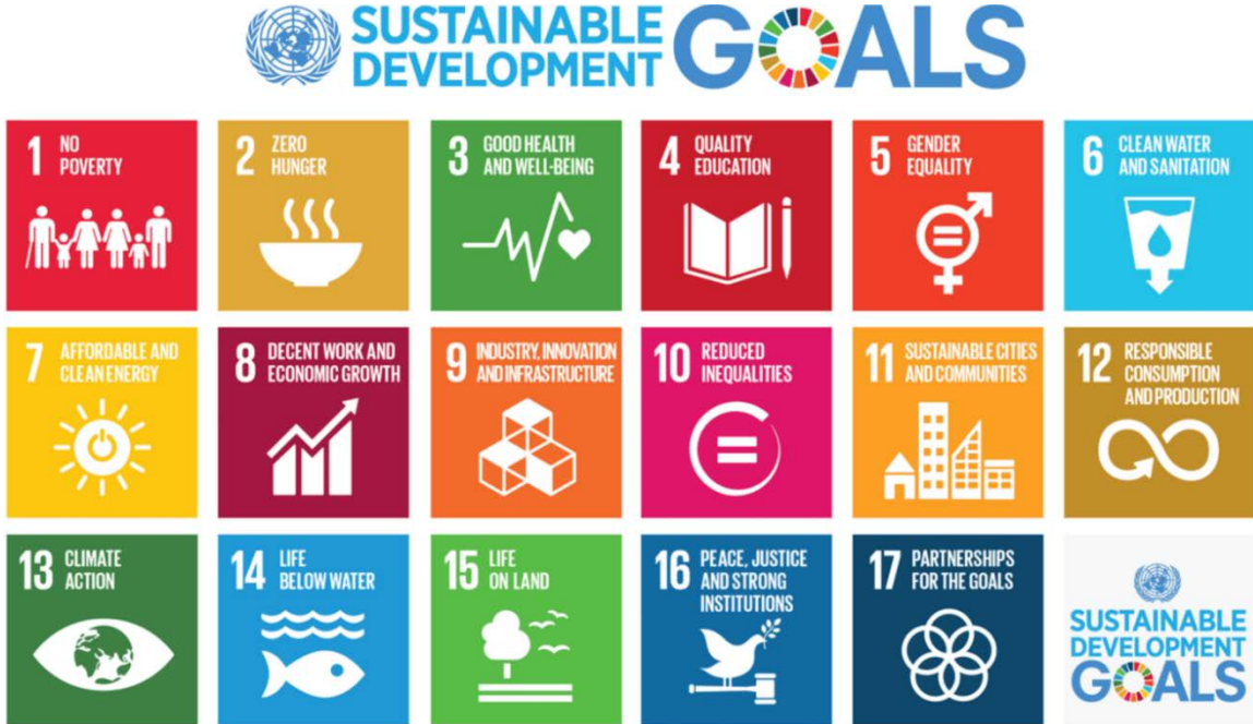
Figure 3.1: The United Nation’s Sustainable Development Goals.

In 2015 the United Nations launched their Sustainable Development Goals (SDGs), which are seventeen goals for global development to be met by 2030, as seen in Figure 3.1. All seventeen goals focus on social and environmental considerations such as eradication of poverty, job creation, climate change, conflict resolution, gender equality, and so on. The SDGs provided more specificity around global development targets and were designed very intentionally with a multi-disciplinary approach. The goals are intended to be a framework for countries to use but do not dictate ways to do so, which allows countries to define strategies that are specific to their needs and their way of doing things.