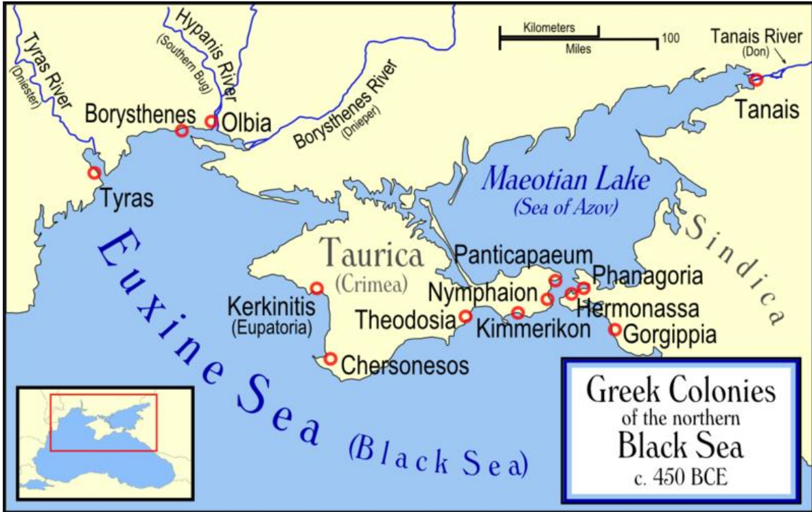
Figure 1: Northern Pontic