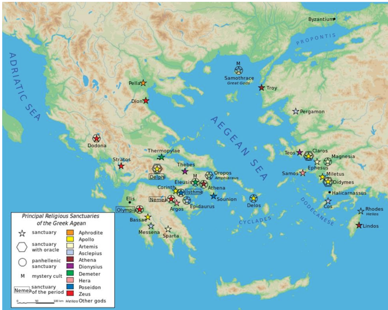
Figure 5: Hellenic sacred sites and cult centers

Note on Appendix A: All maps with the exception of Figure 4 obtained from public domain, Wikimedia Commons. Figure 4 comes from M. A. Czaplicka, Aboriginal Siberia: a Study in Social Anthropology . Oxford: Clarendon Press (1914). Accessed online at ( https://archive.org/details/aboriginalsiberi00czap ).