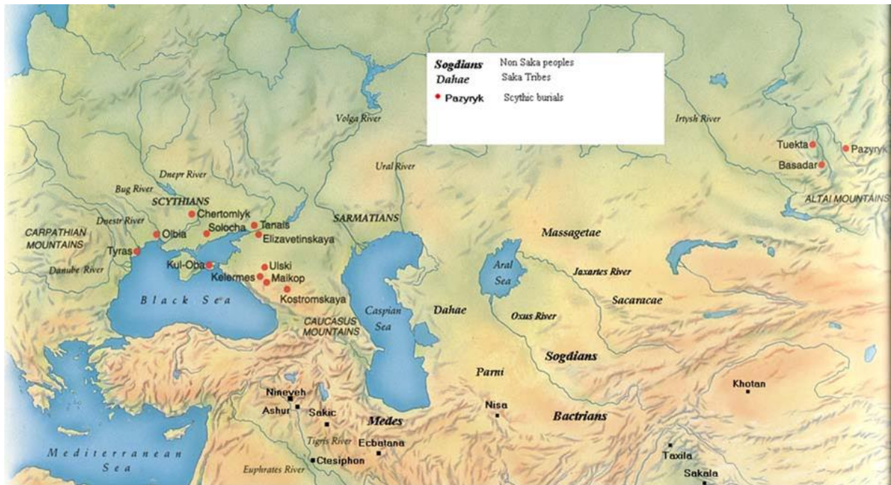
Figure 3: Scythian world and associated funerary sites