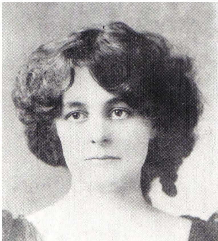
Figure 7.1: Maud Gonne, aged 23 in 1899 51

Example 7.3: “Brown Penny,” mm. 1-3. The scales in the treble clef of the accompaniment evoke the “loops of her hair” mentioned in the text.