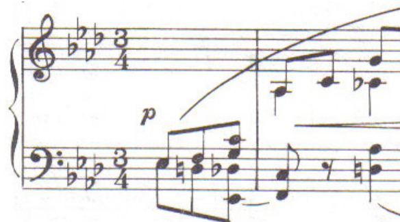
Example 7.6: “Min Tankes Tanke” by Edvard Grieg.

Copyright © 1983 by Wm. C. Brown Company Publishers.