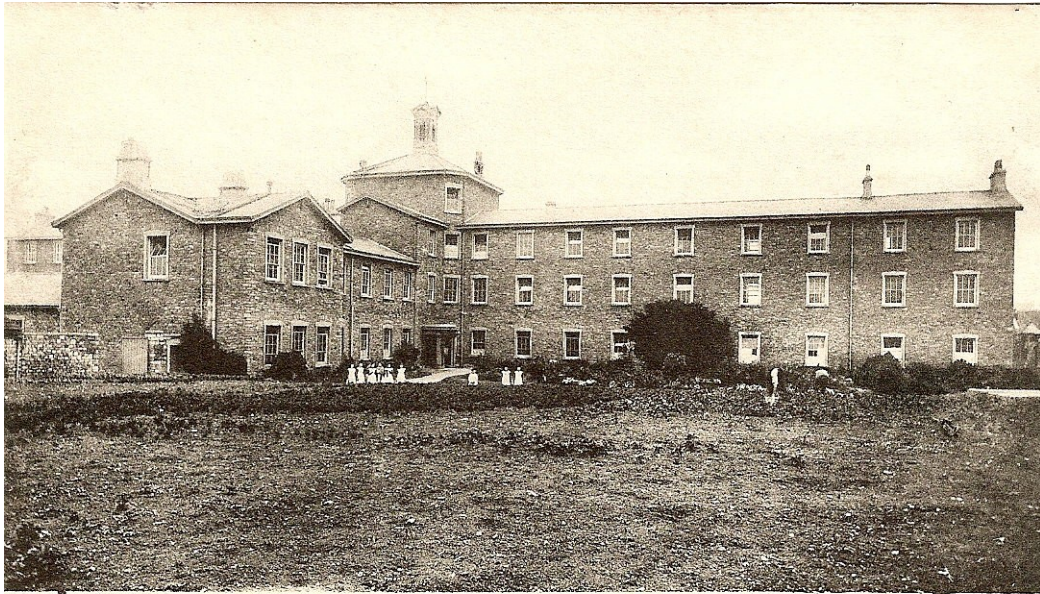
No. 1. Ashley Down Orphan Houses, Bristol.