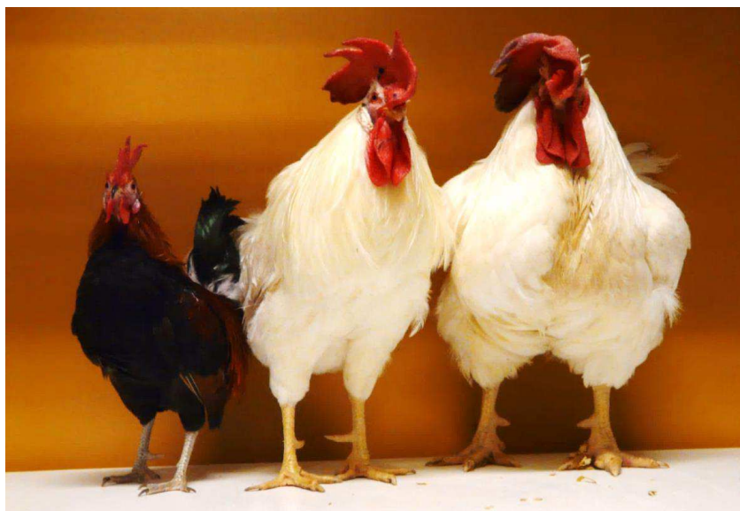
Figure 1. From left: Red Junglefowl male, White Leghorn male, Broiler male.

Besides the obvious phenotypic differences described for the White Leghorn and Red Junglefowl, they also differ with respect to behaviour. In general, the White Leghorn is less active, shows a less intense social behaviour and lower frequency of social interactions, has a reduced antipredator behaviour and lowered response towards a fearful stimulus (Campler et al., 2009; Schütz et al., 2001; Schütz and Jensen, 2001).