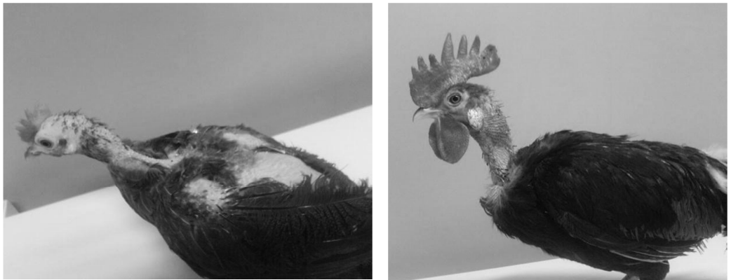
Figure 2. Feather pecked Red Junglefowl female (left) and male (right). Feathers missing on back and neck.

Feather pecking is an abnormal behaviour among different species of fowl kept in captivity, where feathers are pecked at or removed from one bird by another (Fig. 2). The behaviour can lead to cannibalism and is therefore a severe welfare problem often seen in the poultry industry (Dixona, 2008). Studies of individuals selected for being homozygous for either the PMEL17 wild type allele or the Dominant white allele showed that pigmented wild type individuals were more exposed to feather pecking than non-pigmented dominant white chickens (Keeling et al., 2004a). This was confirmed by (Nätt et al., 2007) who, not only showed that homozygous wild type females were more exposed to feather pecking than homozygous Dominant white females, but also that the genotypes seemed to differ in social behaviour.