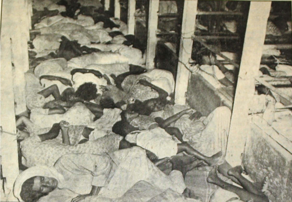
Image 6.2: The Mercury , 'Refugees Find Peace in Cowshed Sanctuary, 17 January 1949

Thousands of frightened, beaten and bewildered Indians are flocking to the refugee stations in Durban. Who is to care for them, where they are to go, how they are to be fed, what arrangements can be made for sanitation and shelter? These are questions facing authorities already busy with the organization for quelling the fighting, looting and burning ... Facilities in most of the camps are bare essentials. The women and children, and many men, cluster on the grass ... A family squats on the grass with its pitiful bundles in wisps of cloth - all that remains of a home or a business ... The biggest refugee camps are at Wentworth (7,000), Clairwood (6,000) and Malvern and Cato Manor (2,000) each. 307