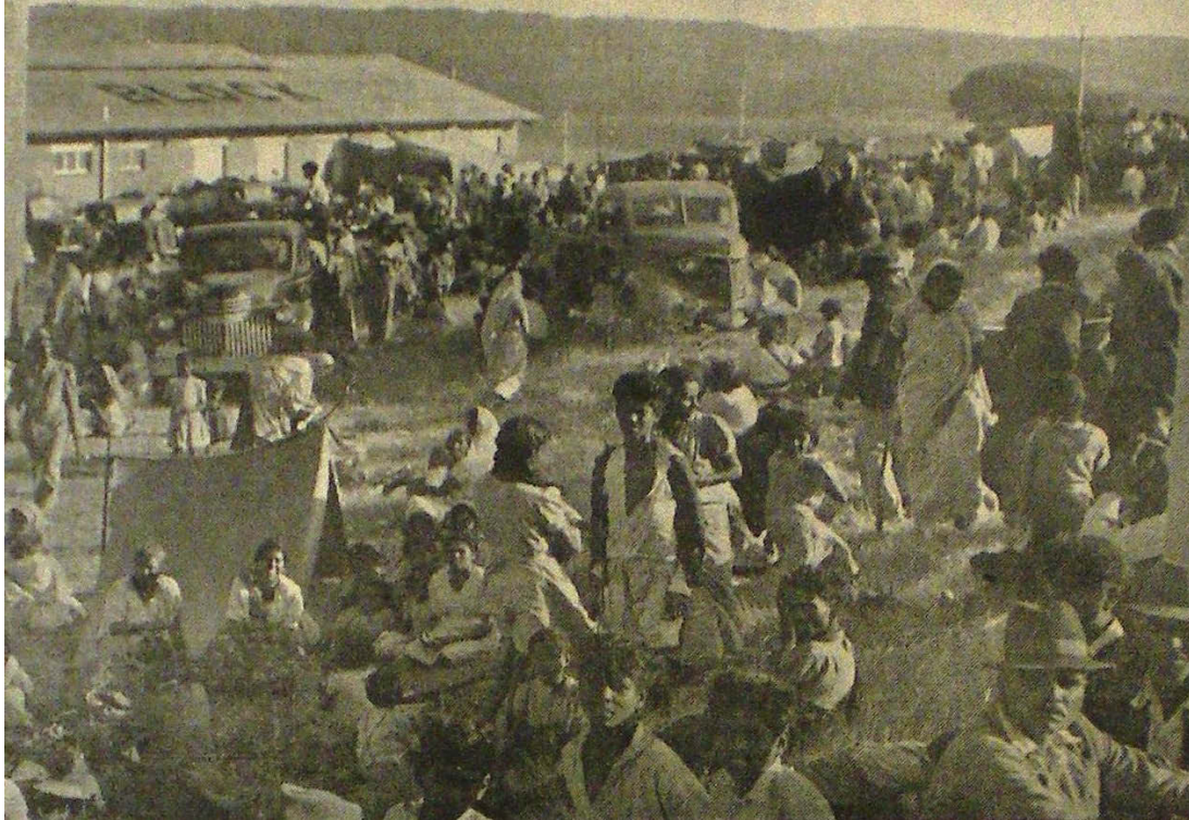
Image 6.3: The Mercury , ‘The Pathetic Aftermath of Terror’, 17 January 1949

The aftermath of the ‘riot’ left not only the media debating issues of where people should live, but also had politicians in a frenzy over what was to be done, and the countless proposals that were put forward all had the common thread of separation: