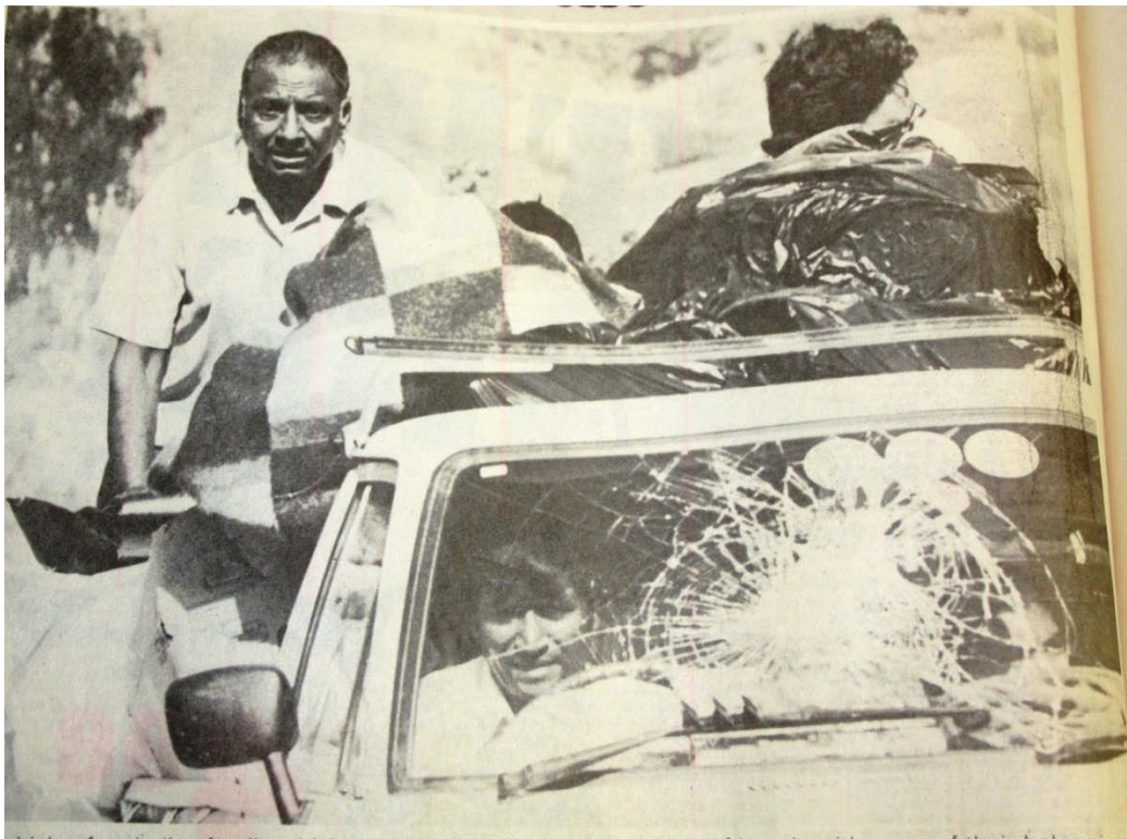
Image 6.6: The Mercury , 'Fear and fire in the townships', 9 August 1985