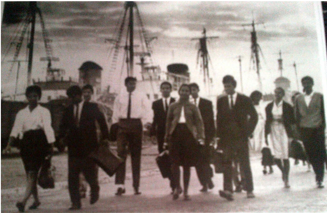
Image 6.4: UKZNDABA, Monthly Campus Newsletter Volume 7, Number 3, March 2010

This experiment, discussed in the extract above, was taken further with the opening of the University of Durban-Westville (UDW) in 1961 on Salisbury Island, for the sole registration of ‘Indian’ students. It was referred to then as the University College for Indians and only renamed in the 1970s when it was awarded the status of a university and relocated to Westville (UKZNDABA, 2010:5). 324 The picture below depicts students arriving at Salisbury Island via ferry to attend classes.