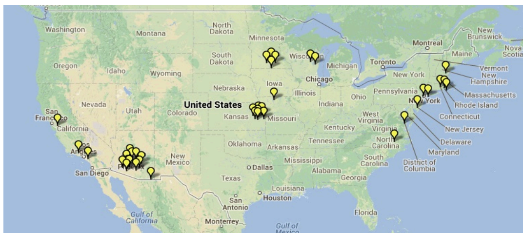
Figure 2. Athletic training practice-based clinical practice sites. From “AT-PBRN Clinical Practice Sites,” by Athletic Training Practice Based Research Network, 2017 ( http://www.coreat.org/clinical-practice-sites.html ). Copyright 2017 by A. T. Still University Athletic Training. Reprinted with permission.

About 7.8 million high school athletes participated in interscholastic sports in 2014-2015 (Comstock et al., n.d.). The sample in this study included ( n = 1613 ) high school athletes (805 boys, and 808 girls) from several regions in the United States (Figure 1). Therefore, this sample represented about .0002% of U.S. high school athletes. Since the sample for this study was a small sample of convenience the results may only be may be generalizable to high school athletes in the regions of the U.S. that are included in this sample. When samples cannot be randomly selected, researchers should include participants from the group they intend to generalize to, and acknowledge their results may not be generalizable to other populations or environments (Ary et al., 2014).